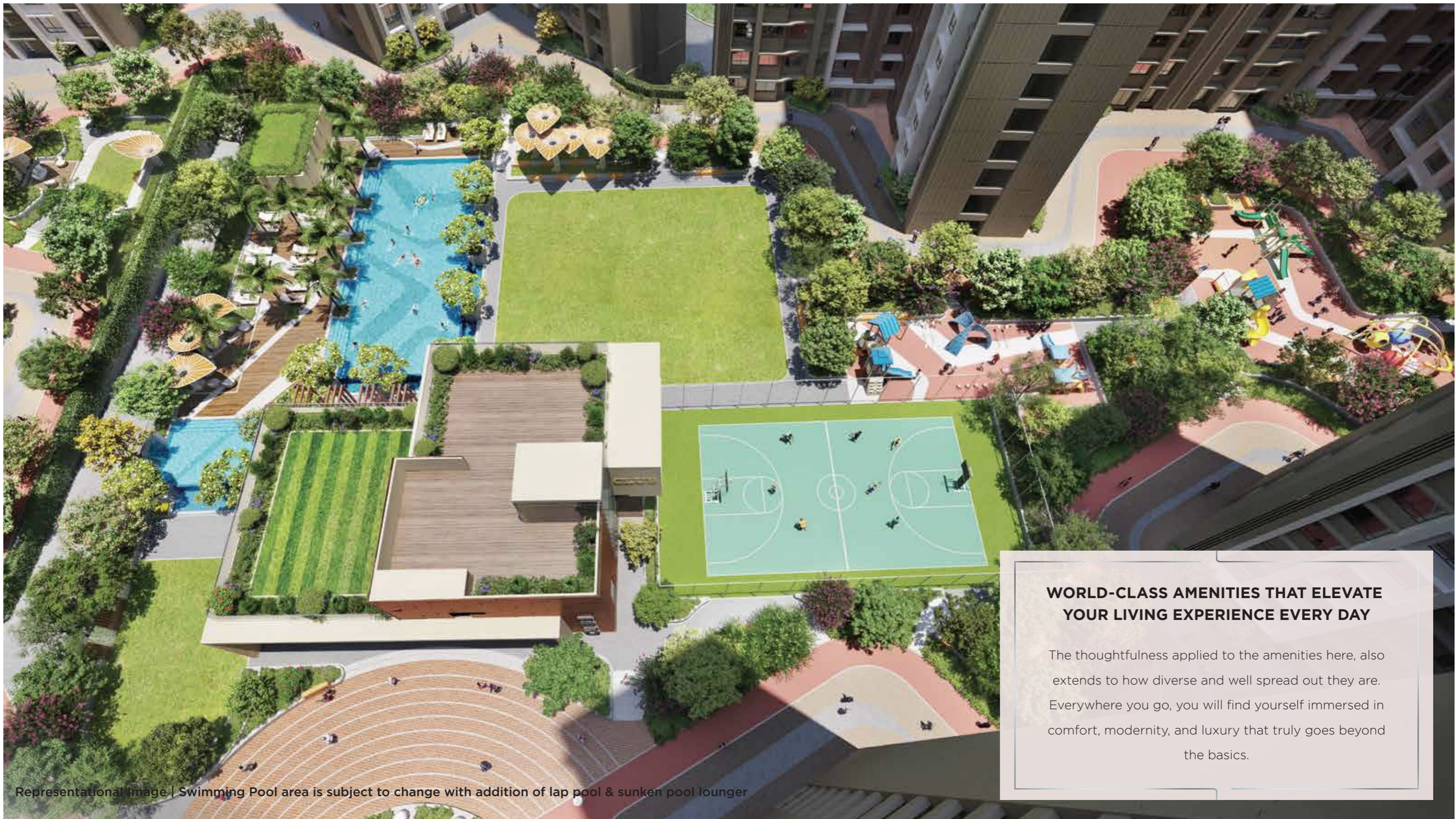
Representational image | Swimming Pool area is subject to change with addition of lap pool & sunken pool lounge