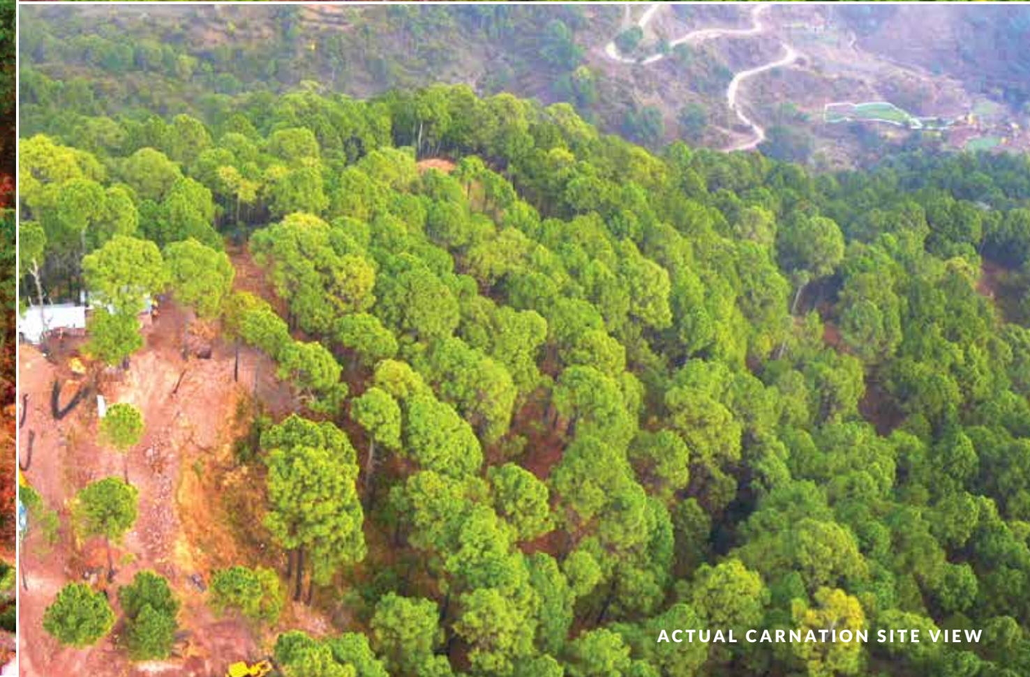
ACTUAL CARNATION SITE VIEW