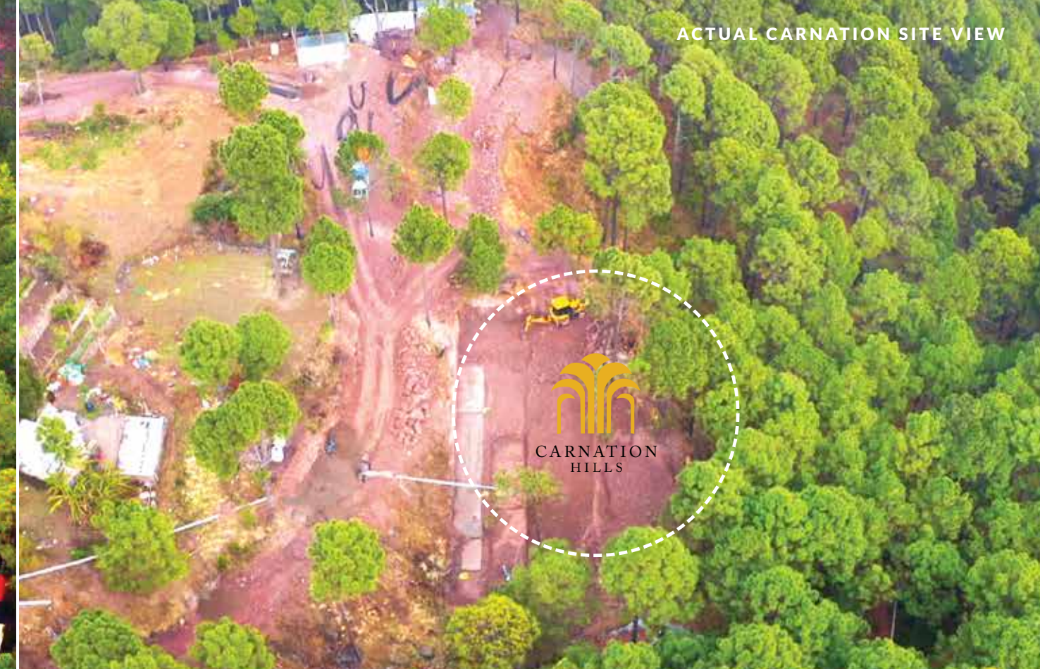
ACTUAL CARNATION SITE VIEW