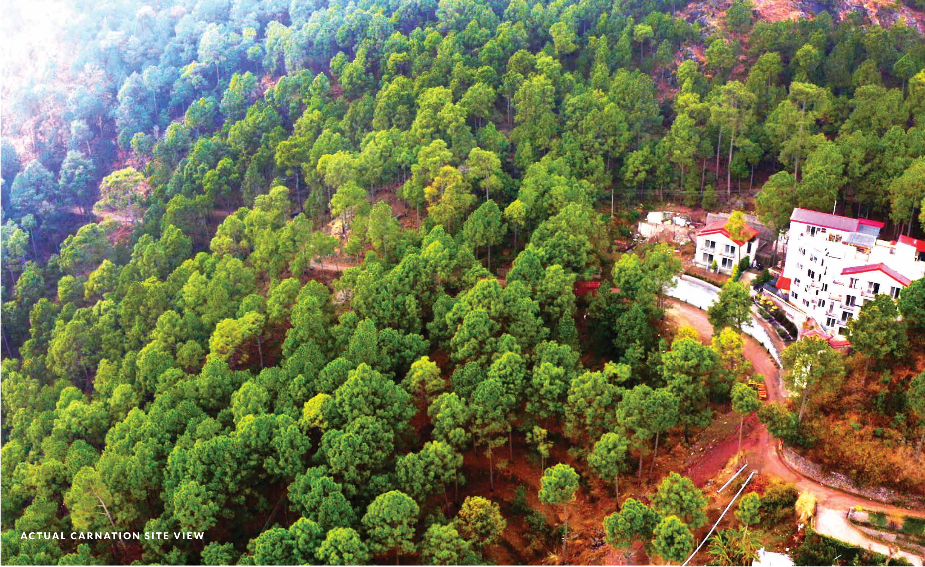
ACTUAL CARNATION SITE VIEW