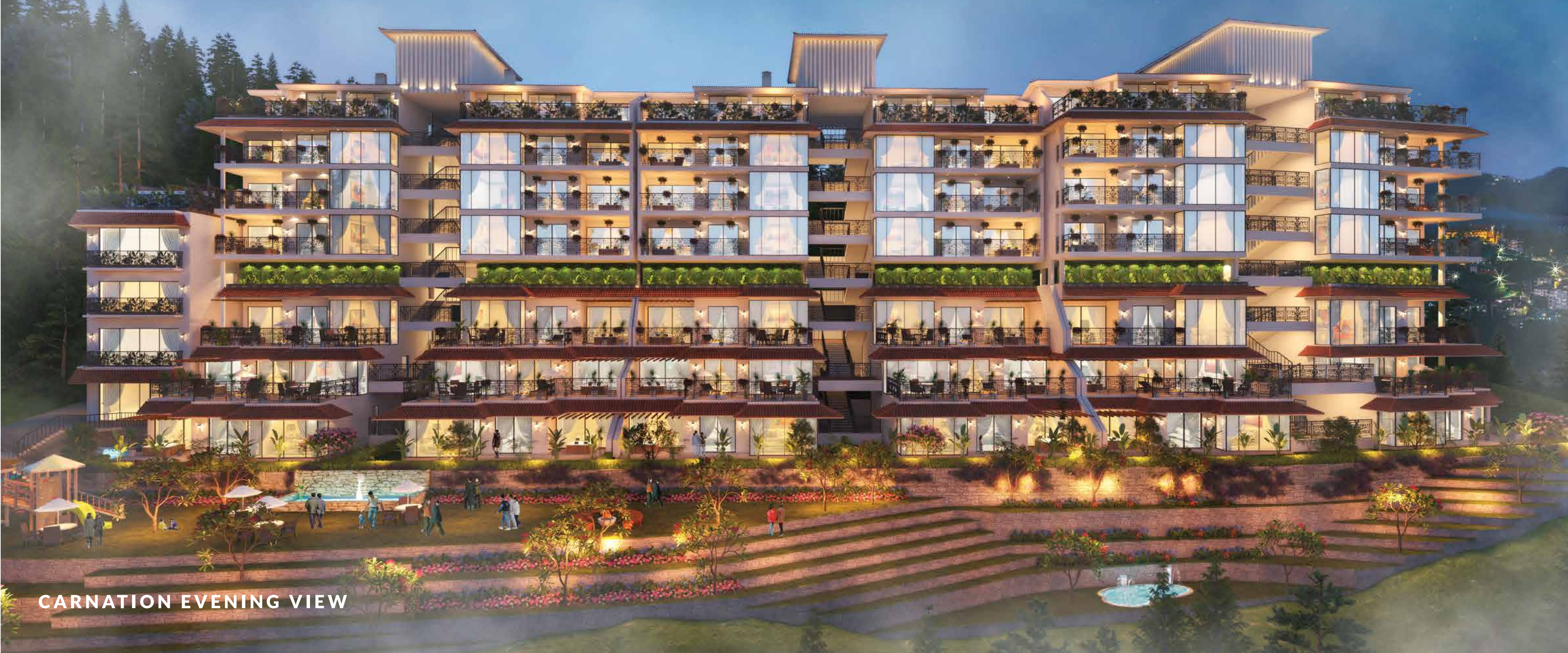
CARNATION EVENING VIEW