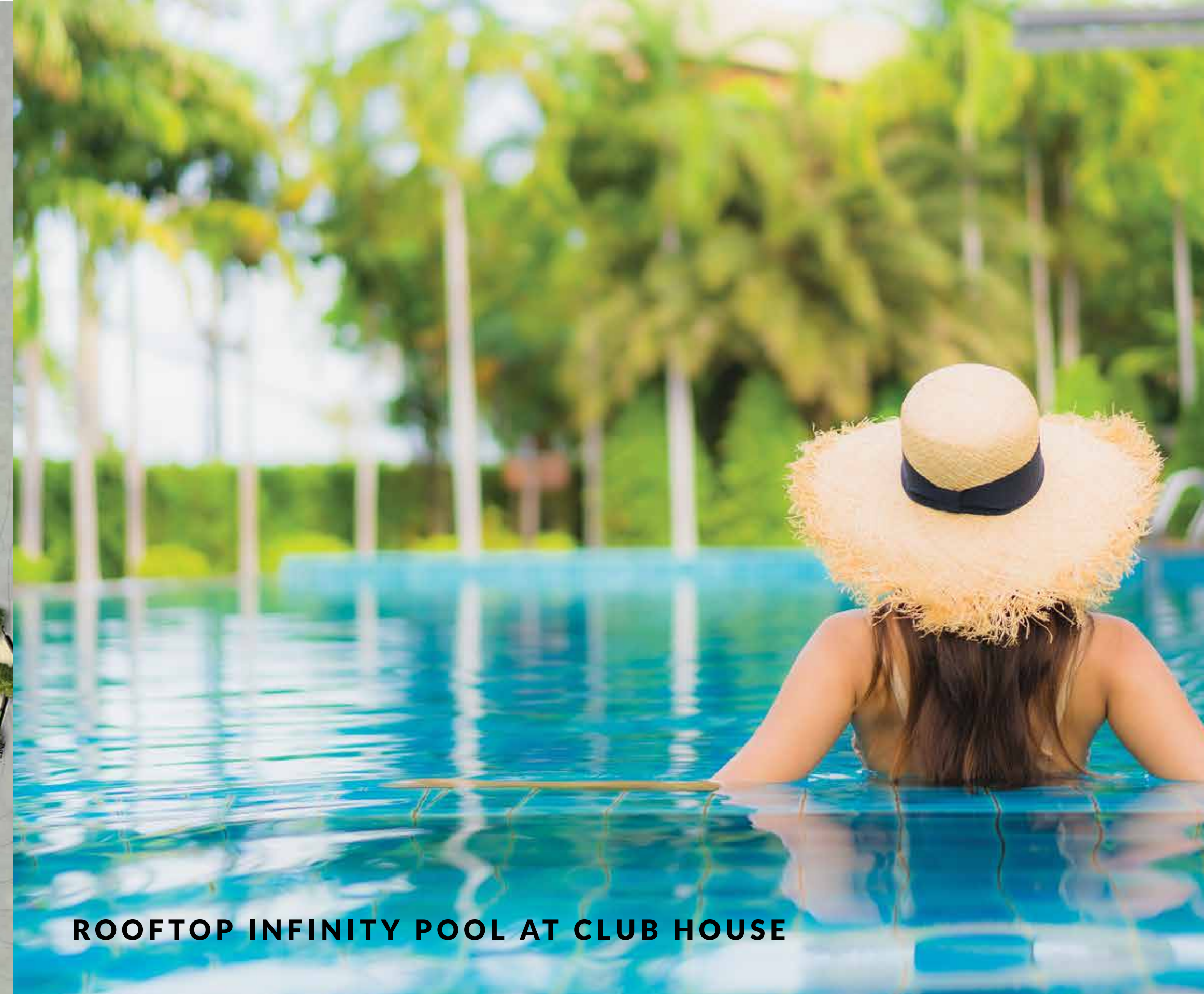
ROOFTOP INFINITY POOL AT CLUB HOUSE