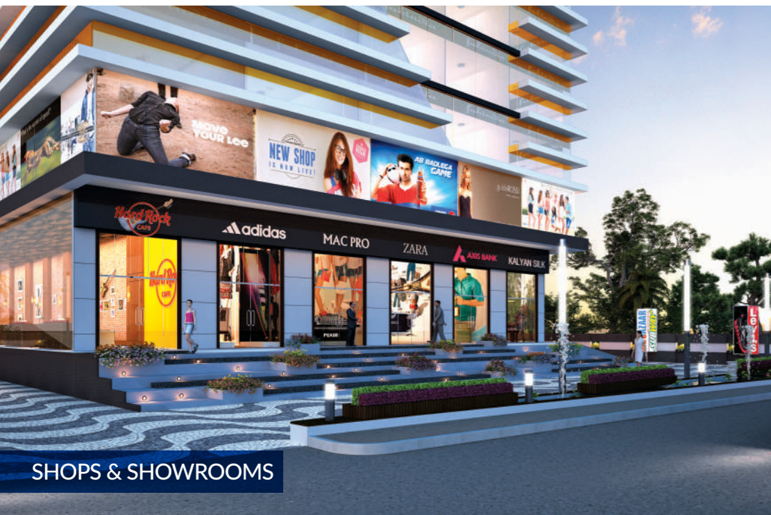
SHOPS & SHOWROOMS