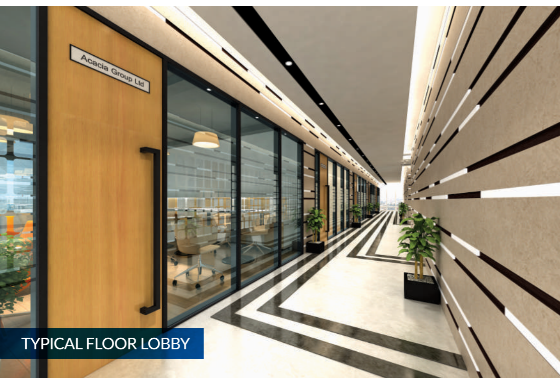
TYPICAL FLOOR LOBBY

The mission, vision, objectives and goal of your venture are well defined in your mind and you are ready with the impeccable blueprint to success. Undoubtedly with the determined efforts of you, success is no far. If now what you are looking for is a great place to give pace to your great business plans, then you are at the just right place.