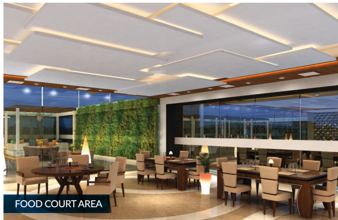
FOOD COURT AREA

The mission, vision, objectives and goal of your venture are well defined in your mind and you are ready with the impeccable blueprint to success. Undoubtedly with the determined efforts of you, success is no far. If now what you are looking for is a great place to give pace to your great business plans, then you are at the just right place.