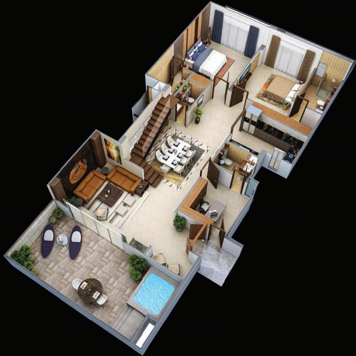
Isometric View-Lower Floor Sky Villa