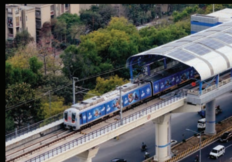
15 minutes from Noida, Sector-62