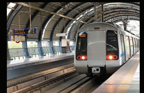
5 minutes from proposed metro station