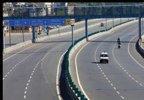
Located at 14 lane NH-24