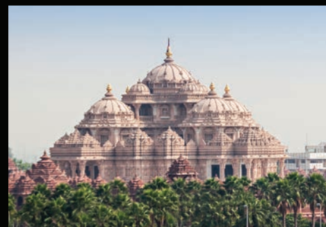
30 minutes away from Akshardham Temple, Delhi