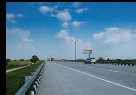
6 minutes from Eastern Peripheral Expressway