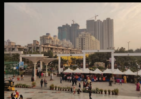
15 minutes from Indirapuram, Ghaziabad