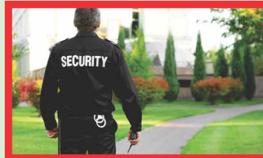
3-Tier Security System