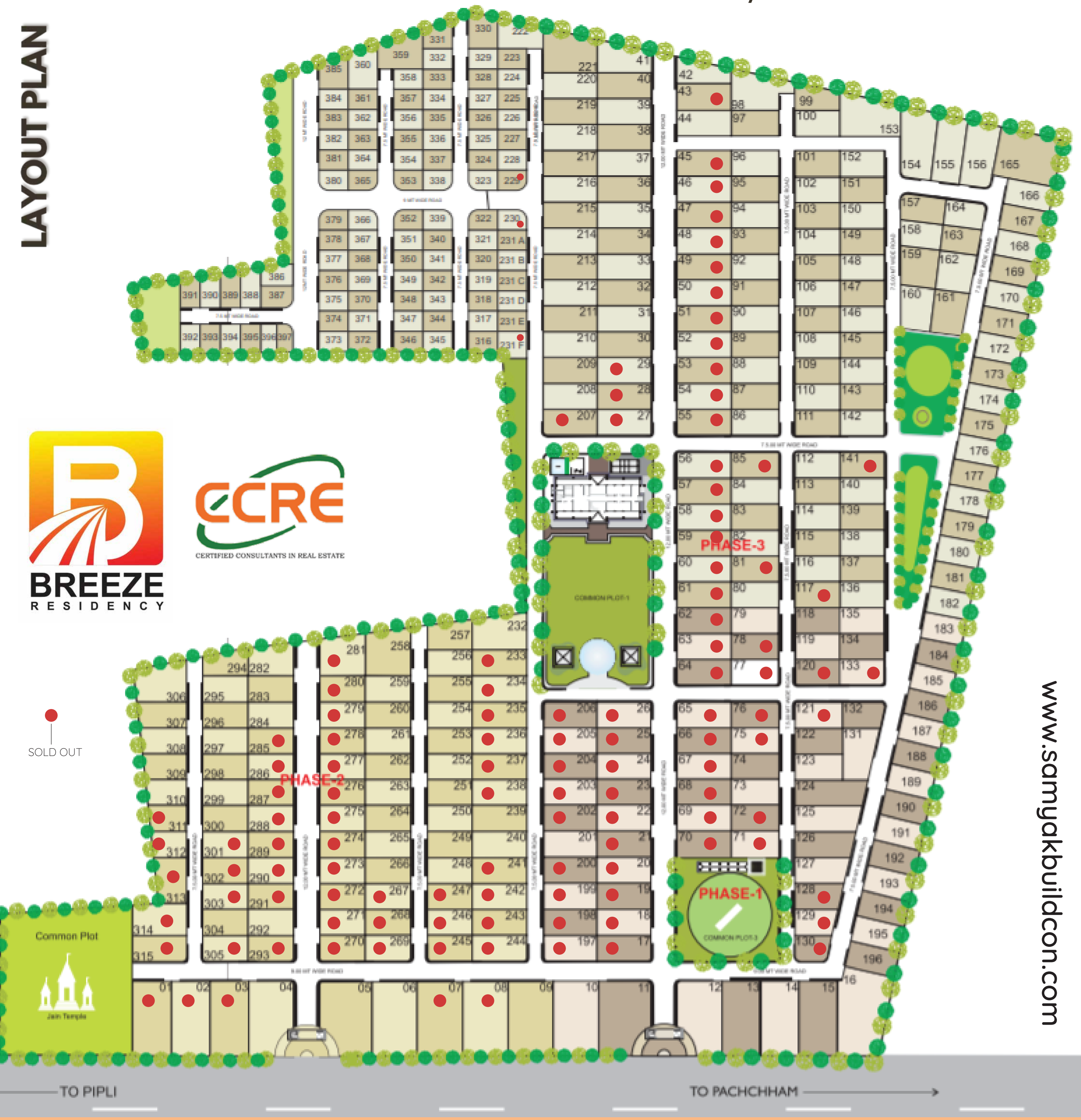
Book yours now!

+91 98184 16465 Book a free site visit with us!