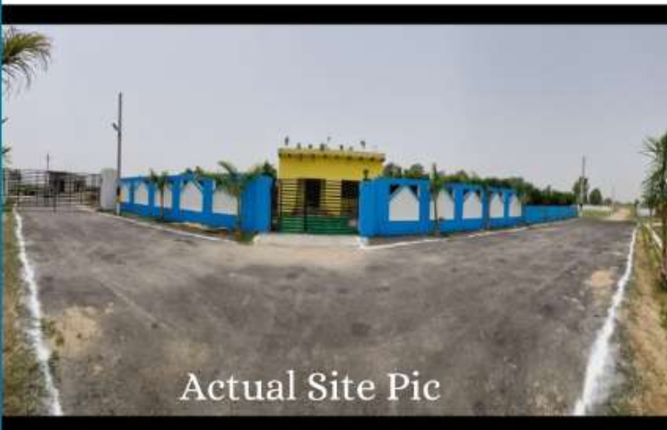
Actual Site Pic

Well- connected to Yamuna Expressway, Noida Expressway, & Eastern Peripheral Expressway.