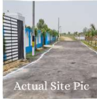
Actual Site Pic