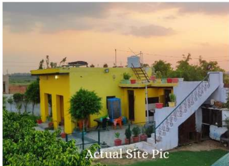
Actual Site Pic

Noida International Airport will open doors to multiple job opportunities