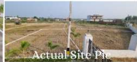
Actual Site Pic