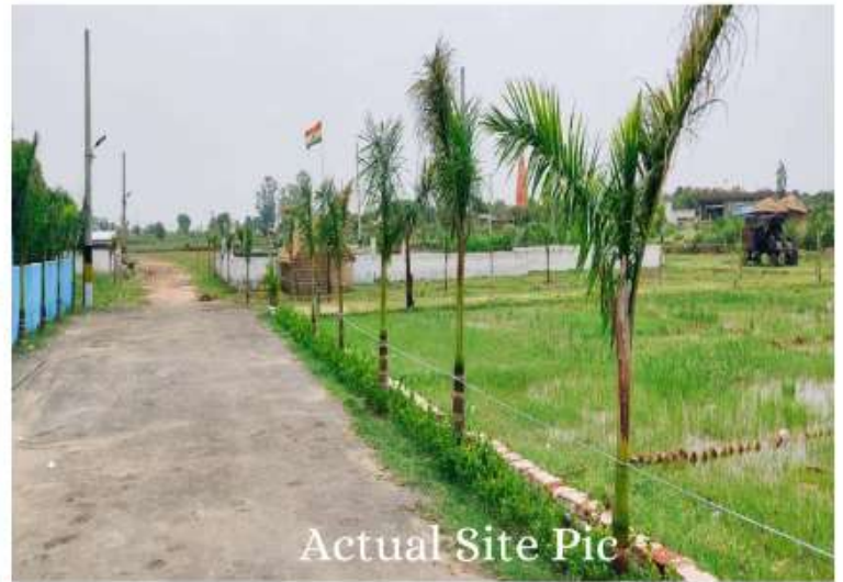
Actual Site Pic