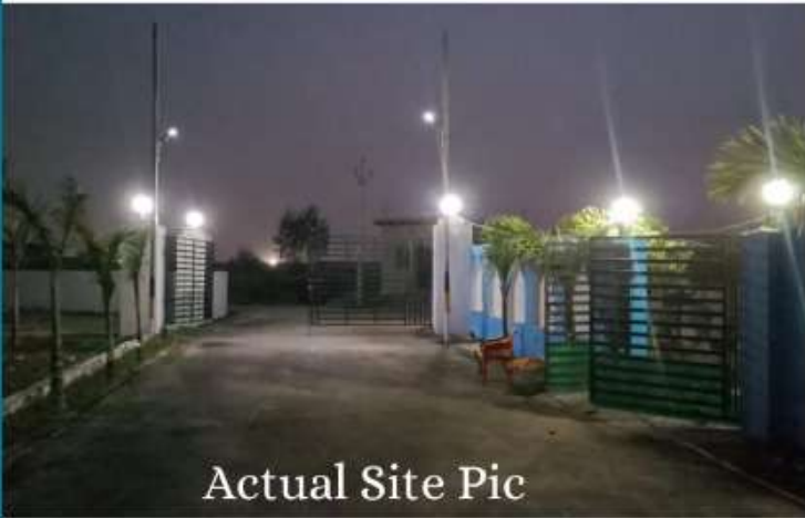
Actual Site Pic