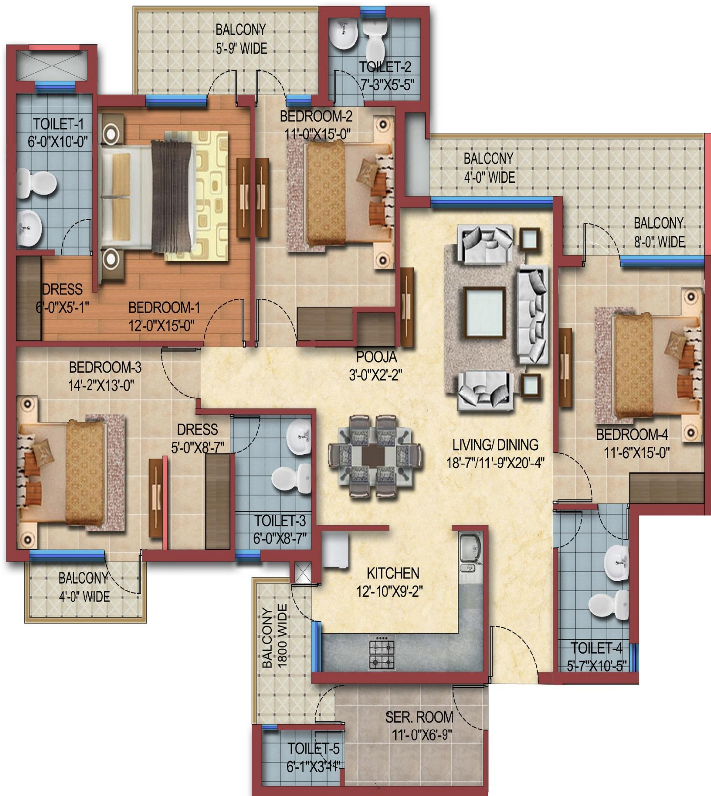
UNIT PLAN 2 & 3