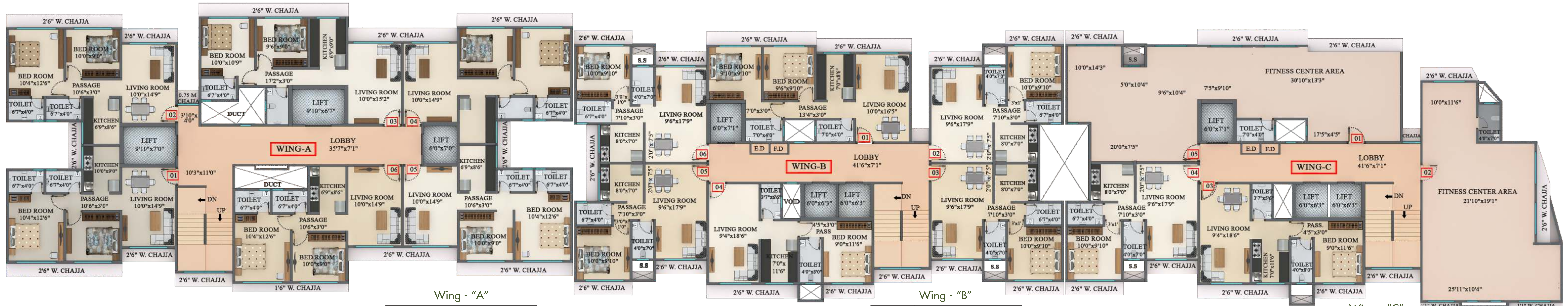
Wing - "A"