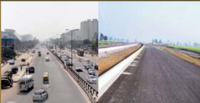
Actual photographs of the Gurugram - Sohna Road.