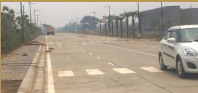
Actual site photographs of Raheja Aranya City.