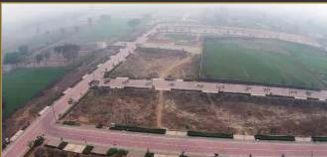
Actual site photographs of Raheja Aranya City.