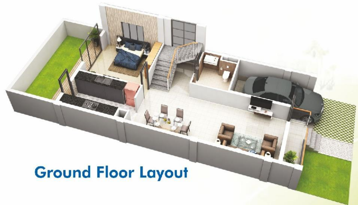
Ground Floor Layout