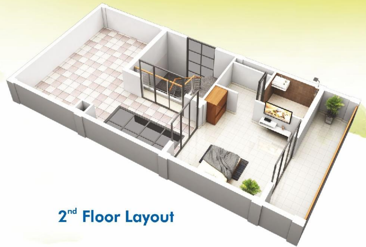
2 nd Floor Layout