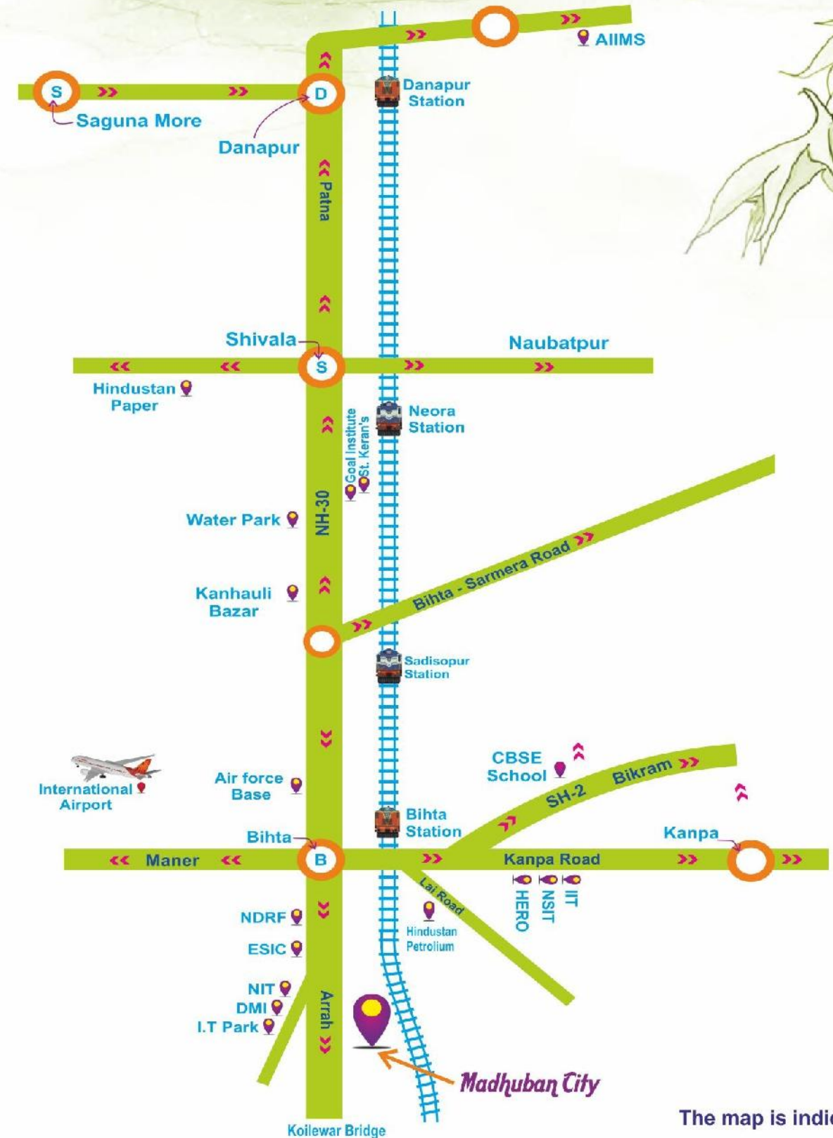
The map is indicative & not to scale