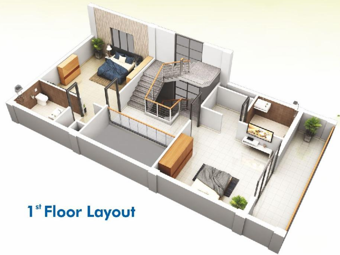
1 st Floor Layout