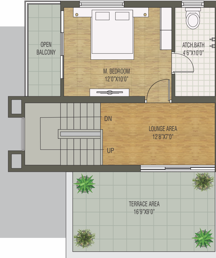
★ ★ ★ First Floor Plan