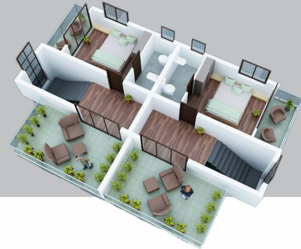
★ ★ ★ First Section View