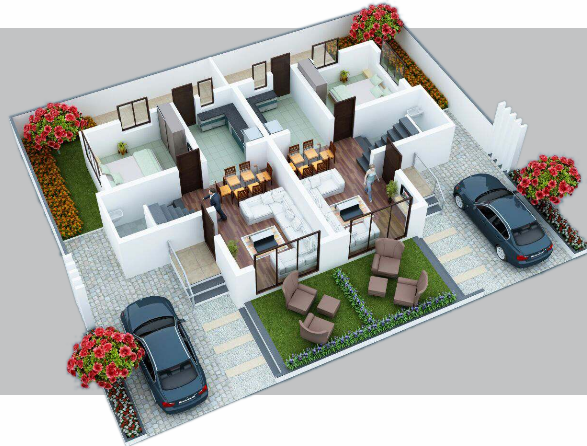
★ ★ ★ Ground Section View