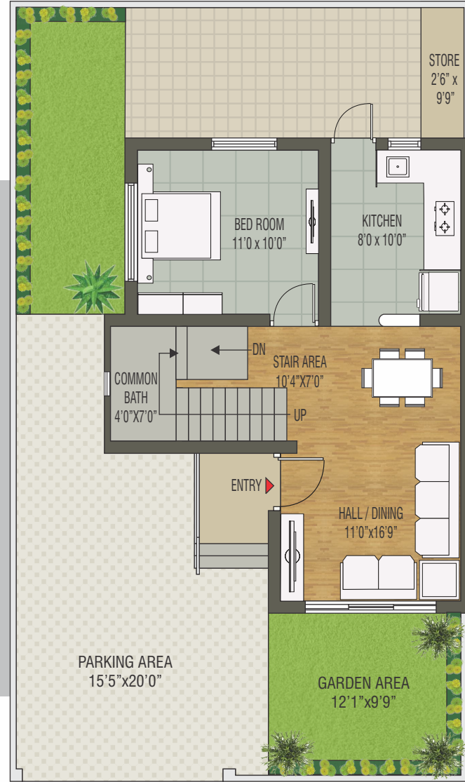
★ ★ ★ Ground Floor Plan