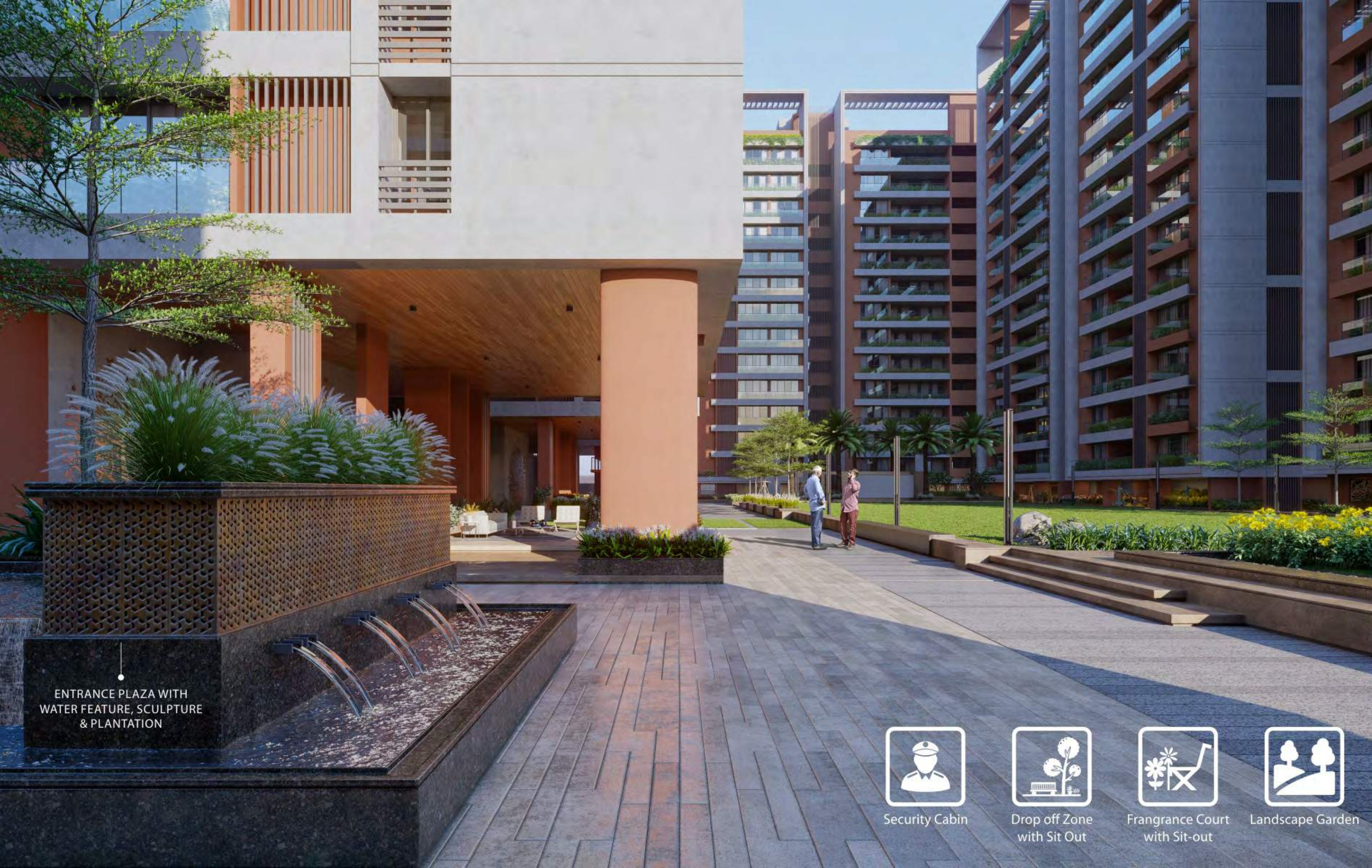
ENTRANCE PLAZA WITH WATER FEATURE, SCULPTURE & PLANTATION