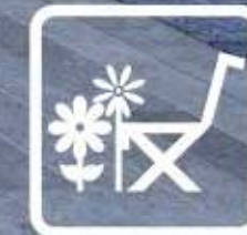
Frangrance Court with Sit-out