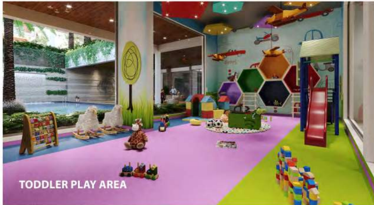
TODDLER PLAY AREA