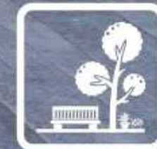
Drop off Zone with Sit Out