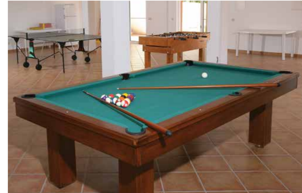
An Indoor Games Room to turn neighbours into friends.