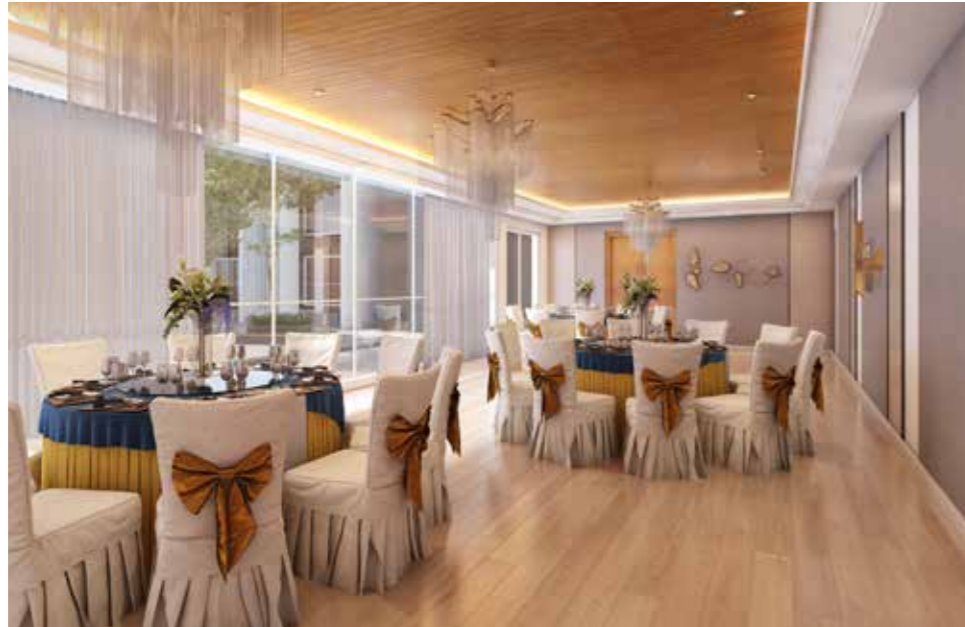
A Banquet Hall for celebrations that turn into unforgettable memories.