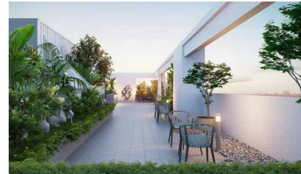
Rooftop Seating Area: The perfect place to enjoy a sunrise, a sunset and everything in between.