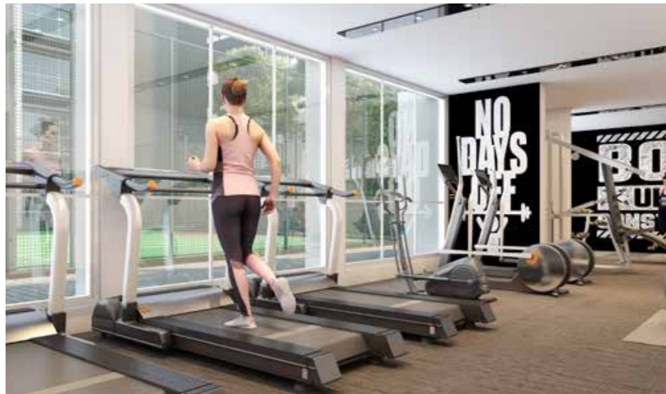
A Fitness Centre to make self-care part of the routine.