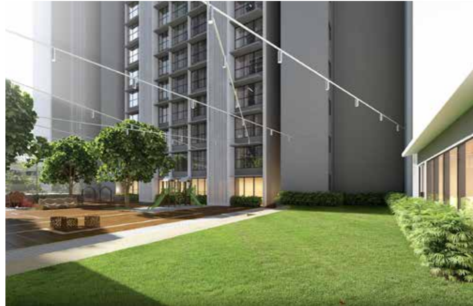
Open To Sky Podium: So you never miss the sun, the breeze and the great outdoors.