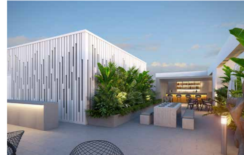
Rooftop Bar and Party Lounge: To turn ordinary evenings with friends into evenings to remember.