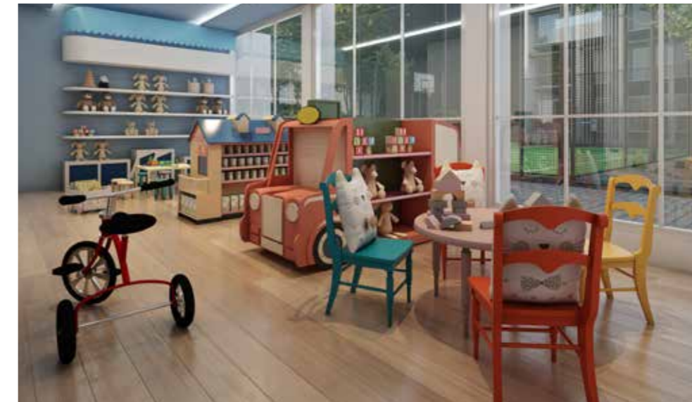
A Children's Play Area where there's just one rule: fun.