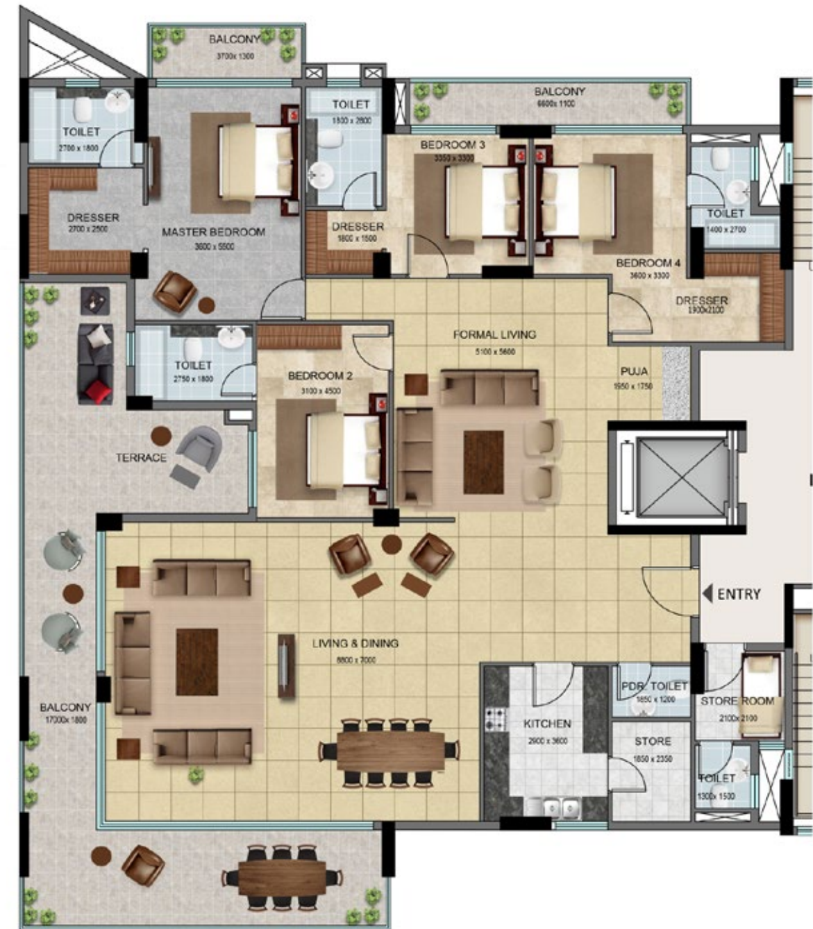
Disclaimer: The project comprises of Apartments and is being developed in accordance with the sanctioned plans. The Apartments may be sold as per the standard design and the company may make changes/alterations/improvements with the consent of the customer.