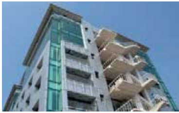
SHALIMAR TOWER, VIBHUTI KHAND, LUCKNOW