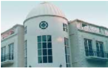
SHALIMAR COURT, RANI LAKSHMIBAI MARG, LUCKNOW