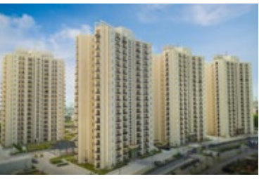
VISTA, GOMTI NAGAR EXTENSION, LUCKNOW UPRERAPRJ4833