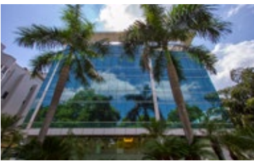
SHALIMAR LOGIX, RANA PRATAP MARG, LUCKNOW