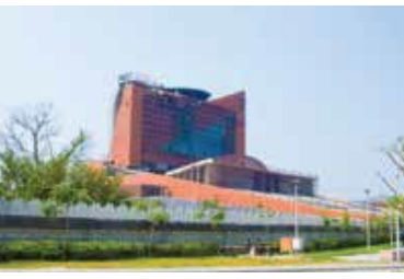
JPNIC, GOMTI NAGAR, LUCKNOW