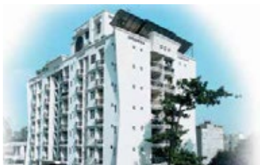
SHALIMAR APARTMENTS, P.N ROAD, LUCKNOW