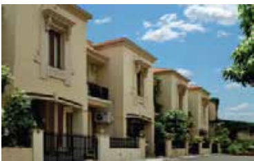
SHALIMAR HOMES, ASHOK MARG, LUCKNOW