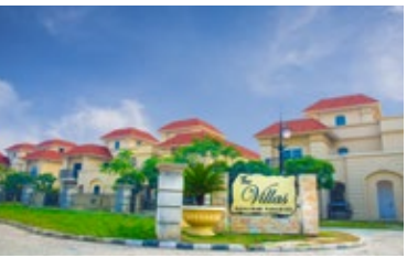
SHALIMAR PARADISE, LUCKNOW - FAIZABAD ROAD UPRERAPRJ9777