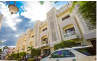
SHALIMAR MEADOWS, GOKHALE MARG, LUCKNOW