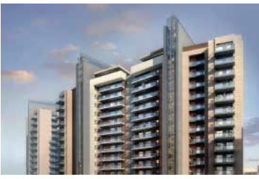
BELVEDERE COURT 1, GOMTI NAGAR EXTENSION, LUCKNOW UPRERAPRJ12850