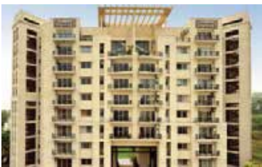
SHALIMAR IMPERIAL, GOKHALE MARG, LUCKNOW