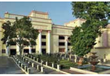
MULTILEVEL PARKING, HAZRATGANJ, LUCKNOW