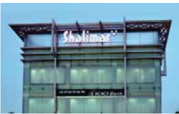
SHALIMAR STAR, RANA PRATAP MARG, LUCKNOW