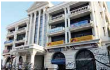
SHALIMAR SQUARE, LALBAGH, LUCKNOW