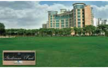
SHALIMAR CORPORATE PARK, VIBHUTI KHAND, LUCKNOW