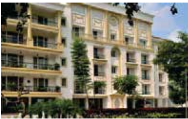
SHALIMAR COURTYARD, SITAPUR ROAD, LUCKNOW