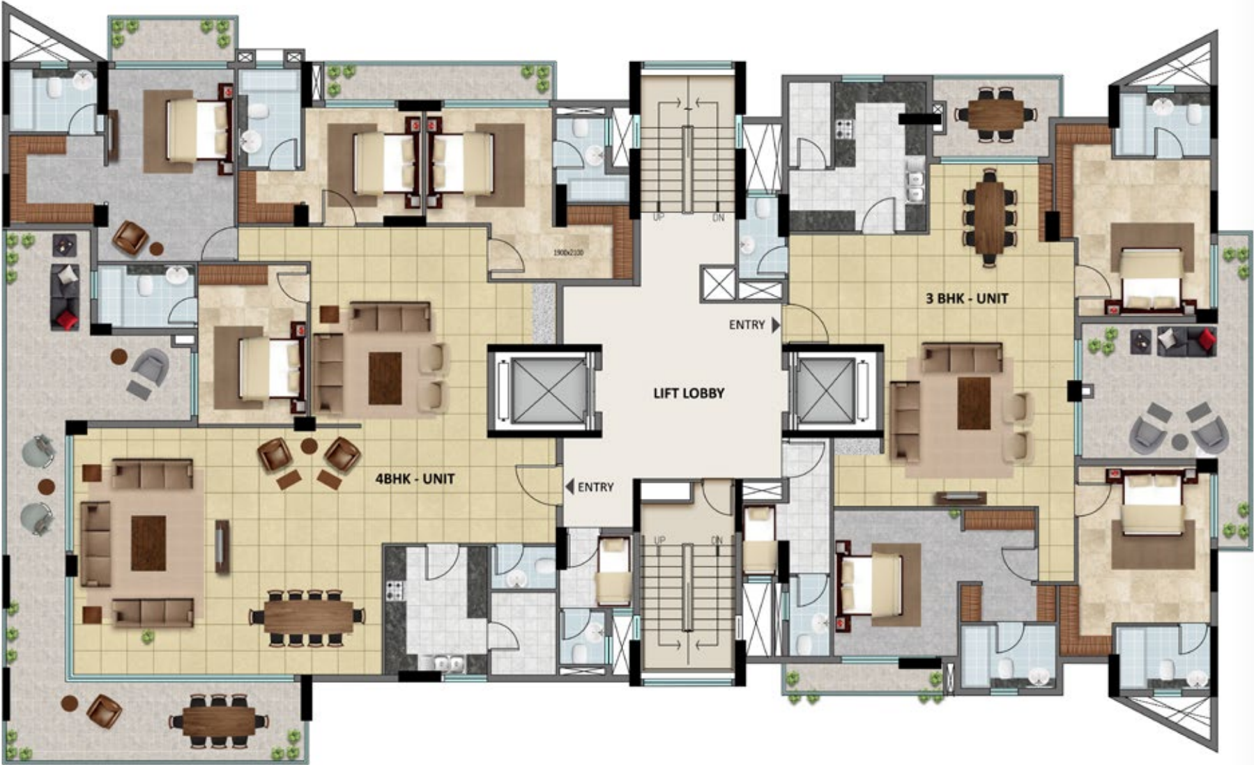
TYPICAL FLOOR PLAN PENTHOUSE (4BHK & 3BHK) TOWER B1