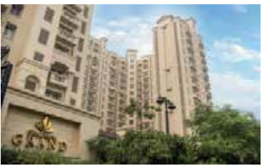
SHALIMAR GRAND, JOPLING ROAD, LUCKNOW