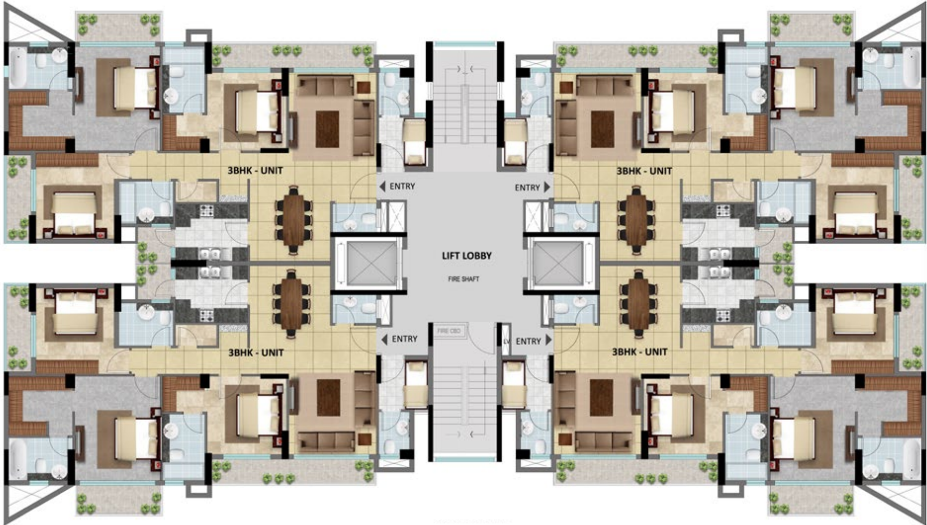
TYPICAL FLOOR PLAN (3BHK) TOWER C