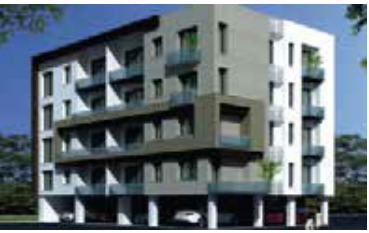
SHALIMAR NEST, VASANT KUNJ, DELHI / NCR