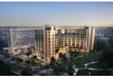
IRIDIUM, GOMTI NAGAR, LUCKNOW UPRERAPRJ17421