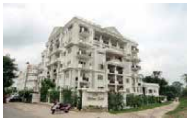
OEL SHALIMAR, NEW HYDERABAD, LUCKNOW