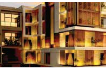
SHALIMAR RETREAT, ANAND NIKETAN, DELHI / NCR