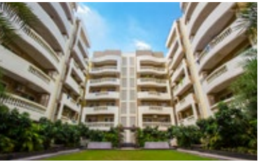
SHALIMAR DWELLING, AP SEN ROAD, LUCKNOW