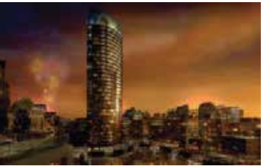
SHALIMAR ONE WORLD, GOMTI NAGAR EXTENSION, LUCKNOW UPRERAPRM10813