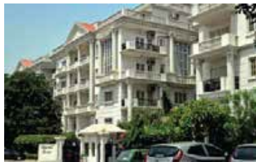
SHALIMAR ESTATE, NEW HYDERABAD, LUCKNOW