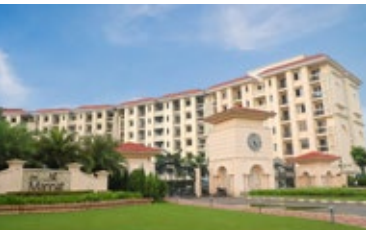
SHALIMAR MANNAT, LUCKNOW FAIZABAD ROAD UPRERAPRJ8345