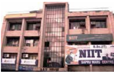
SAS HOUSE, SAPRU MARG, LUCKNOW