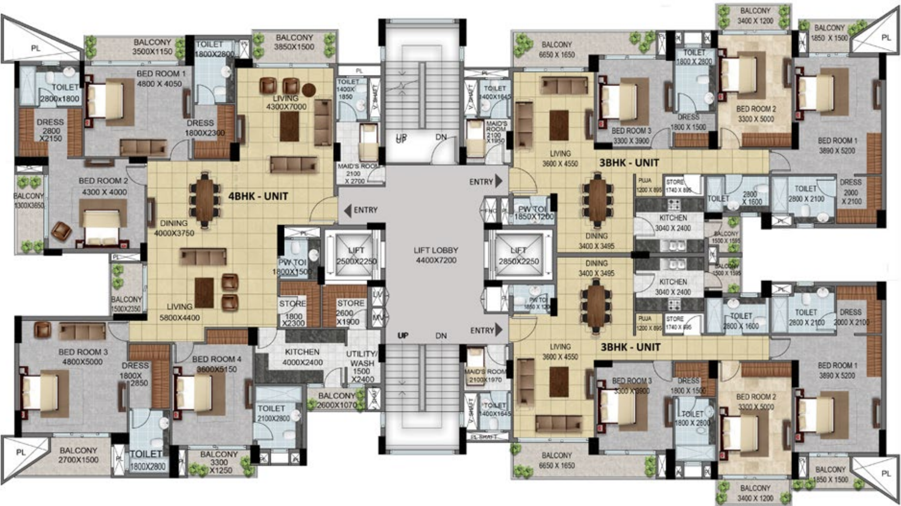
UNIT FLOOR PLAN 4 BHK - TOWER B2 (TYPE 01) 1 TO 19 FLOOR