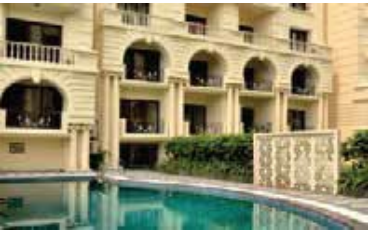
SHALIMAR EMERALD, JOPLING ROAD, LUCKNOW