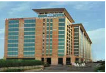
TITANIUM, GOMTI NAGAR, LUCKNOW