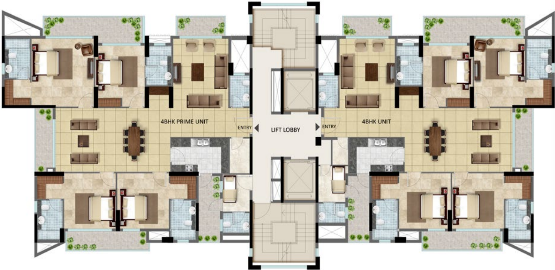
TYPICAL FLOOR PLAN (4BHK PRIME & 4BHK) TOWER A1