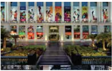
SHALIMAR ELLDEE PLAZA, BHOOTNATH MARKET, LUCKNOW