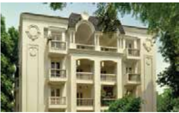
SHALIMAR ROYALE, MALL AVENUE, LUCKNOW