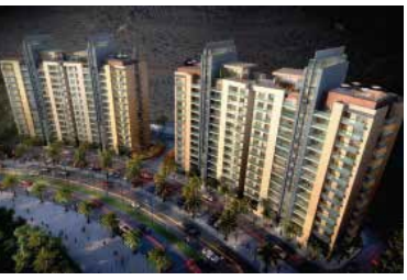
BELVEDERE COURT 2, GOMTI NAGAR EXTENSION, LUCKNOW UPRERAPRJ17338