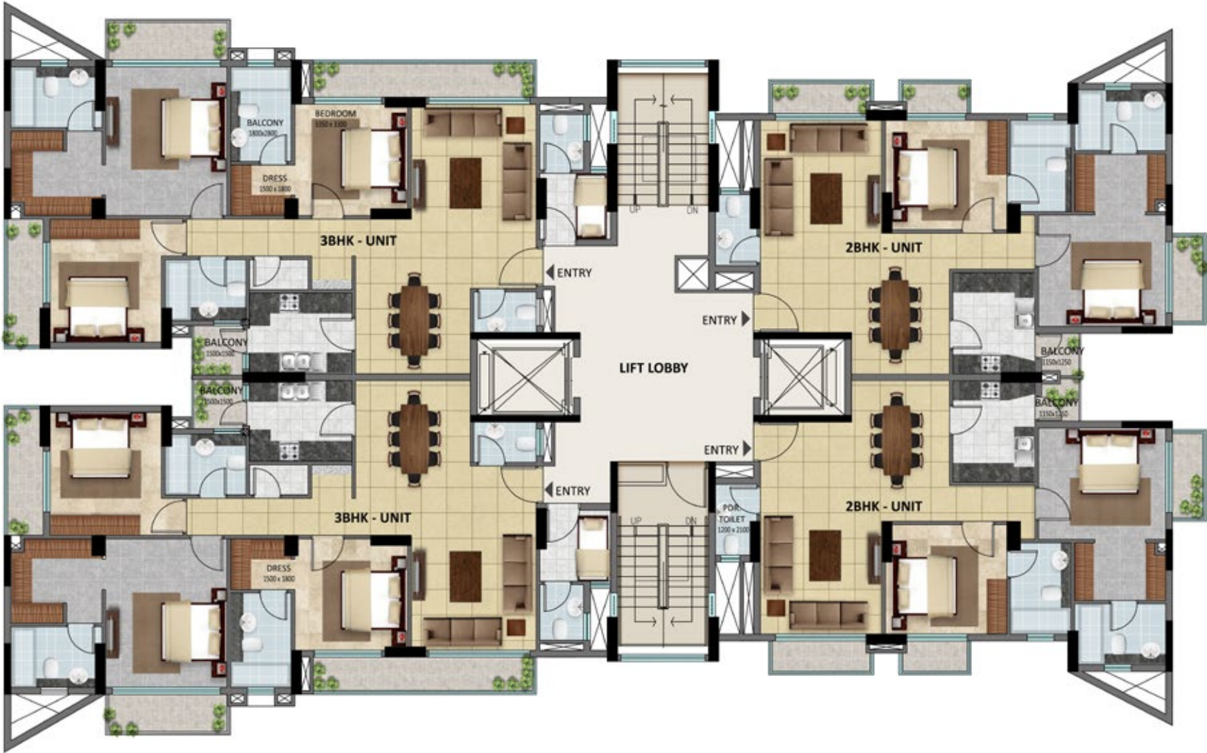
TYPICAL FLOOR PLAN (3BHK & 2BHK) TOWER B1