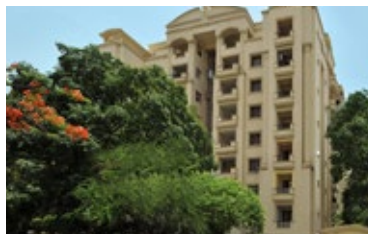
SHALIMAR HEIGHTS, JOPLING ROAD, LUCKNOW