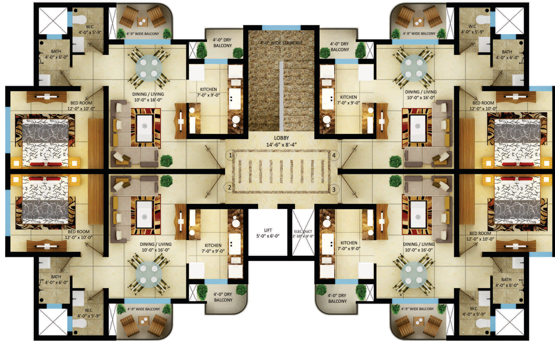
Area details (Sq. ft.):