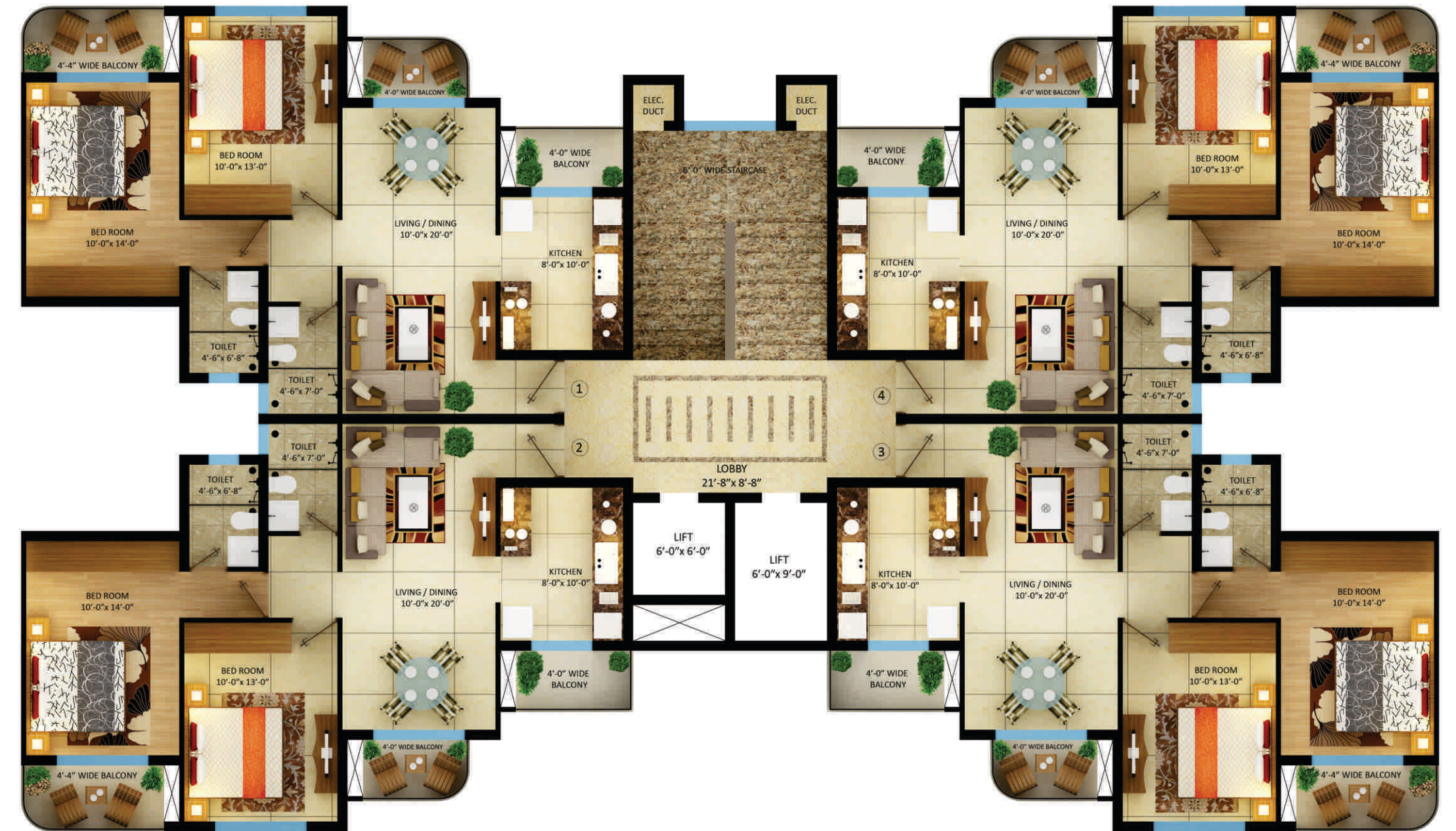
Area details (Sq. ft.):