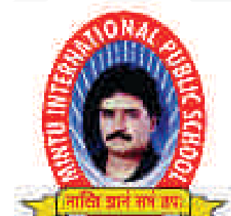
MIPs Logo required