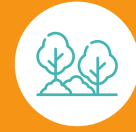
Beautiful Landscaped Gardens