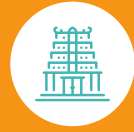
Lord Ganesh Temple