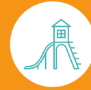
Children's Game and Activity Area