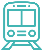
Railway Platform Touch