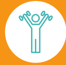
Health Club with Gymnasium