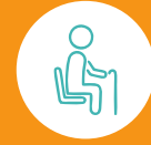
Senior Citizen Area