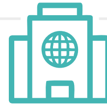
3km From District Headquarter