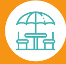
Open Community Area