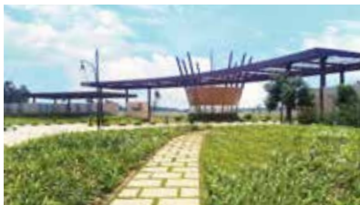
CENTURY ARTIZAN Yelahanka ₹2.6 cr onwards*