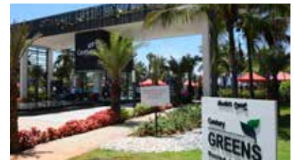
CENTURY GREENS Off IVC Road SOLD OUT (Look out for Phase II)

Century Real Estate Holdings Pvt. Ltd. is an integrated, full-service real estate development company headquartered in Bengaluru, India, with a rich history of developing premier projects and landmark buildings that spans four decades. Established in 1973, the organisation has contributed significantly in making Bengaluru the destination of choice for people from around the world.