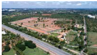
CENTURY SPORTS VILLAGE On IVC Road ₹52.95 L onwards*