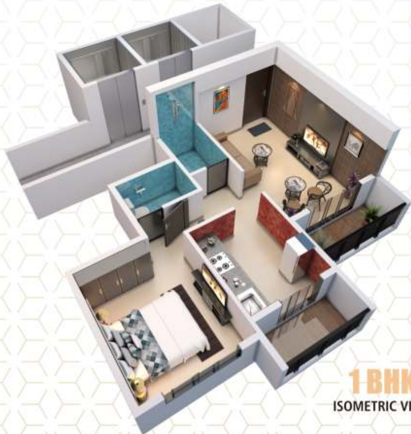
1 BHK ISOMETRIC VIEW