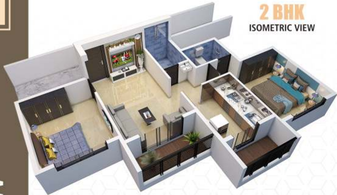
2 BHK ISOMETRIC VIEW