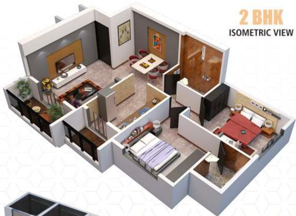
2 BHK ISOMETRIC VIEW