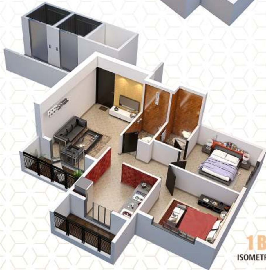
1 BHK ISOMETRIC VIEW