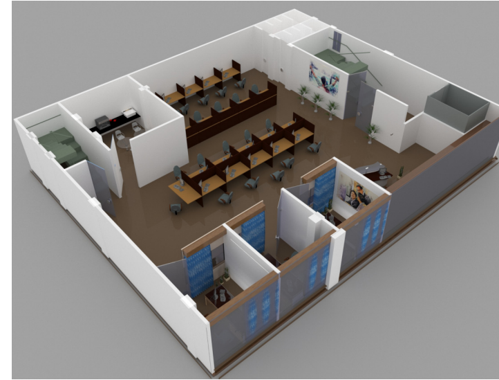
PROPOSED FLOOR PLAN FOR CORPORATE OFFICE