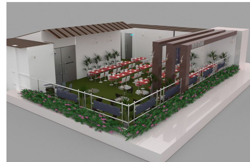
PROPOSED FLOOR PLAN FOR OPEN SKY RESTAURANT