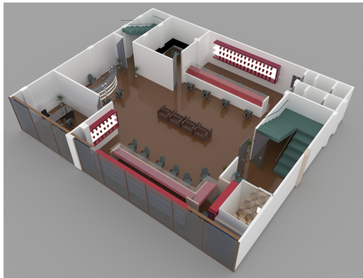
PROPOSED FLOOR PLAN FOR SHOWROOM