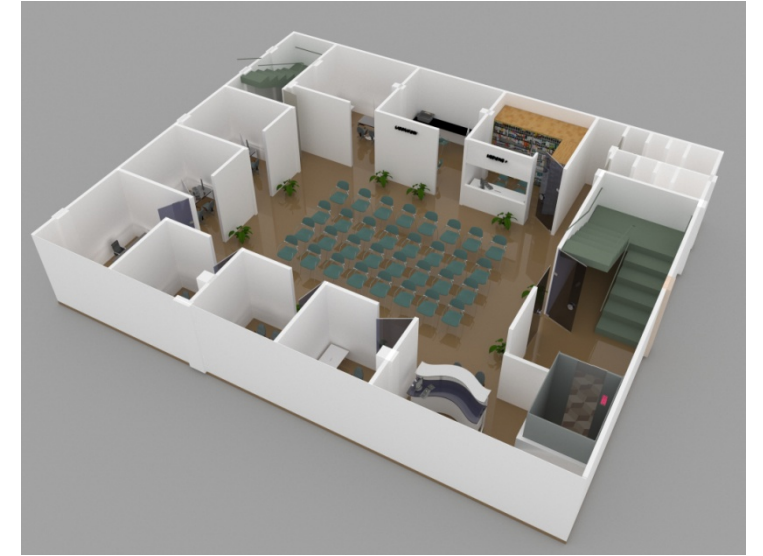
PROPOSED FLOOR PLAN FOR OUT PATIENT DOOR (OPD)