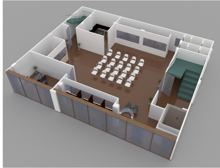
PROPOSED FLOOR PLAN FOR BANK