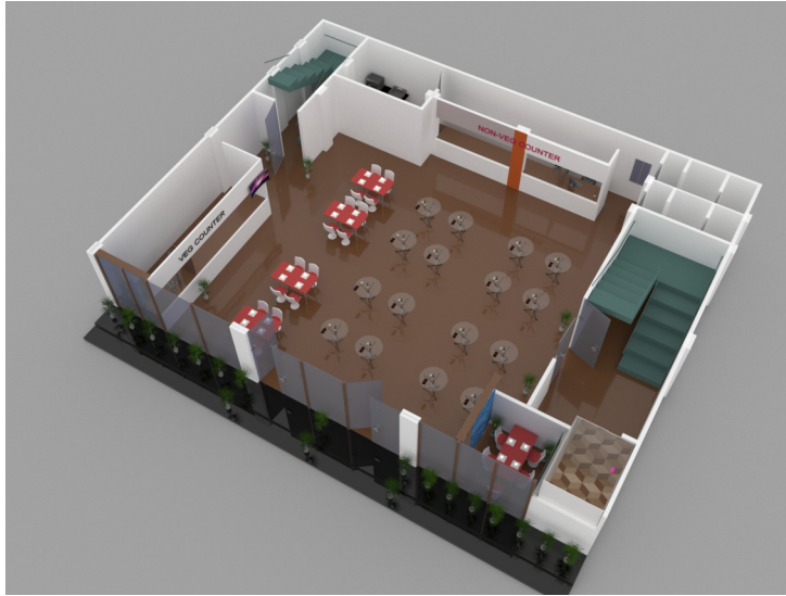
PROPOSED FLOOR PLAN FOR QUICK SERVICE RESTAURANT