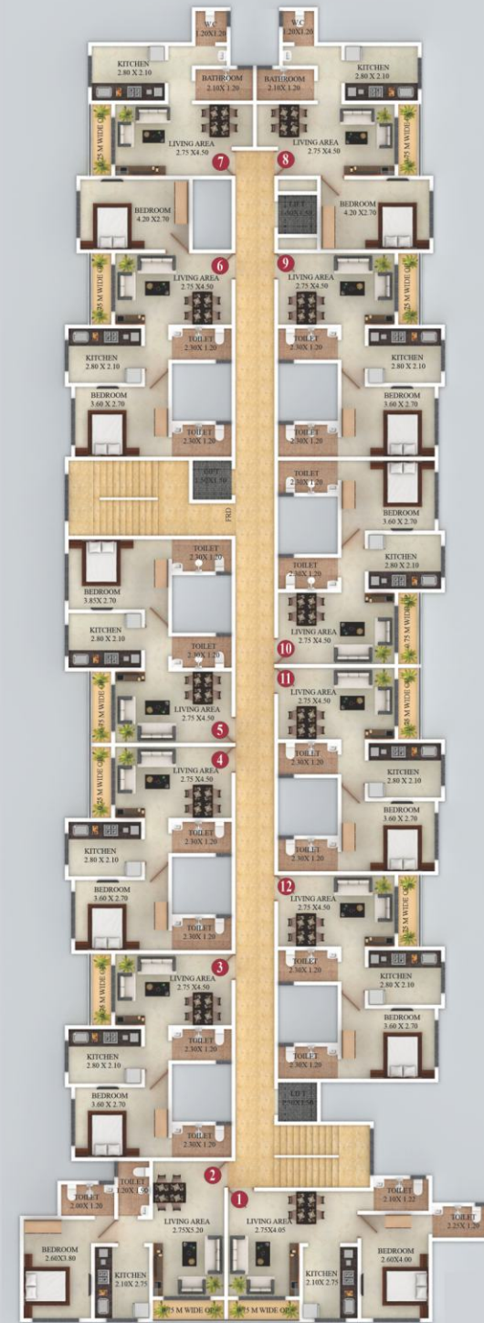
LOWER GROUND FLOOR PLAN