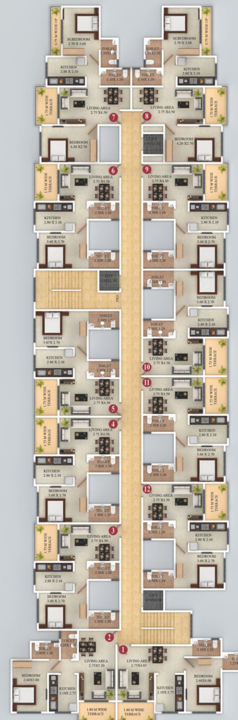
3RD, 5TH & 7TH FLOOR PLAN