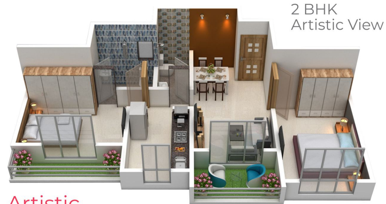
2 BHK Artistic View