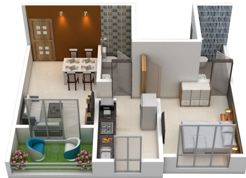
1 BHK Artistic View