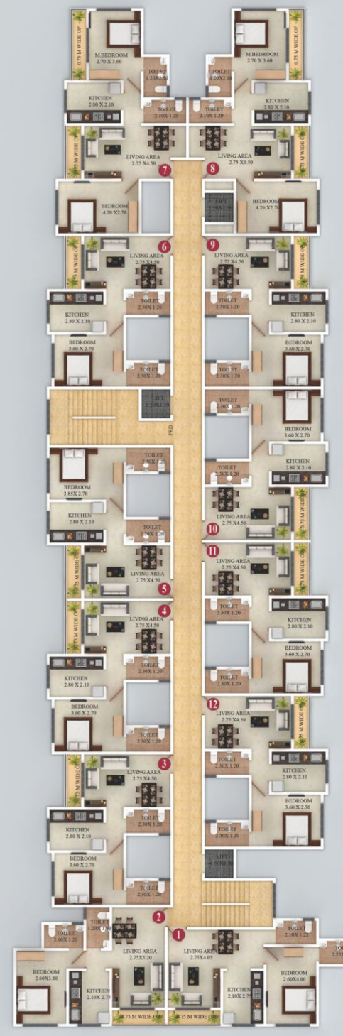
2ND, 4TH & 6TH FLOOR PLAN