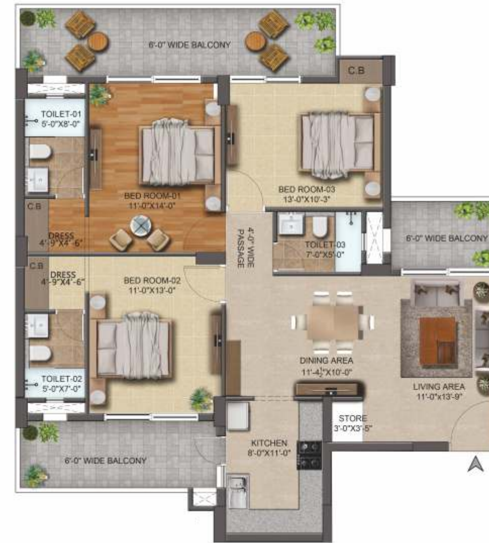
TOWER 1 (3BHK)

The premier residential project has been thoughtfully crafted, offering a great balance of splendour, space, and comfort. The interiors are draped in earthy hues to give a touch of warmth and elegance. Bathed in natural sunlight, the living spaces feel airy and spacious, always.