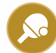
Table Tennis Area