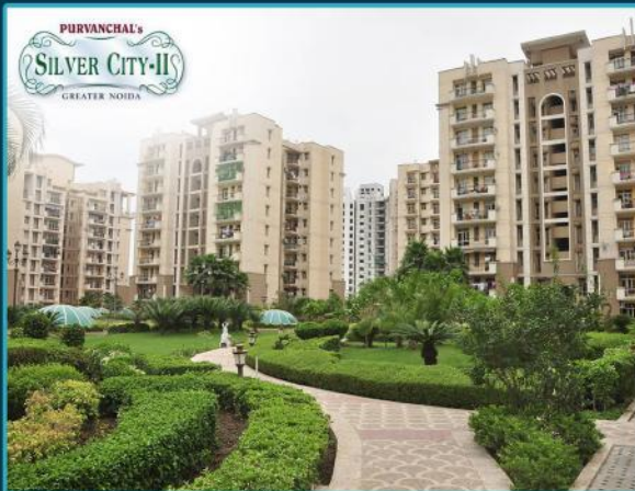
Purvanchal Silver City II (Gr. Noida)