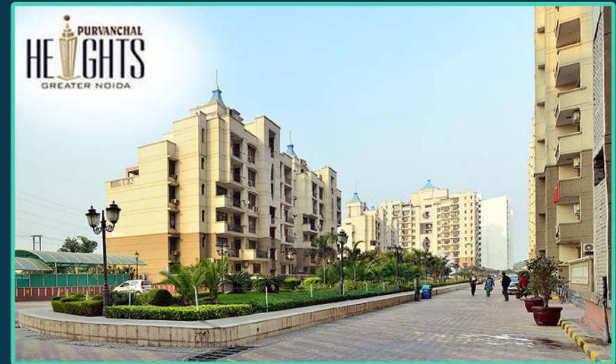
Purvanchal Heights (Gr. Noida)