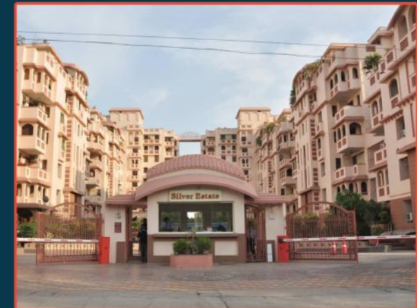
Purvanchal Silver Estate (Sec-50, Noida)

Disclaimer:- This contains Artistic Impression and no warranty is expressly or impliedly given that the completed development will comply in any degree with such artist's impression as depicted. This is not an offer, an invitation to offer and/or commitment of any nature. The furniture, accessories, paintings, items, electronic goods, additional fittings/fixtures, decorative items, false ceiling including shades, sizing and color of the tiles etc. in the image are only indicative in nature and do not form part of the standard specifications/amenities/services to be provided in the unit. All specifications and terms shall be as per the final agreement between the parties. The distances/estimated time of drive mentioned in the brochure is indicative/tentative. T&C apply.