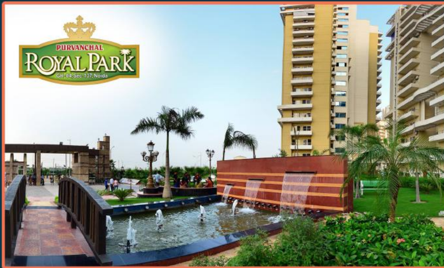
Purvanchal Royal Park (Sec-137, Noida)