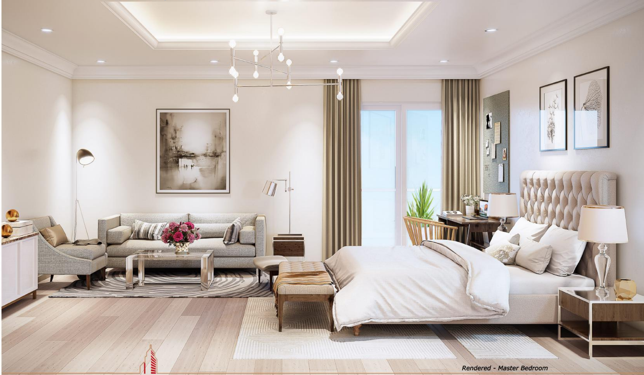
Rendered - Master Bedroom