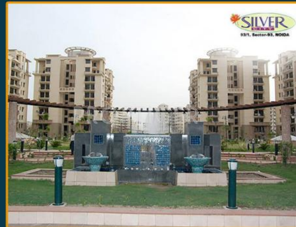
Purvanchal Silver City (Sec-93, Noida)