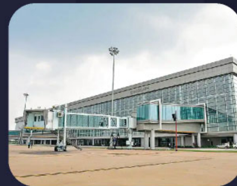
MOHALI INTERNATIONAL AIRPORT - 20 MIN