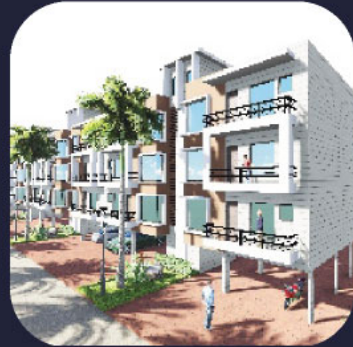
Bollywood Green City Phase 1

Ensuring delivery of successful residential townships: 'Bollywood Heights', 'Bollywood Heights 2' in Peer Muchalla, Zirakpur and an ongoing Green Residential Project of 32+ acres in Sector 113 Mohali, 'Bollywood Green City', where quality lifestyle and environment are relished by more than 500 families.