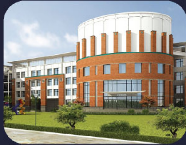
GURUKUL SCHOOL - 2 MIN