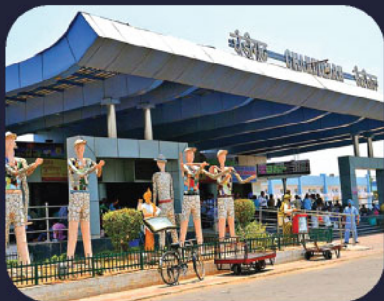
CHD RAILWAY/ BUS STATION - 20 MIN