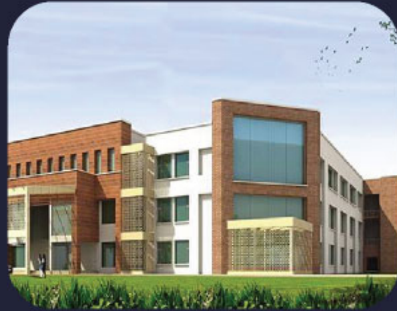
DELHI PUBLIC SCHOOL - 10 MIN