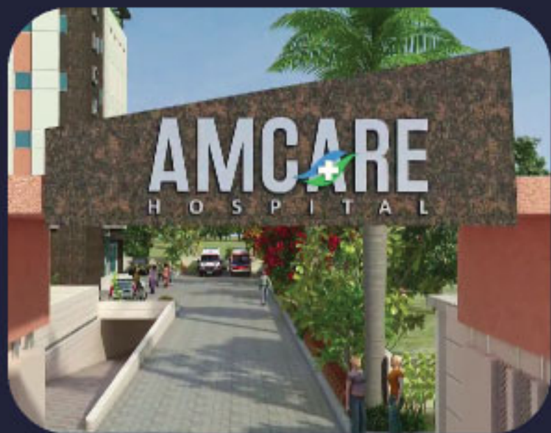
AMCARE HOSPITAL - 5 MIN