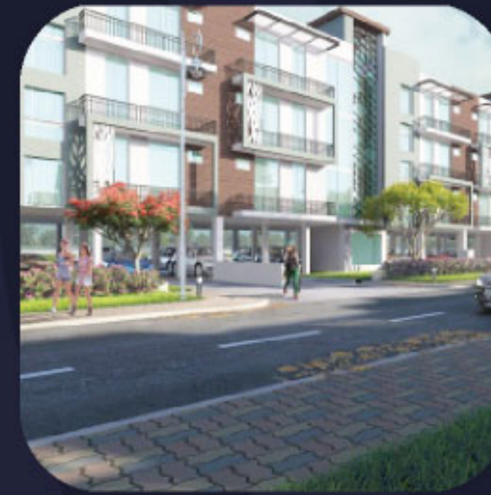
Bollywood Green City Phase 2