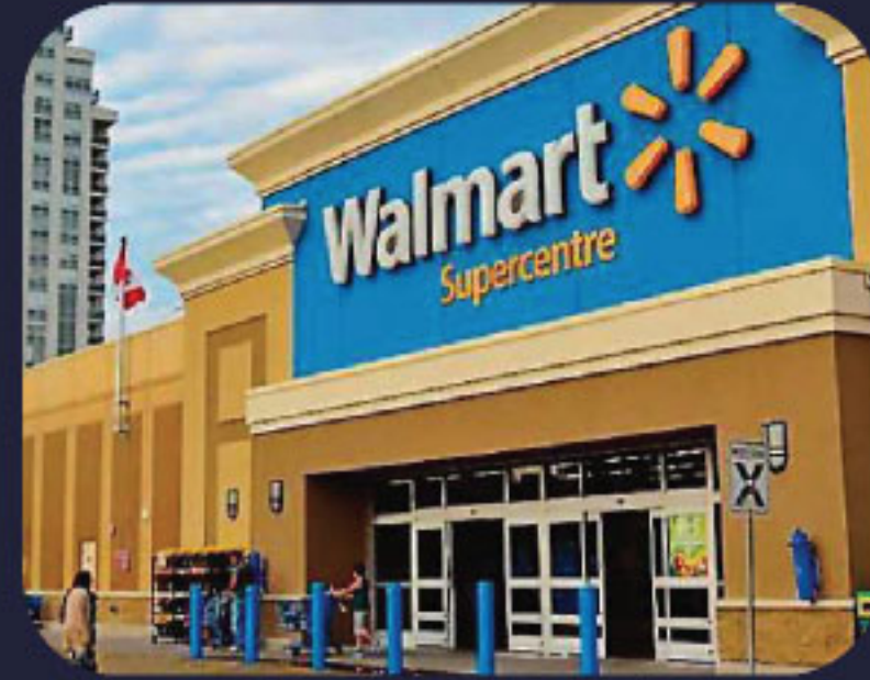
WALMART/ METRO/ D-MART - 7 MIN