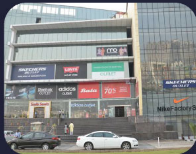
COSMO MALL - 3 MIN