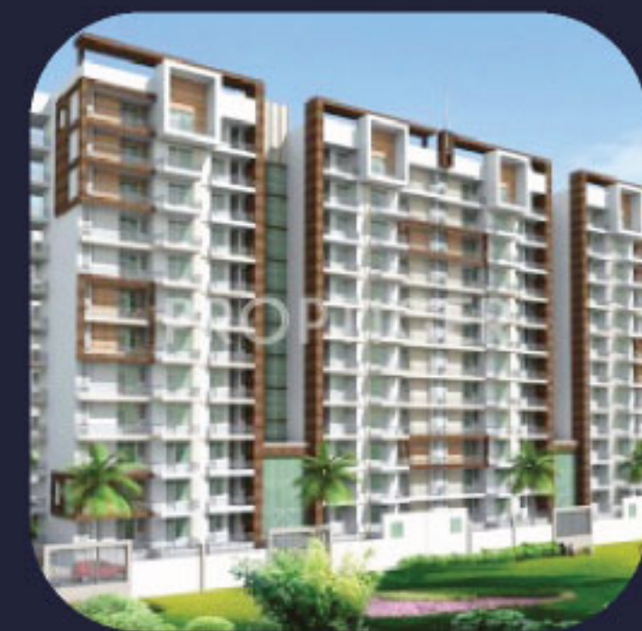
Bollywood Heights 2