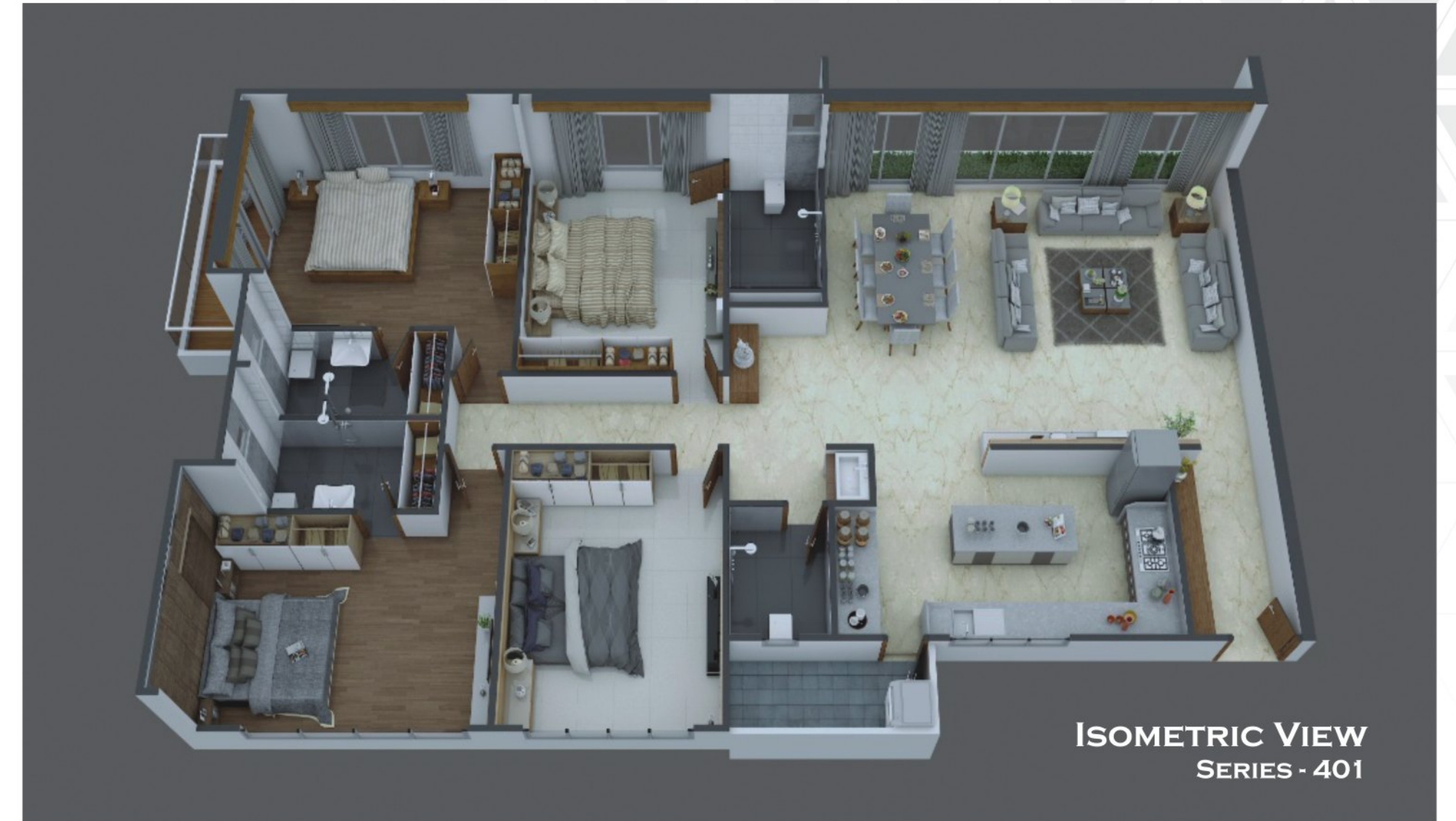
ISOMETRIC VIEW SERIES - 401