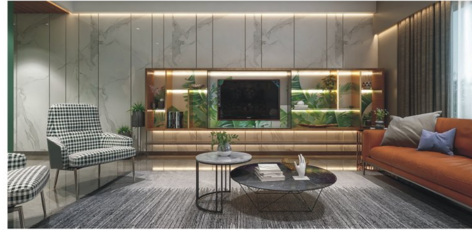
LIVING ROOM - VIEW 2