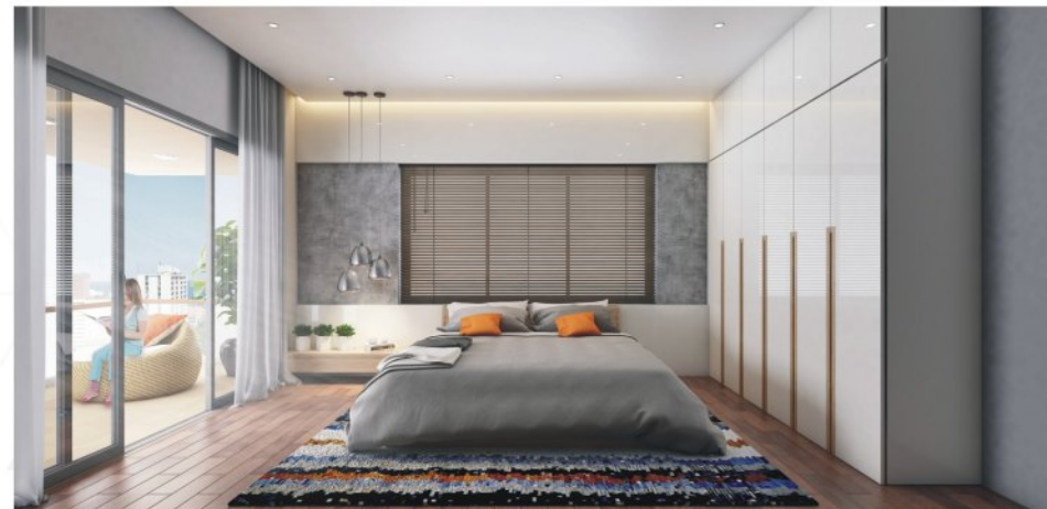
BEDROOM WITH BALCONY