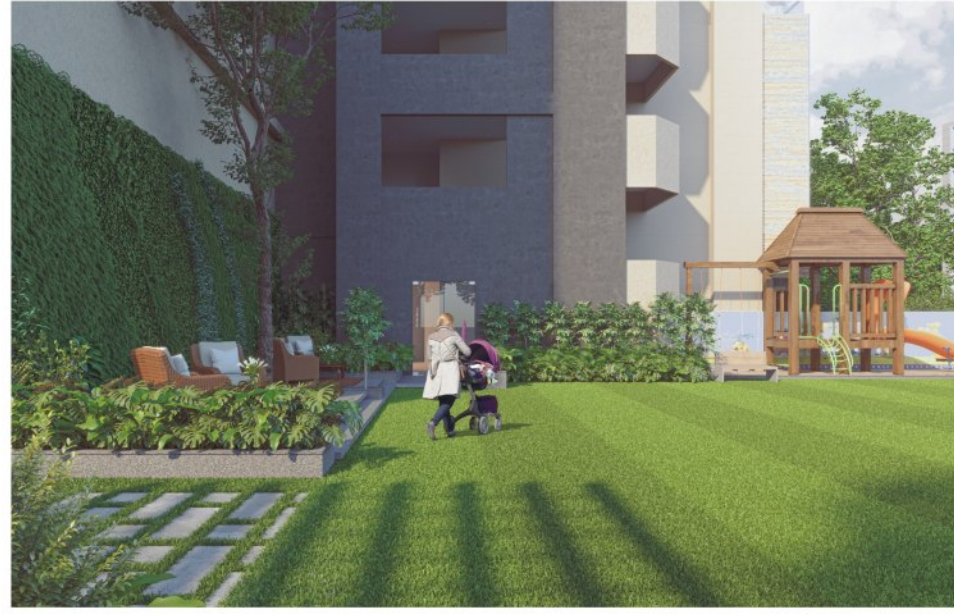
OPEN YOGA AREA