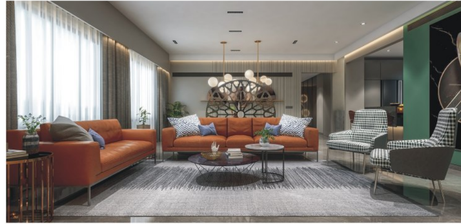
LIVING ROOM - VIEW 1

(1) 3782 SQ.FT. (2) 3820 SQ.FT. (3) 4347 SQ.FT. SKY DECK