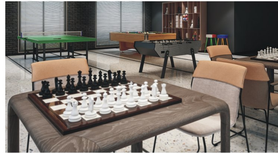
INDOOR GAME ZONE