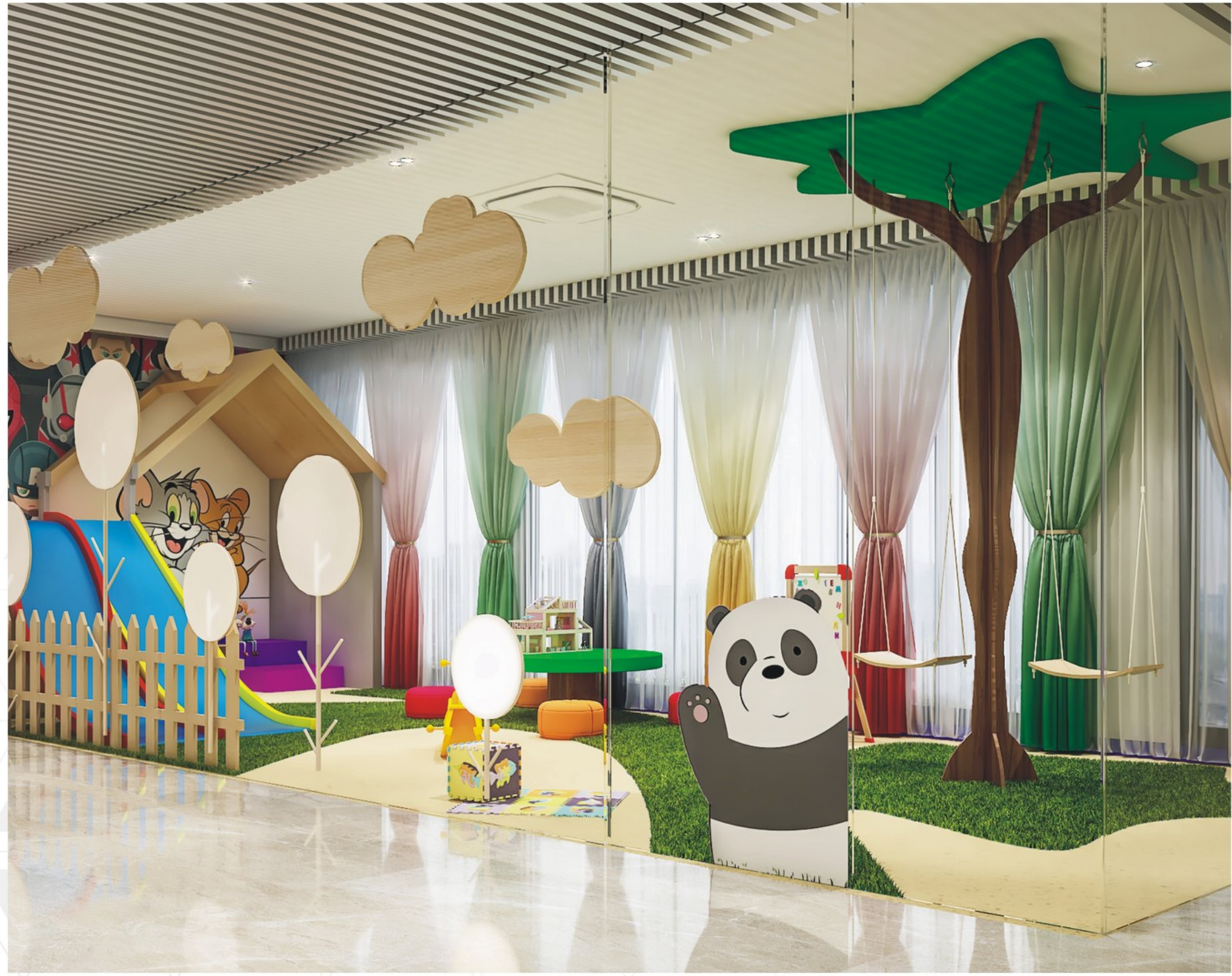
TODDLERS PLAY AREA