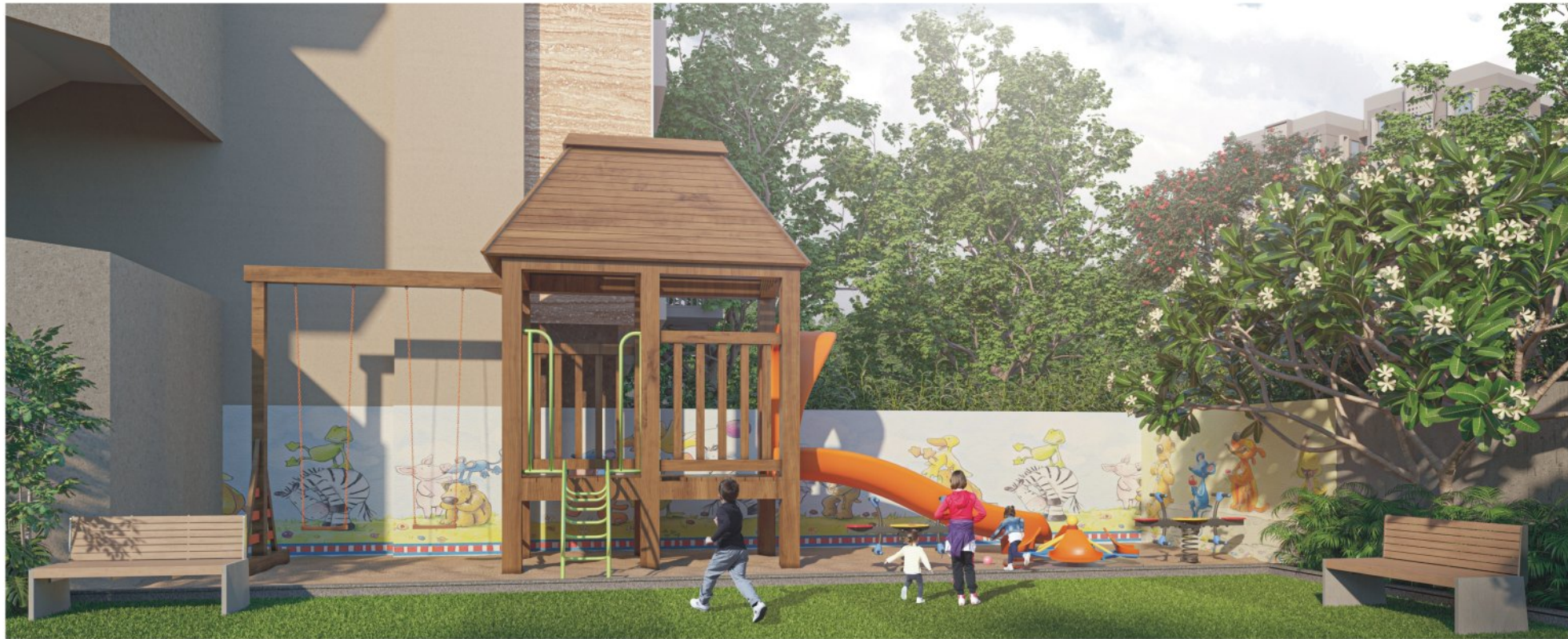
OUTDOOR CHILDREN PLAY AREA