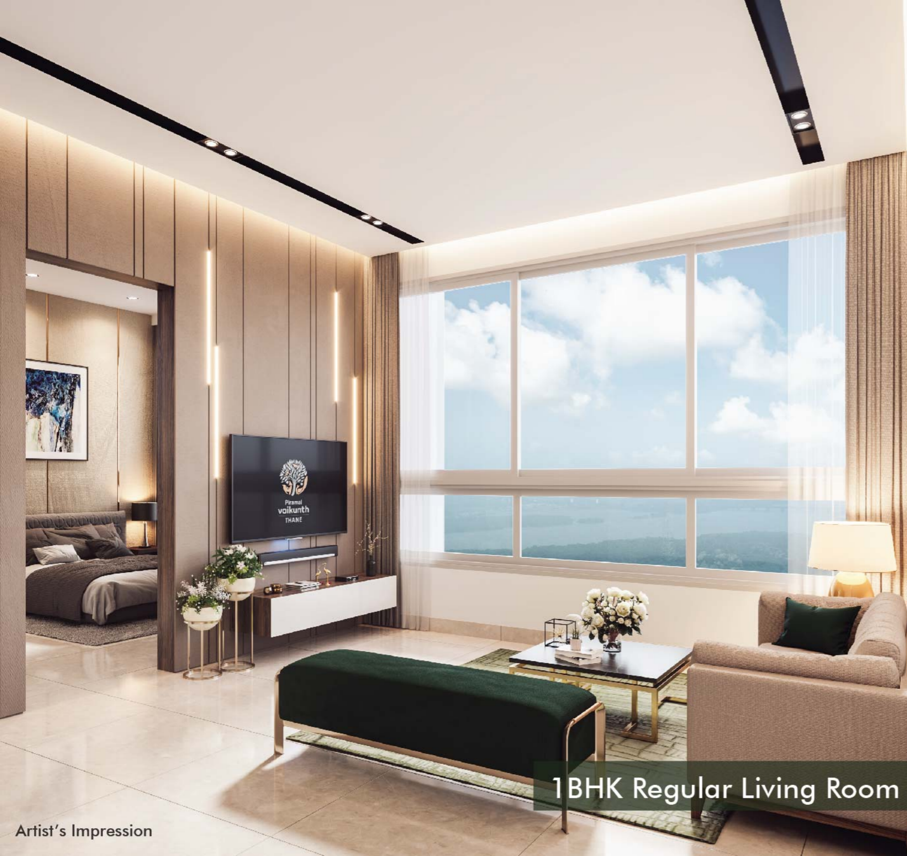
1 BHK Regular Living Room