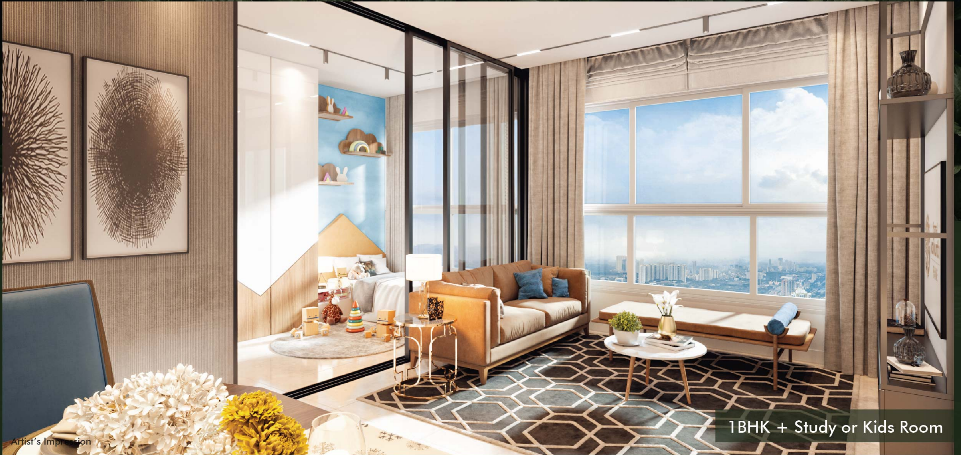
1BHK + Study or Kids Room