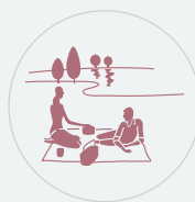
Beautiful lake within the estate