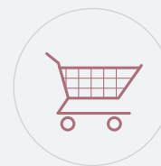
Walking distance from school, retail and medical facilities