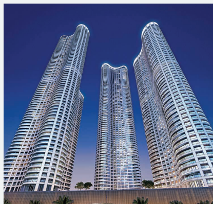
The World Towers

India's finest residences on Mumbai's Billionaires' Row