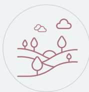
Large green spaces, manicured lawns, play areas