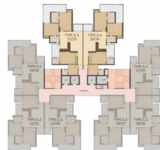
ORCHID TOWER / TULIP TOWER TYPE - S-3 UNIT- 25, 26, (TULIP TOWER) UNIT - 33, 34, (ORCHID TOWER)

TYPE -S-3 5 ROOM + DINING + KITCHEN + 4 TOILET+ 3 BALCONY CARPET AREA = 91.60 sq.m. BALCONY AREA = 23.87 sq.m. EXTERNAL WALL & COLUMN AREA = 7.29 sq.m. TOTAL COVERED AREA = 122.76 sq.m. COMMON AREA = 32.55 sq.m. TOTAL AREA = 155.31 sq.m. (1670 sq.ft.)