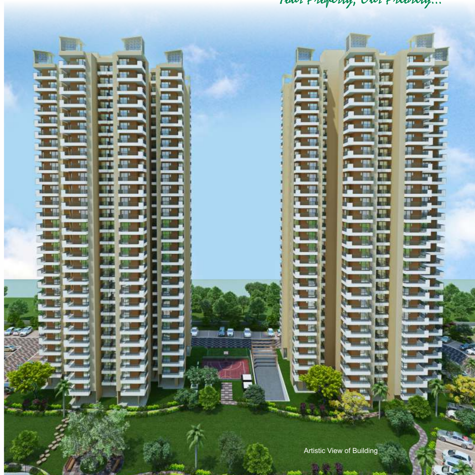
Artistic View of Building