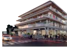
GNP GALLERIA, DOMBIVLI