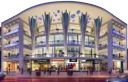
GNP ARCADIA, DOMBIVLI