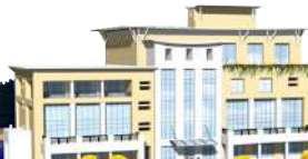
SPRINGTIME CLUB, KALYAN