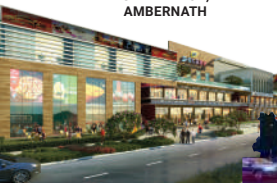
GALAXY HUB, AMBERNATH