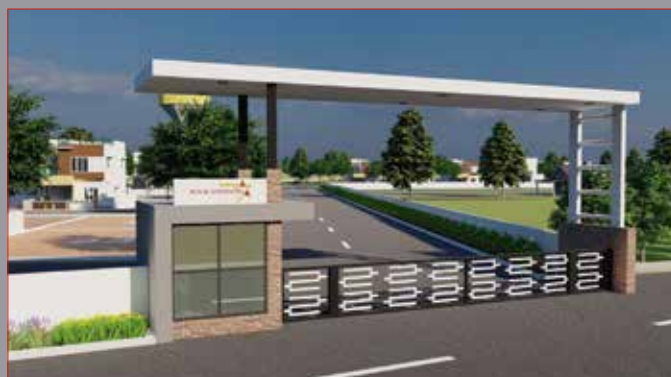
Annciya Royal Nakshatra, Chandapura - Anekal Road