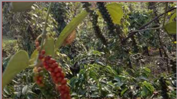
Annciya Plantations, Idukki Dist., Kerala

Annciya Estates grew with sheer dedication to quantity delivered. It prides itself on an organic growth plummeted by word of mouth credentials and unstinting support of its customers in the development of the organization.