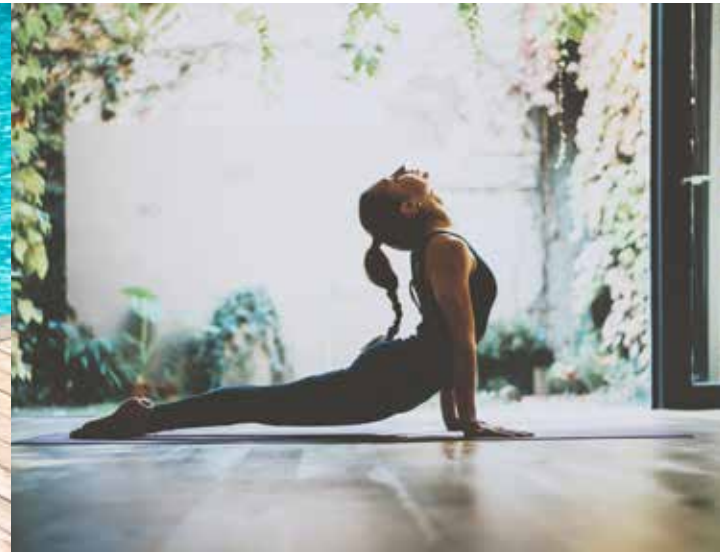
Table Tennis Yoga/ Meditation room Multipurpose Hall Terrace Party Area and Barbeque Fully-equipped Gym