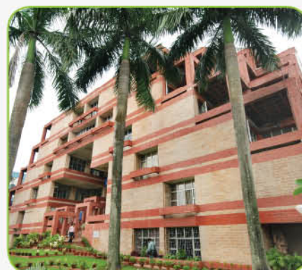
BDA Office Building