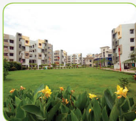
SBI Staff Association Co. Op. Ltd. Housing, Kesura, Bhubaneswar