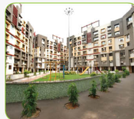
BMC Bhawani Saheed Nagar Enclave