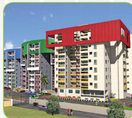
Gymkhana Palm Heights