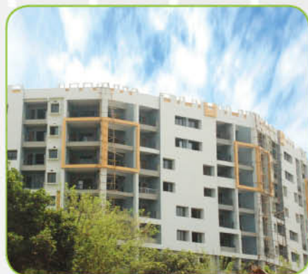
Arcon, Patia Square