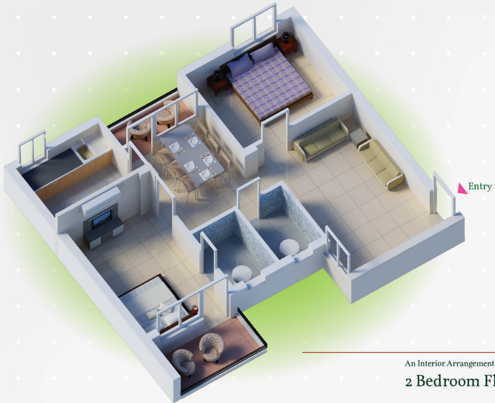
An Interior Arrangement for a 2 Bedroom Flat