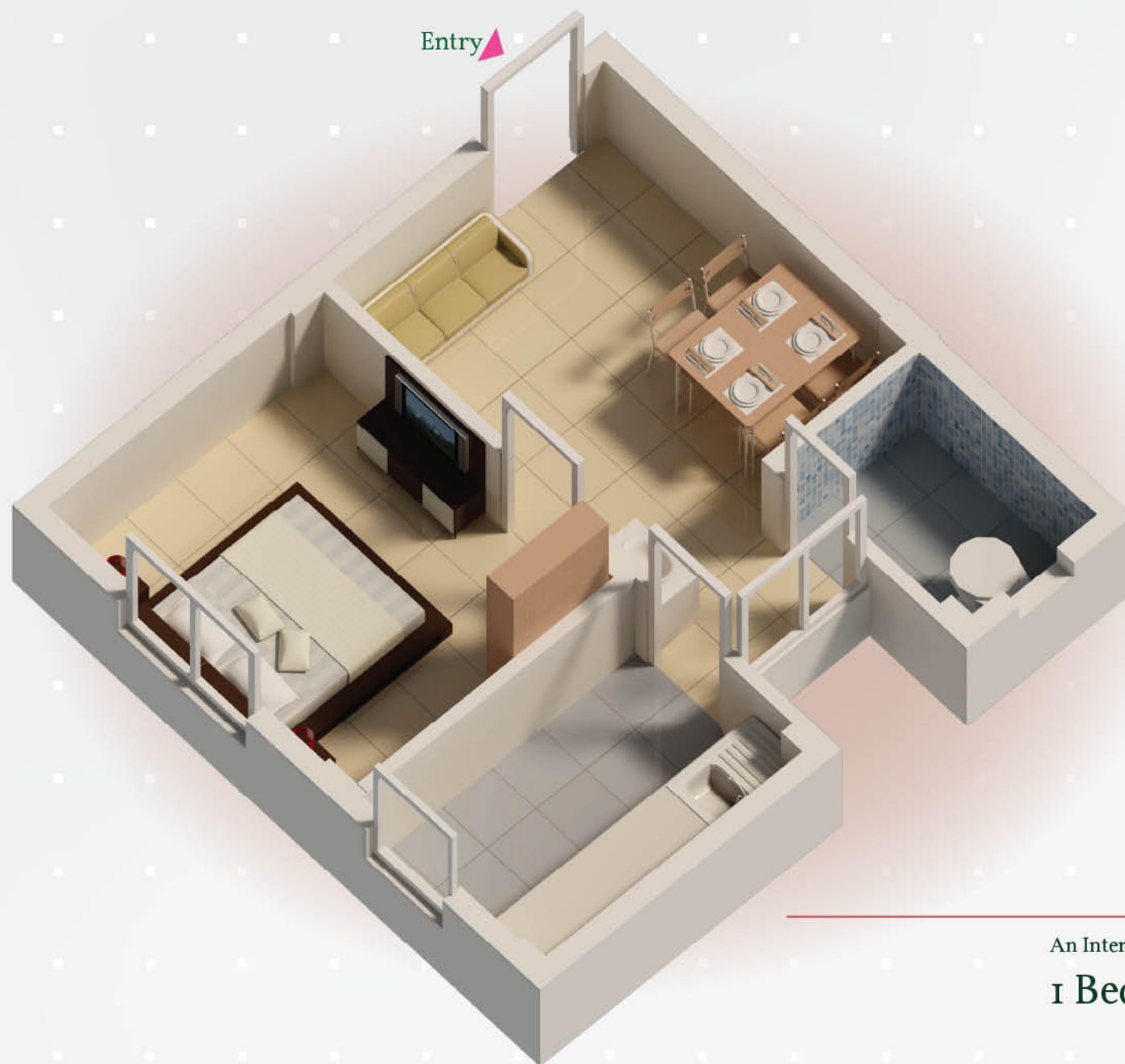
An Interior Arrangement for a 1 Bedroom Flat