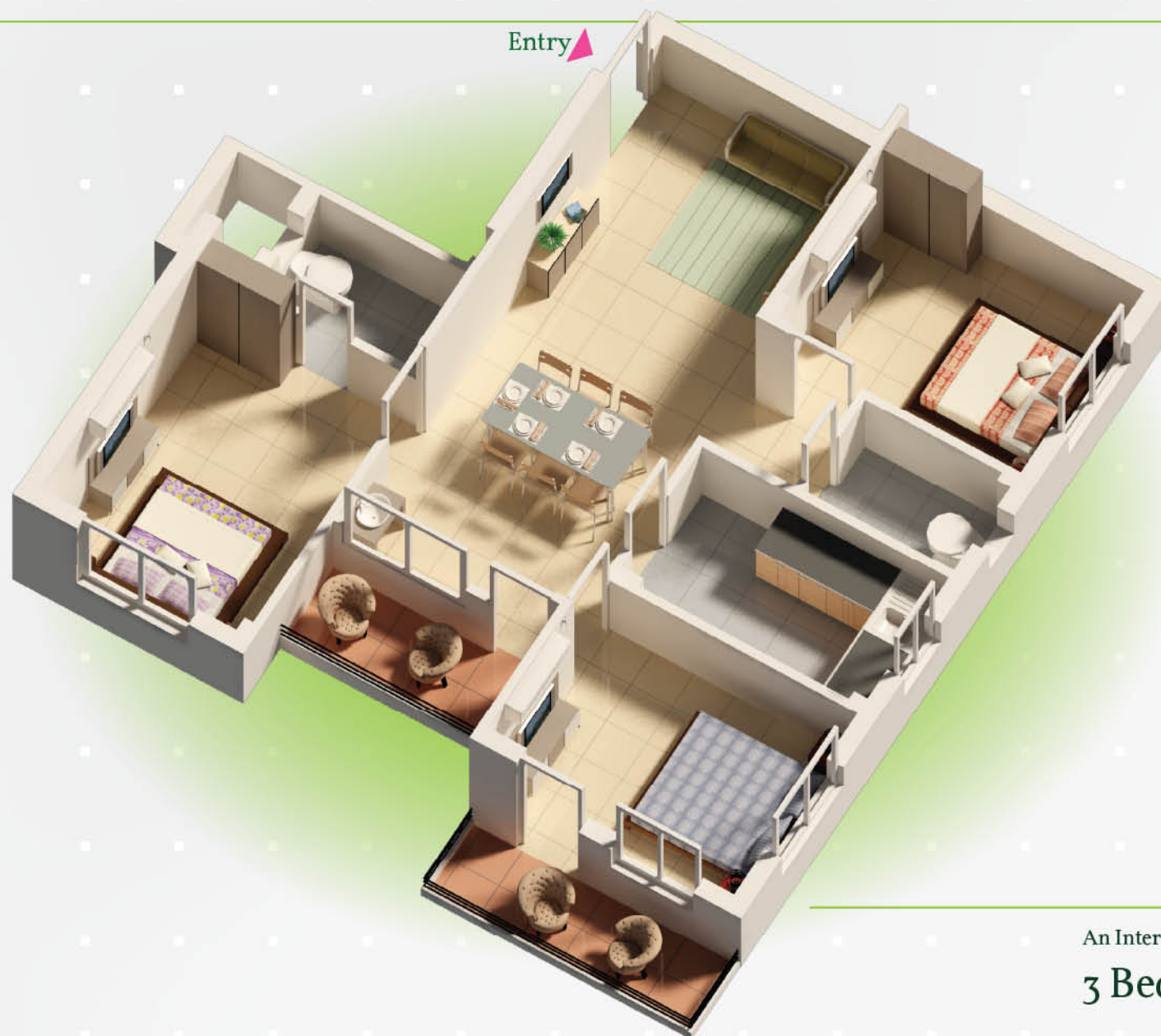
An Interior Arrangement for a 3 Bedroom Flat