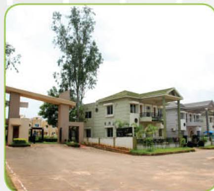
Gymkhana Palm Residency