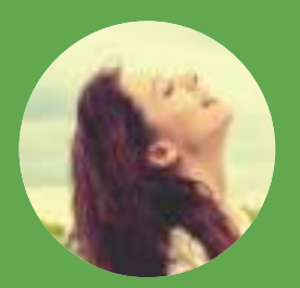
Pollution Free Location surrounded by 100 Acre+ Green Zone