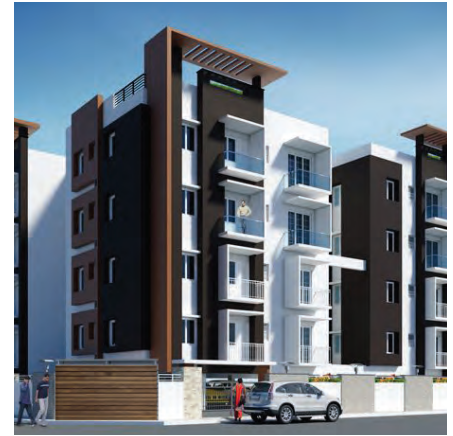
LAIBA RESIDENCY PHASE -I RANI BAGAN (BARIATU)