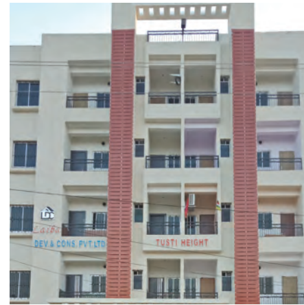
LAIBA RESIDENCY PHASE -II RANI BAGAN (BARIATU)