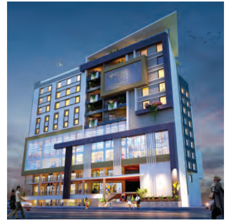
LAIBA TOWER (ON RUNNING PROJECT) KANTATOLI CHOWK, RANCHI