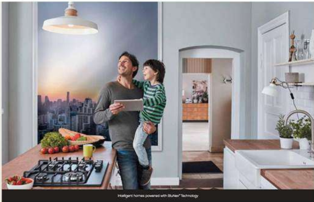
Intelligent homes powered with BluNex ® Technology

The User Interface on the BluNex app and home automation devices for the unit provided home may change with time. Requires Wi-Fi, a nearby electrical outlet and compatible devices. Images of the interiors furnished views and locations may have been slightly altered and do not represent actual views or surrounding views. No photos have been shot at site.