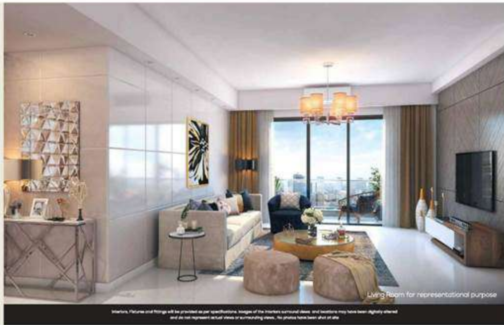
Living Room for representational purpose

Your new home at Purva Atmosphere comes with a space which engulfs you with happiness. Soaking everyone's body, mind and soul with bliss, your home lets you keep your worries at bay. Every residence has a fine blend of bold lines and minimalistic outlook. Thoughtfully planned to use natural light & ventilation, sustainable practices here have reached a new epitome of excellence.