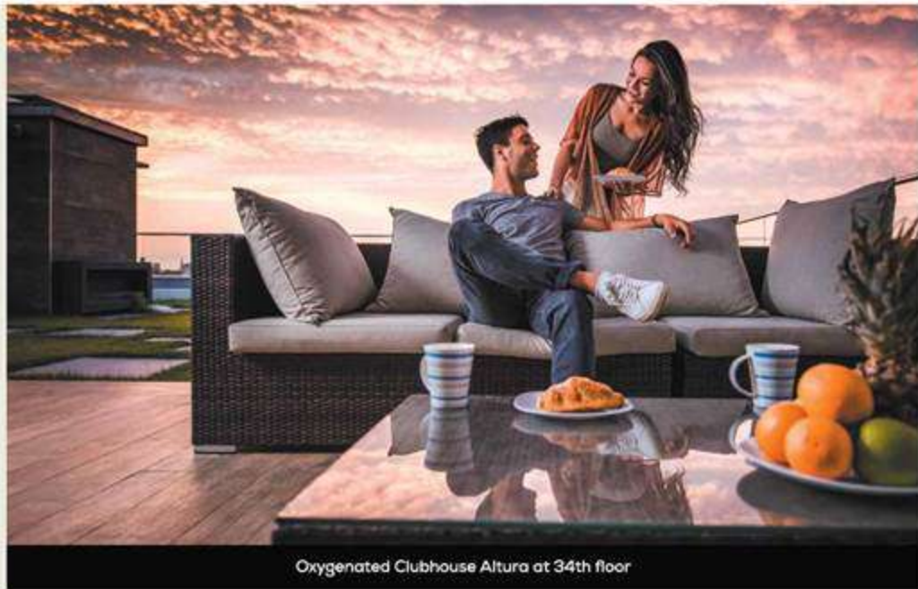
Oxygenated Clubhouse Altura at 34th floor

Photos of surroundings or location have been slightly virtualized unless otherwise mentioned. Images of facilities and amenities have not been shot on site and do not represent the actual facilities and amenities to be provided. The clubhouse is supplied with fresh air with optimized oxygen content.