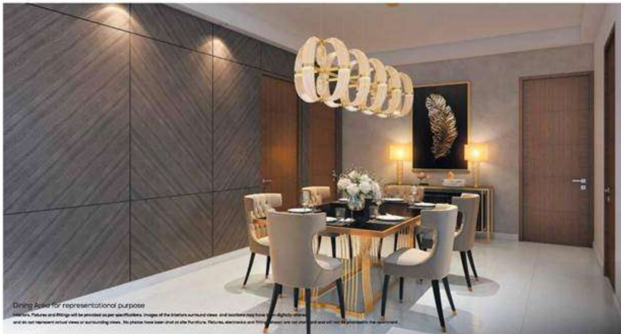
Dining Area for representational purpose

Materials, fixtures and fittings will be provided as per specifications. Images of the interiors are for illustrative purposes only and do not represent actual views or surrounding views. No photos have been shot at site. Furniture, fixtures, electronics and fittings shown are not provided and will not be provided in the apartment.