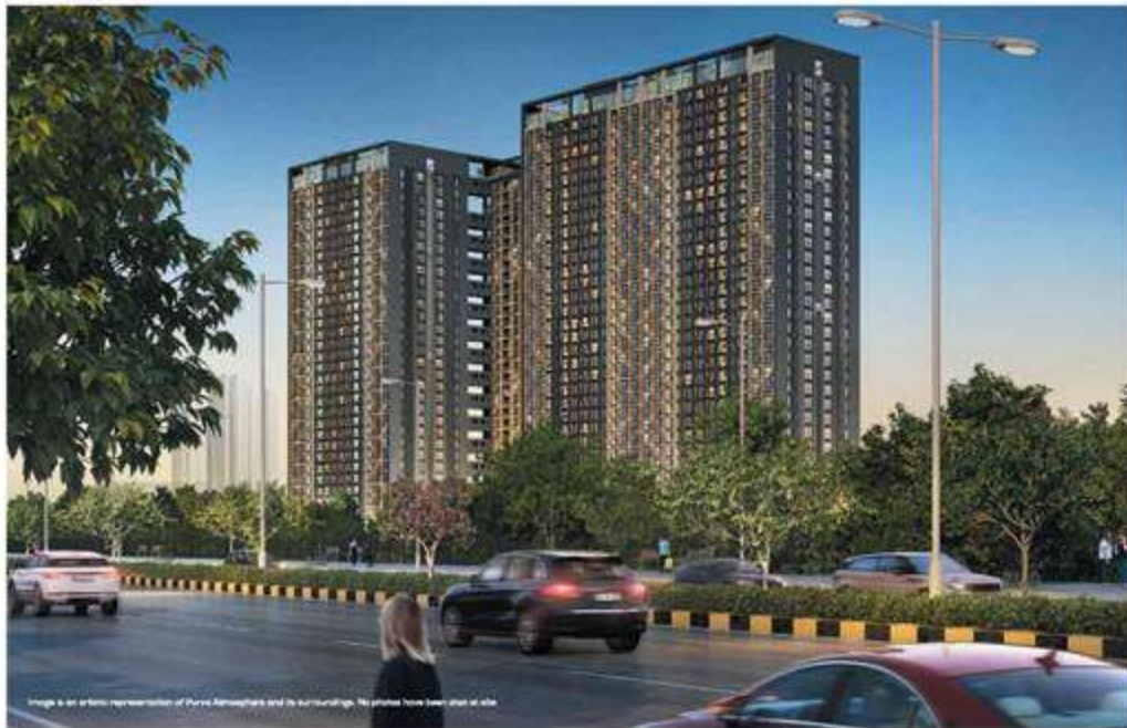
Image is an artistic representation of Purva Atmosphere and its surroundings. No photos have been shot at site.