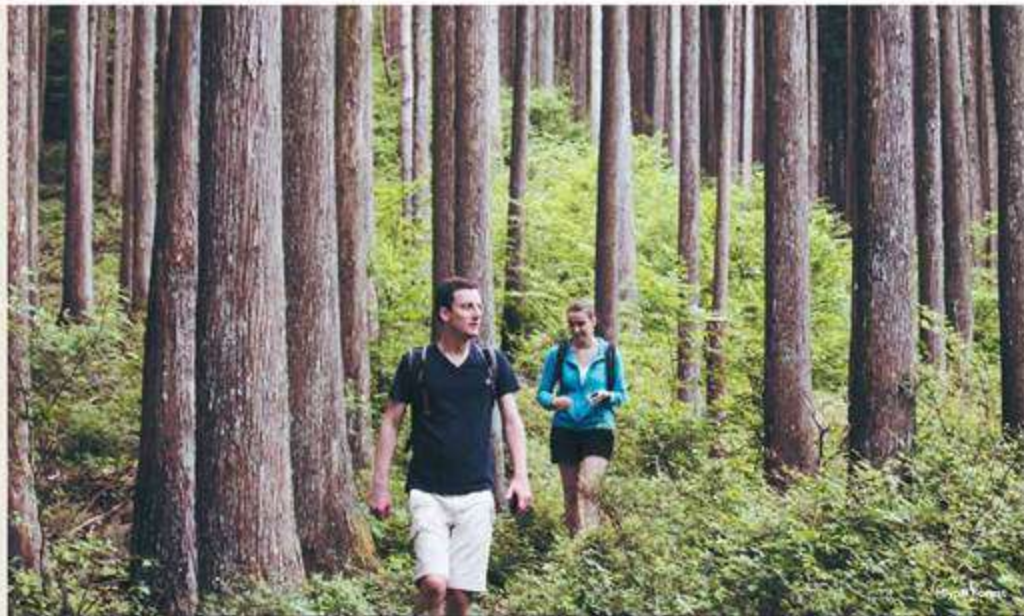
Japanese tree plantation method | 75 species of trees | Ample green cover | Soothing ambience

Photos of surroundings or location have been slightly enhanced unless otherwise mentioned. Images of facilities and amenities have not been shot on site and do not represent the actual facilities and amenities to be provided.