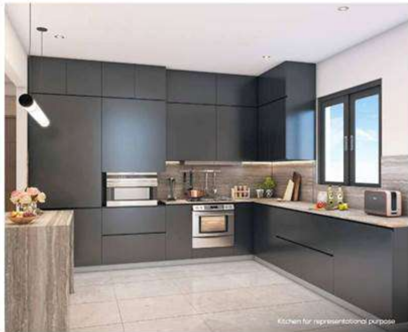
Kitchen for representational purpose

Materials, fixtures and fittings will be provided as per specifications. Images of the interiors are for illustrative purposes only and do not represent actual views or surrounding views. No photos have been shot at site. Furniture, fixtures, electronics and fittings shown are not provided and will not be provided in the apartment.