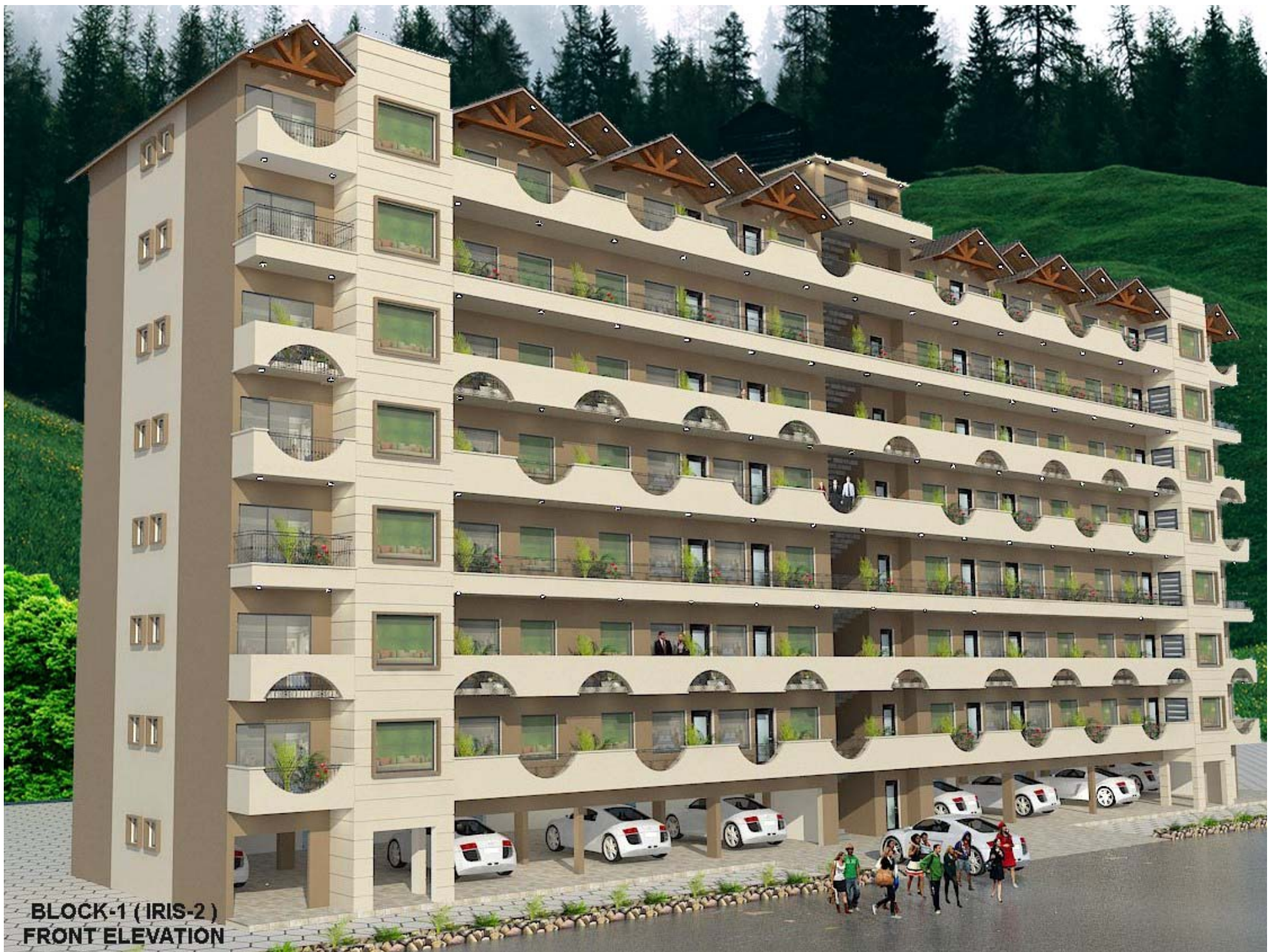
BLOCK-1 (IRIS-2) FRONT ELEVATION