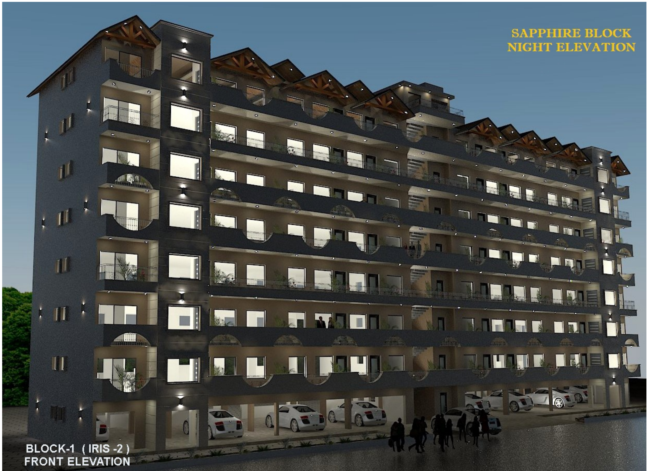
BLOCK-1 ( IRIS -2 ) FRONT ELEVATION