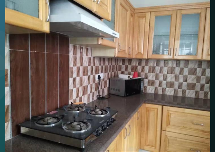
GAS STOVE WITH CHIMNEY