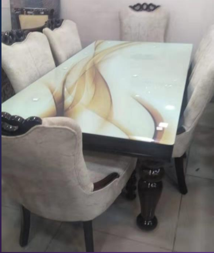
6 SEATER DINNING TABLE