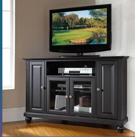
TV TROLLEY / PANEL