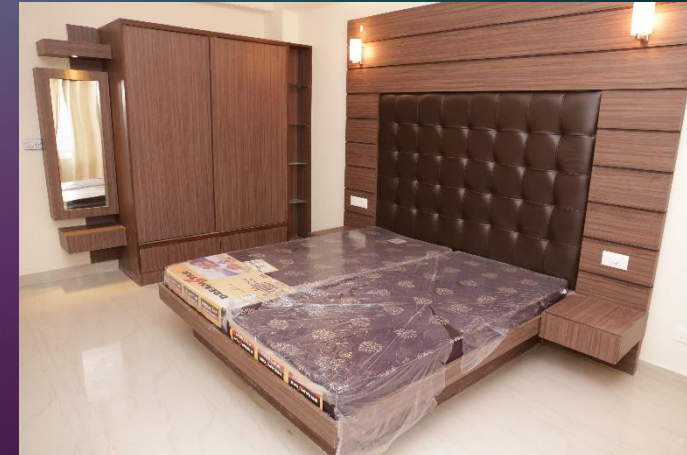
BED WITH MATTRESS