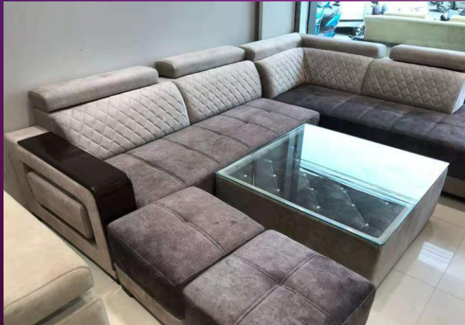
8 SEATER SOFA