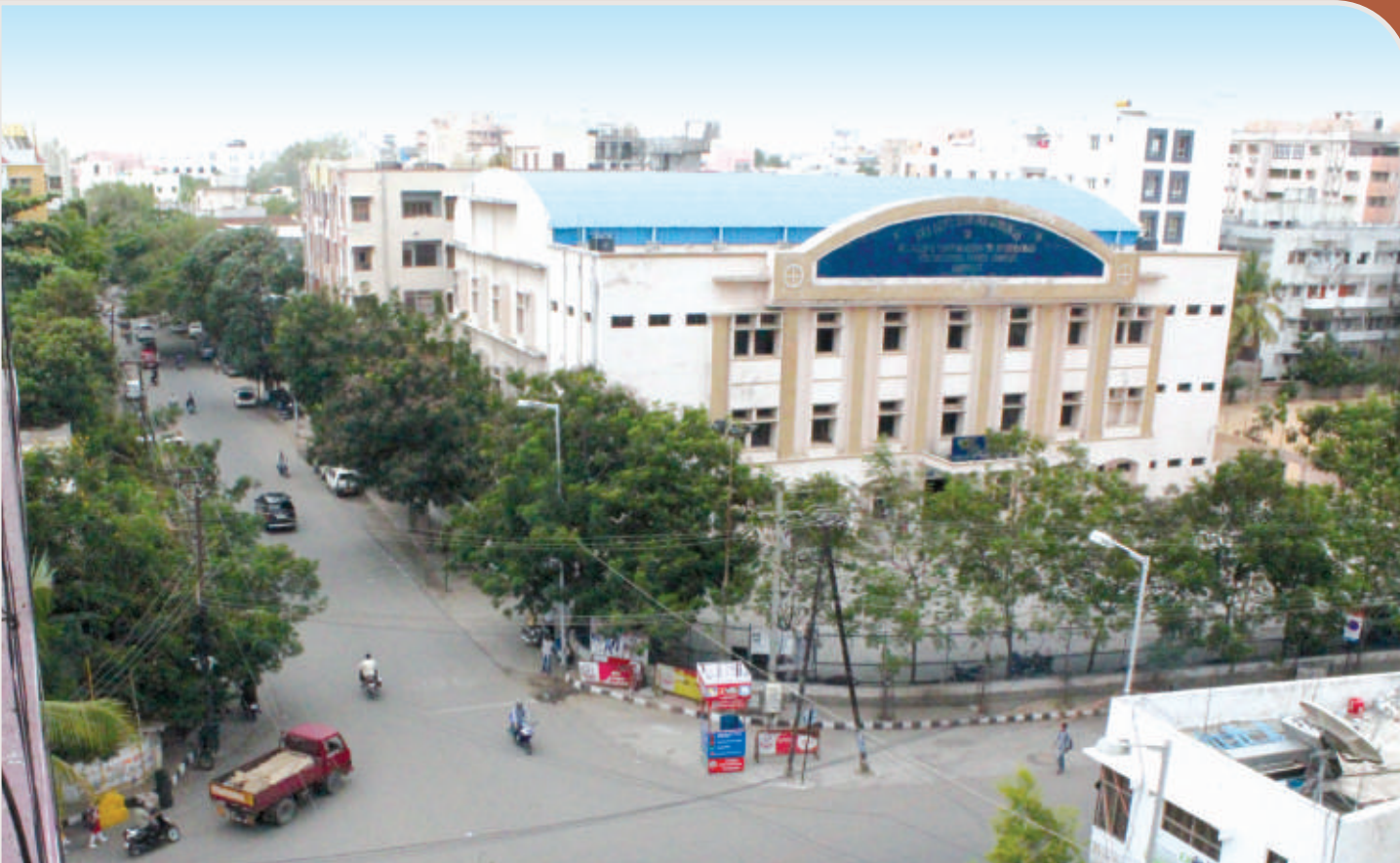
A view of Dharam Karam Road, Ameerpet

Stilt plus five levels of graceful grandeur embellished with a positive aura of well-planned spaces - for only thirty privileged families, five on each floor.