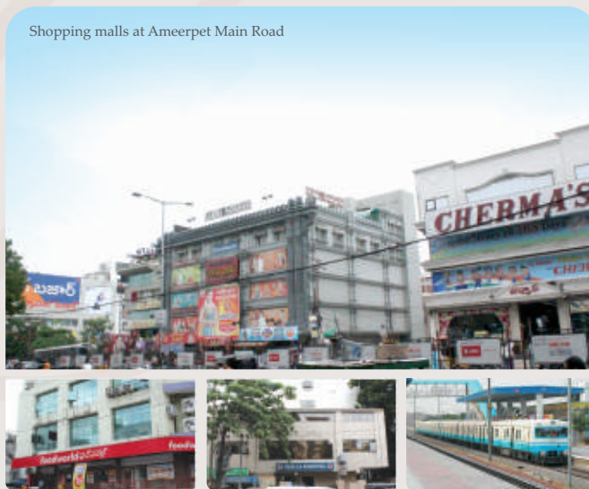
Shopping malls at Ameerpet Main Road

An integrated infrastructure such as flyovers and wide roads connect you to all parts of the city. The Begumpet Railway Station being just 5 minutes away from the site adds to the advantage of residing here. What's more, important destinations such as Banjara Hills and Jubilee Hills are just about 10-20 minutes drive away as well.