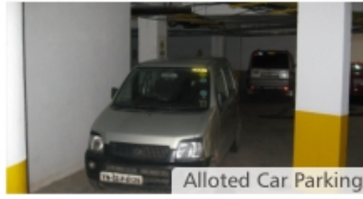
Alloted Car Parking