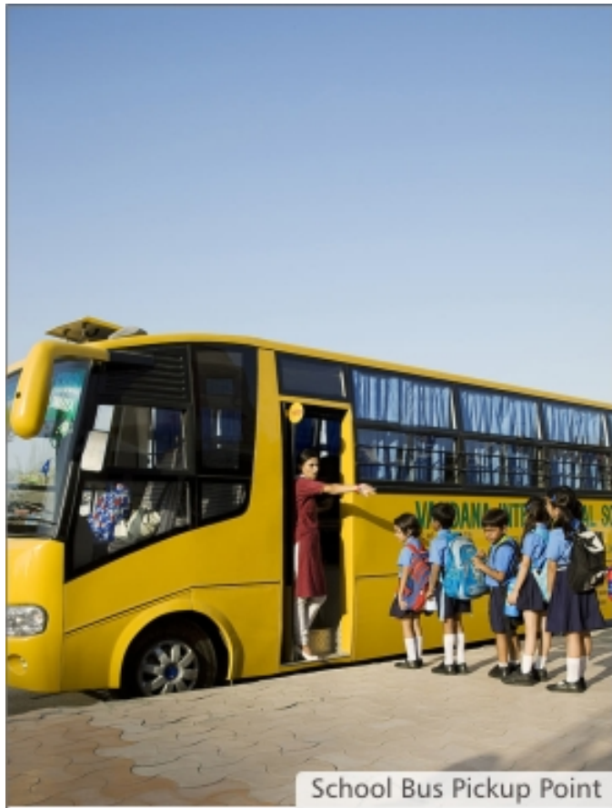
School Bus Pickup Point