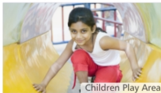
Children Play Area