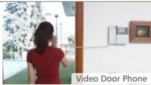
Video Door Phone