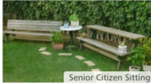
Senior Citizen Sitting