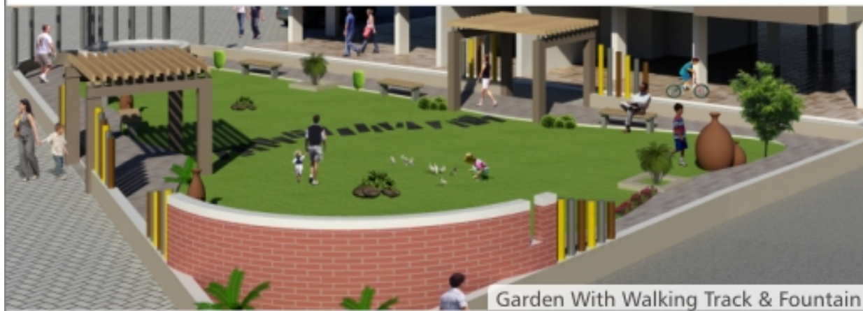
Garden With Walking Track & Fountain