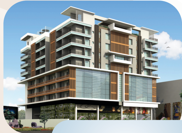
Legend Blue Hope TILAK ROAD * ABIDS

Legend Solaris is another legendary project envisioned by Legend Estates Pvt. Ltd. Legend is well-known for its excellence in design and superior project management. By creating properties of architectural eminence in the sought-after locales, it has carved a place of pride in the hearts and minds of its customers.