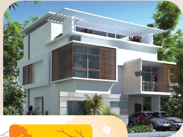
Legend CHIMES KOKAPET

CREATING PROPERTIES OF ARCHITECTURAL EMINENCE IN SOUGHT-AFTER LOCALES