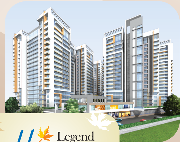
Legend Harmony GACHIBOWLI

CREATING PROPERTIES OF ARCHITECTURAL EMINENCE IN SOUGHT-AFTER LOCALES