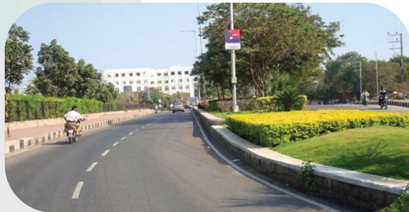
Road No. 2, Banjara Hills