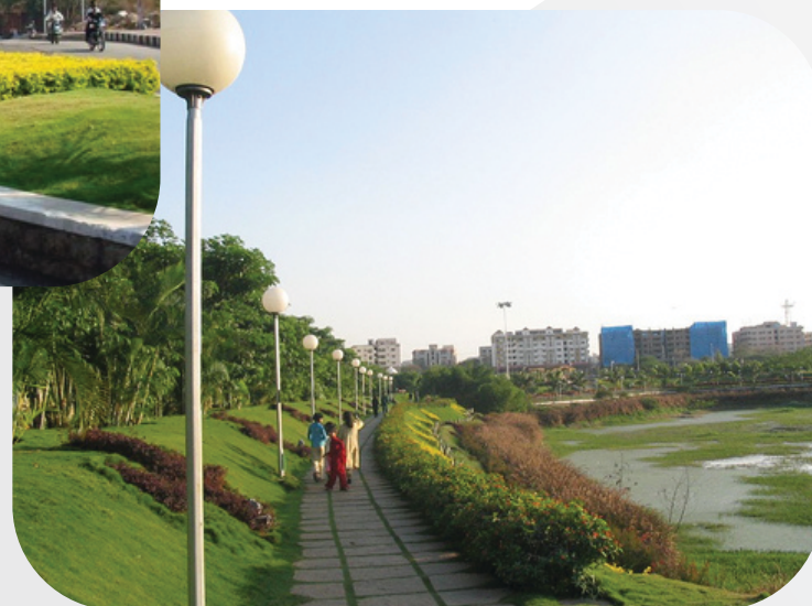
KBR Park Jogging Track