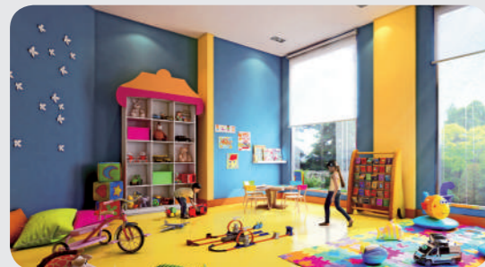
Kids' play room