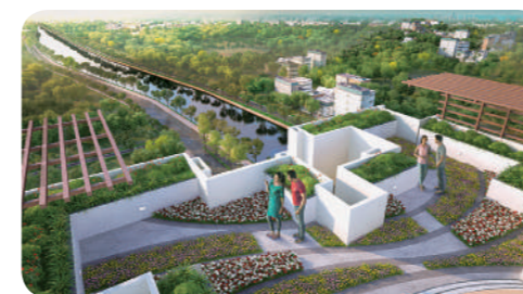
Rainbow garden on Rooftop Skywalk