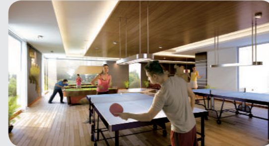
Indoor games room