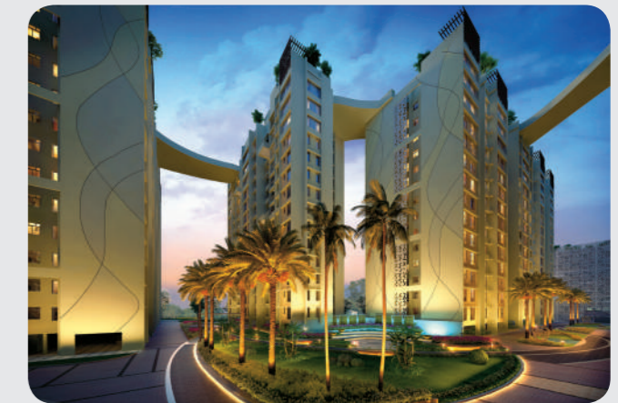
Landscape view with Rooftop Skywalk