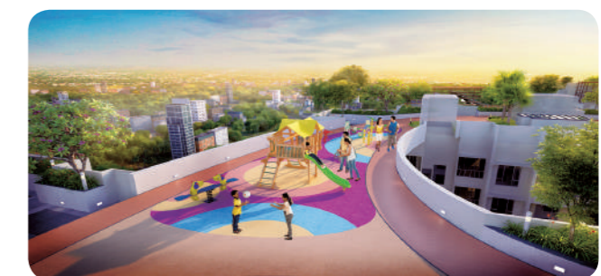
Kids' play area on Rooftop Skywalk

They offer spaces with spaciousness. Siddha Suburbia provides a combination of space, scale, foliage and altitude.