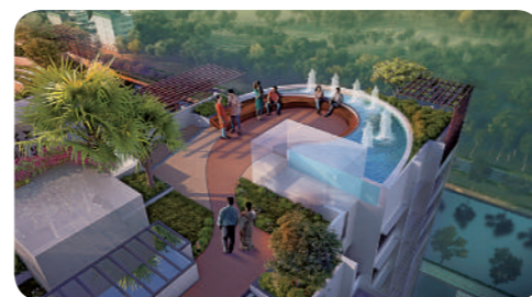
Waterbody with fountains on Rooftop Skywalk

Jogging track • Open fitness zone • Yoga and meditation area Skating rink • Rock climbing zone • Ludo court • Adda zone • Sitout spaces • Senior citizen area • Pantry with service room • Party deck Amphitheatre & Skyplex • Children's play area • Waterbody with fountains • Rainbow garden • Exhibition area • Observatory deck Landscaped green area • Party lawn