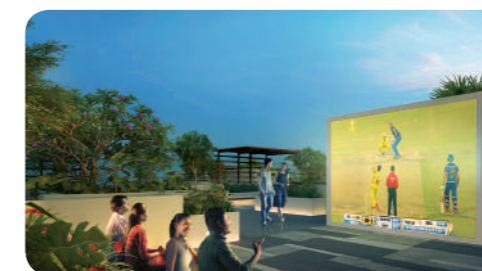
Amphitheatre & Skyplex on Rooftop Skywalk