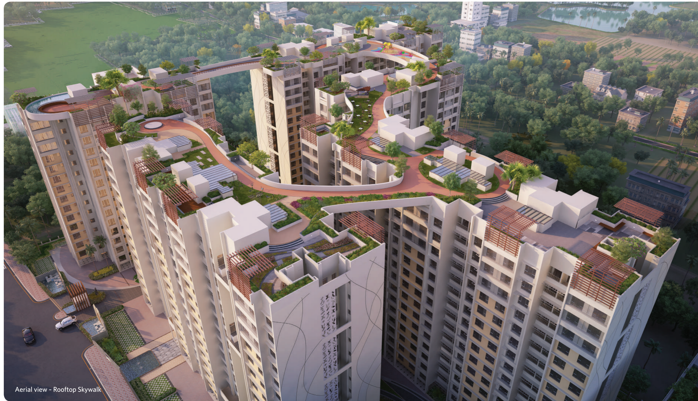
Aerial view - Rooftop Skywalk