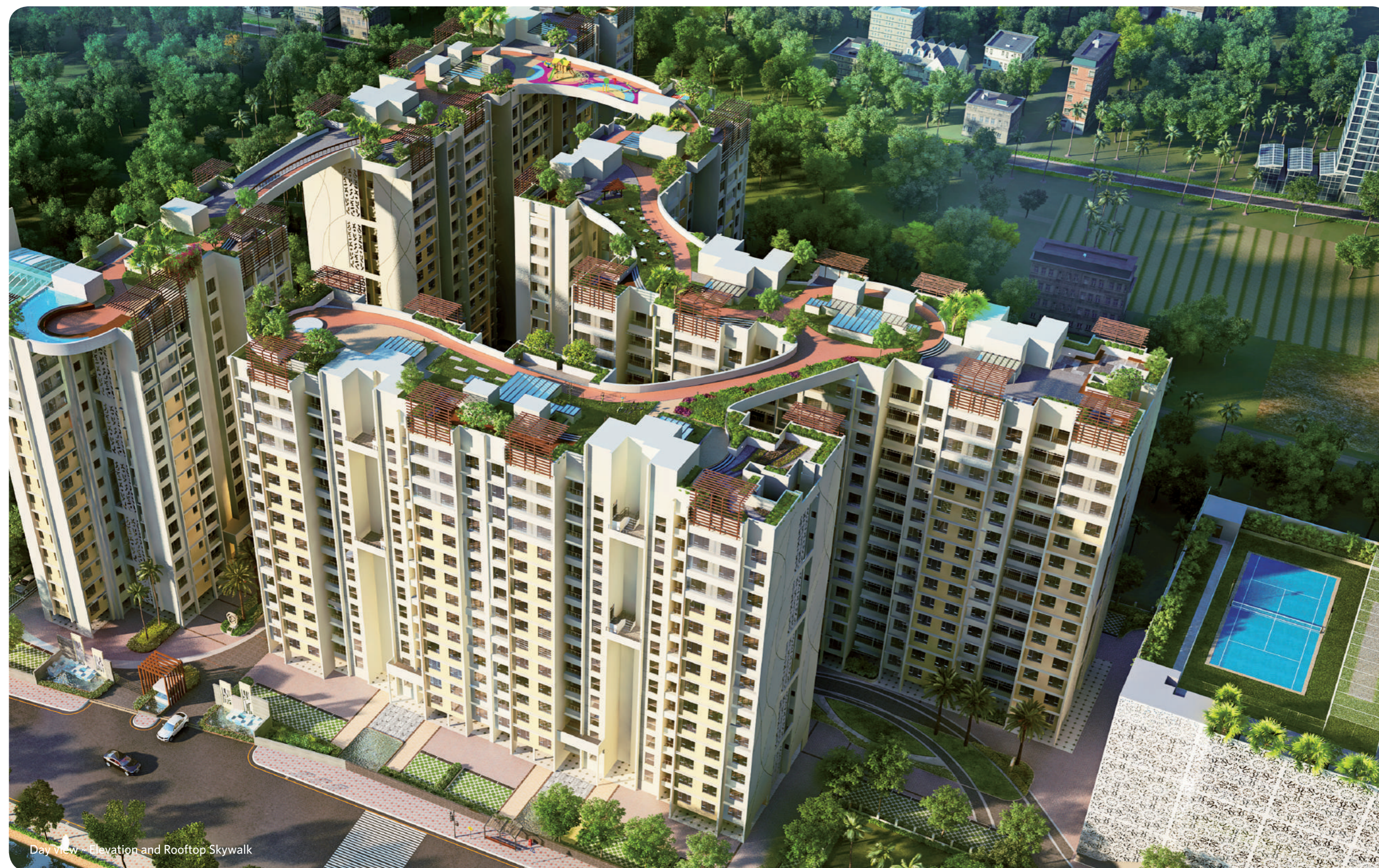
Day view - Elevation and Rooftop Skywalk

To us at Siddha, usual is boring. Which is why, we don't just construct homes, but build landmarks instead. Ones that enhance owner pride and neighbourhood respect.