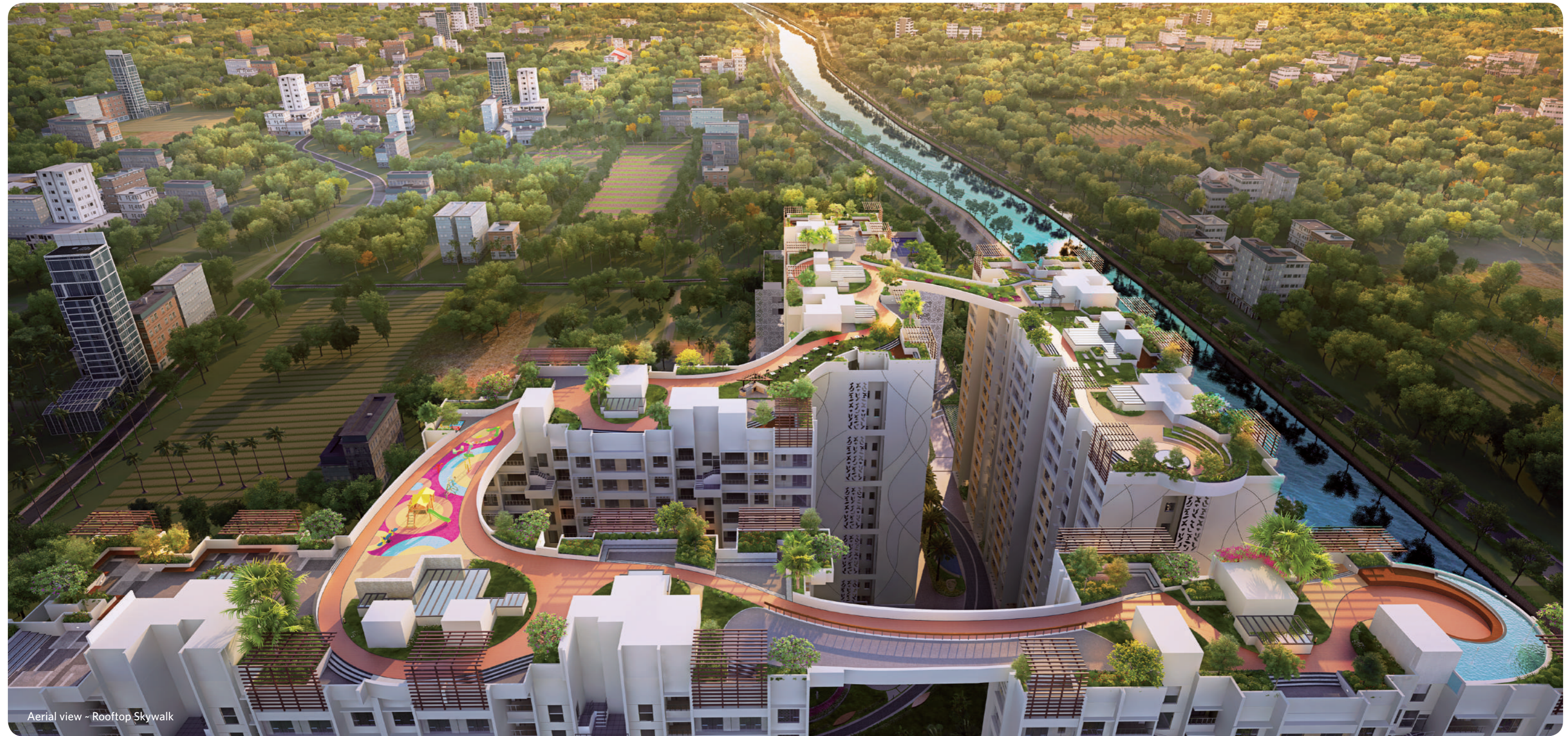
Aerial view - Rooftop Skywalk