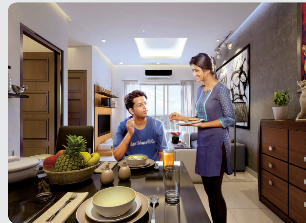
Living and Dining Room