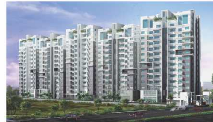
WOOD WINDS, SARJAPUR ROAD, BENGALURU