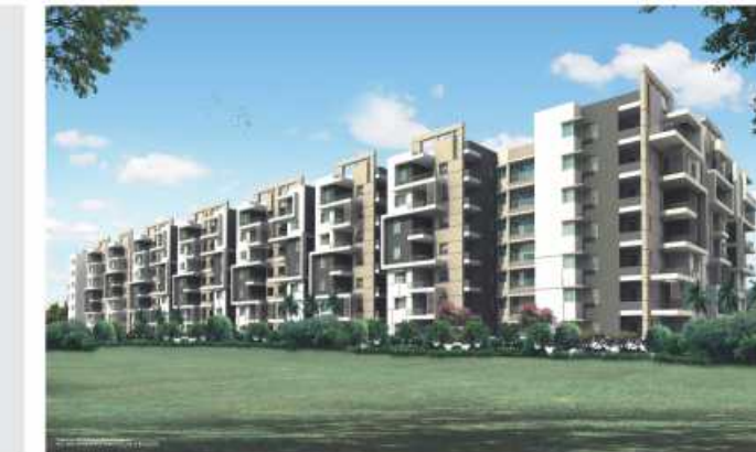
ULTIMA, OFF. SARJAPUR ROAD, BENGALURU

Do you want to leave behind the humdrum of city living? Do you want distinctive style with down-to-earth simplicity? Do you want to live the resort-like life at home?