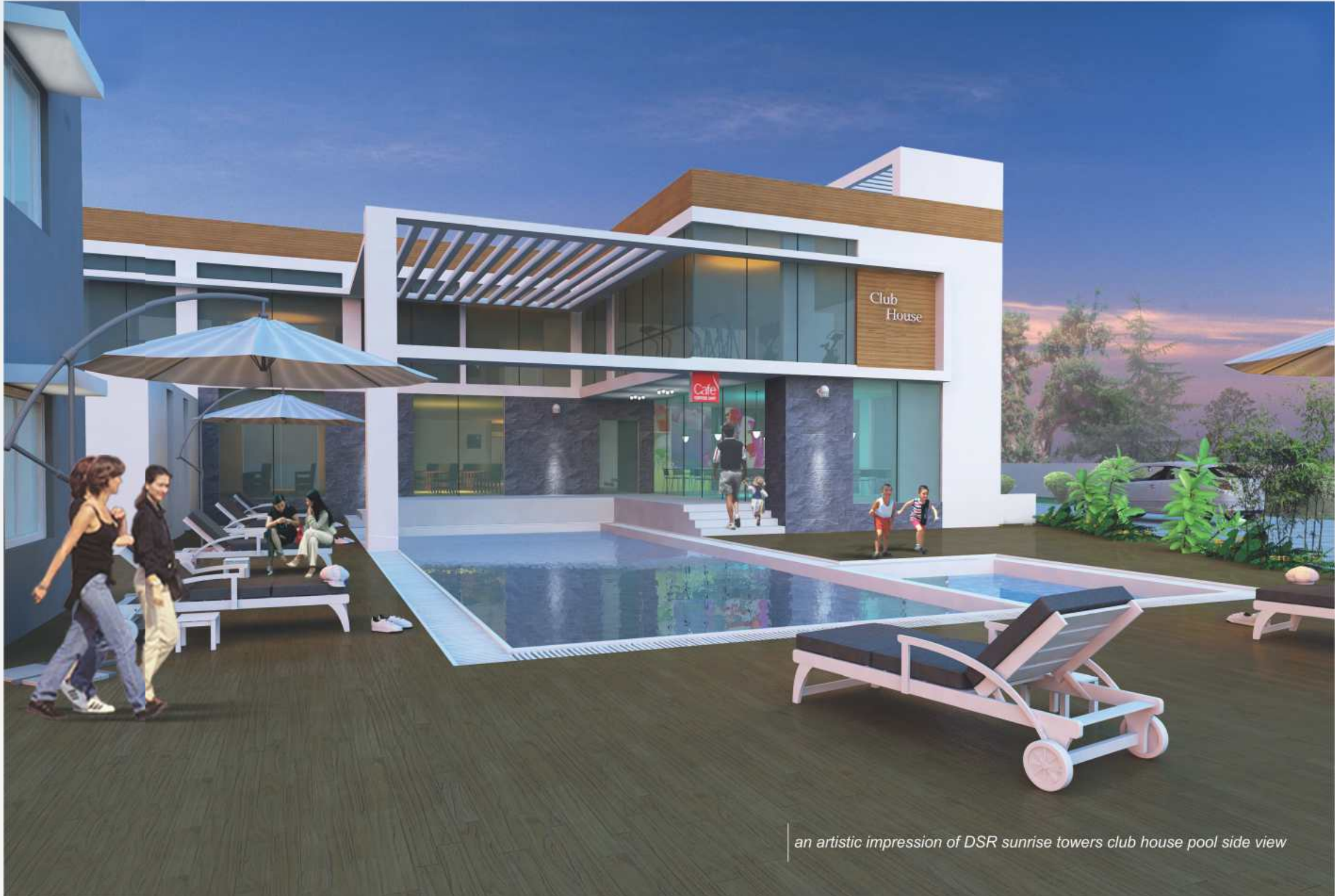
an artistic impression of DSR sunrise towers club house pool side view