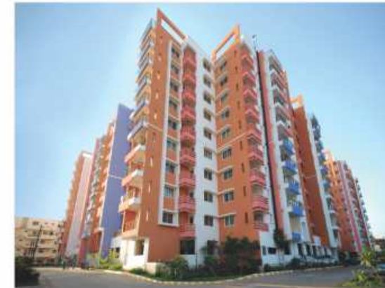
SPRING BEAUTY, BROOKEFIELDS, BENGALURU

DSR Group Since 1988, has been crafting properties of architectural distinction in the sought-after locations, across South India. Owing to its initiatives, it has established a reputation for excellence and an inspiring portfolio of prestigious projects that are distinctly designed and ceremoniously crafted. DSR Group demonstrates the ability to craft homes that are in sync with the environment and perfectly meet the aspirations of the discerning clientele.