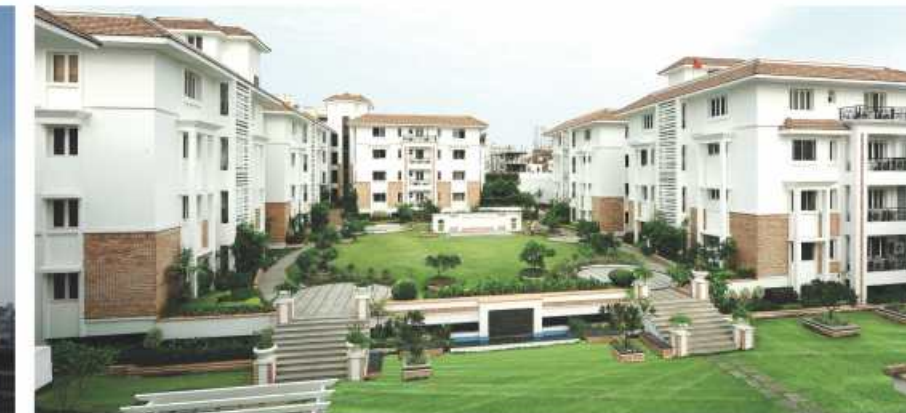
FORTUNE ENCLAVE, BANJARA HILLS, HYDERABAD