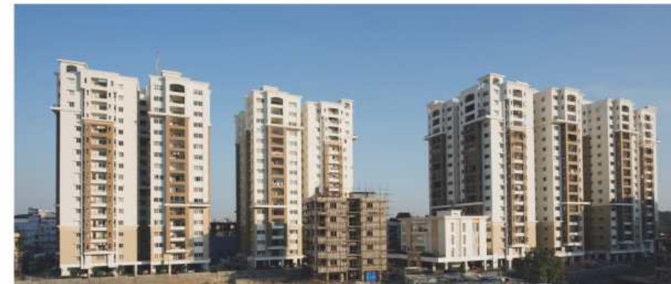
FORTUNE TOWERS, MADHAPUR, HYDERABAD