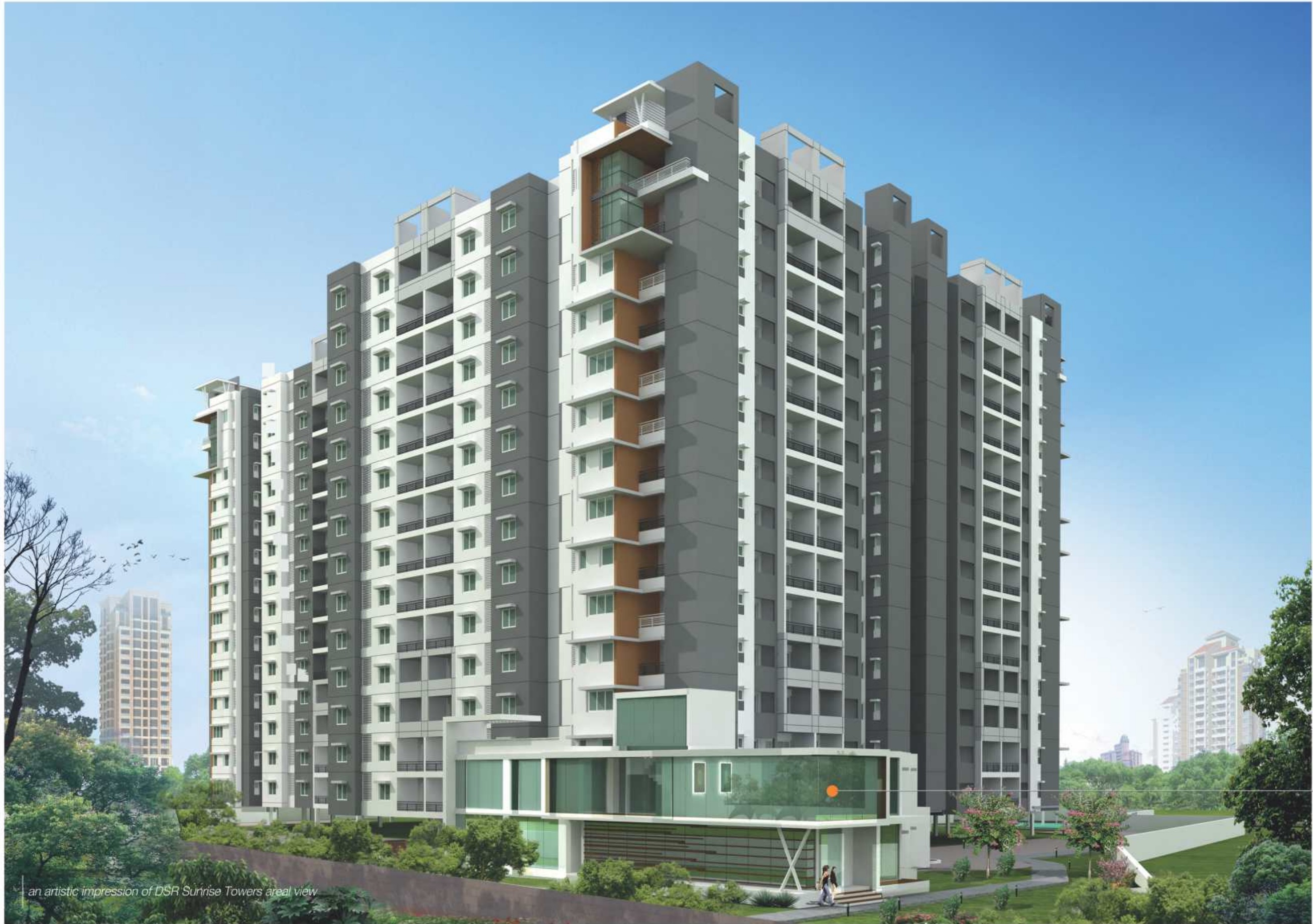
an artistic impression of DSR Sunrise Towers areal view