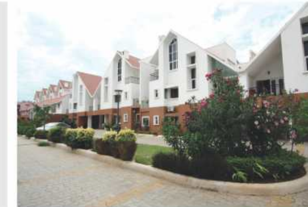
ELITE, OFF. OUTER RING ROAD, BENGALURU