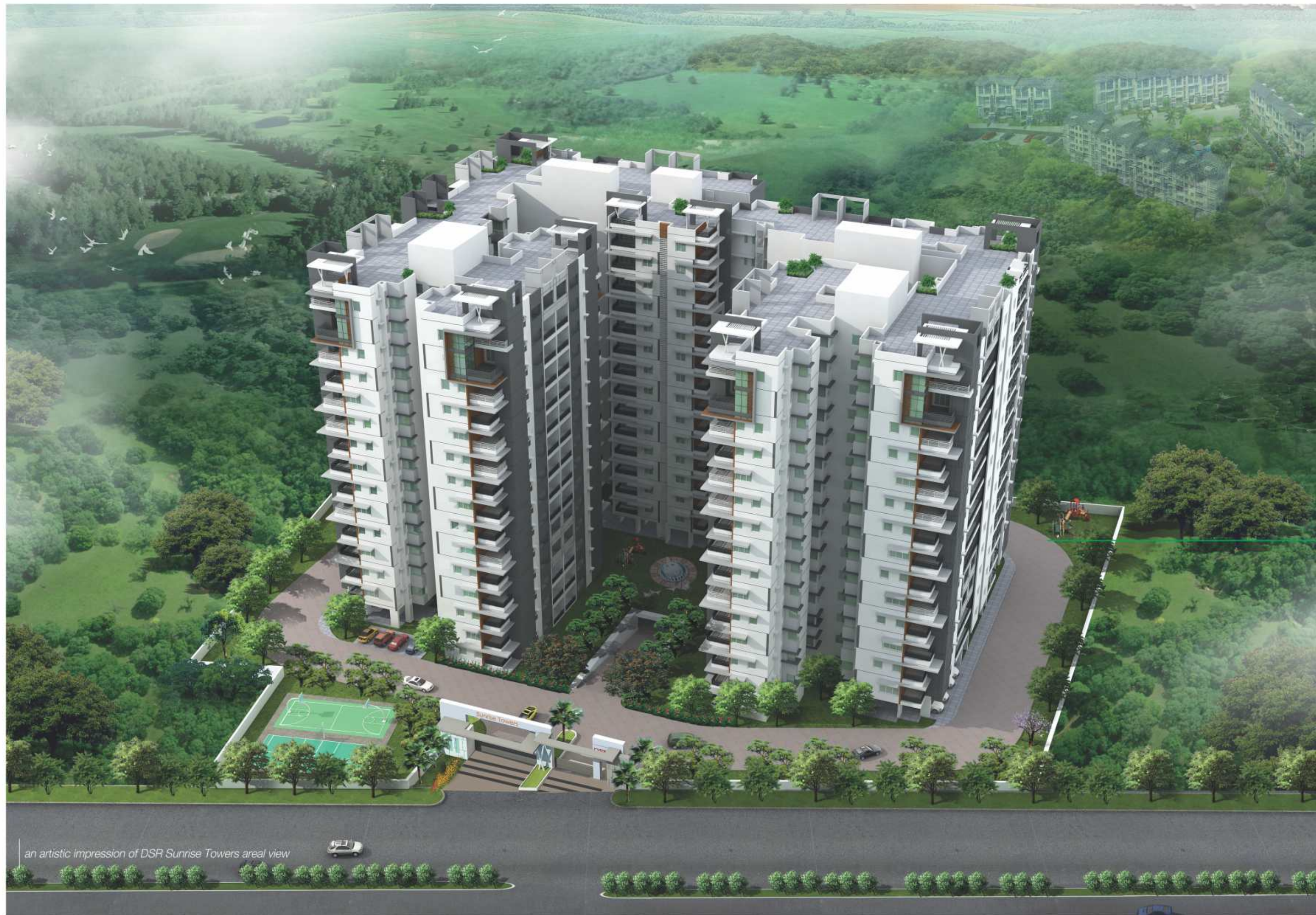
an artistic impression of DSR Sunrise Towers areal view