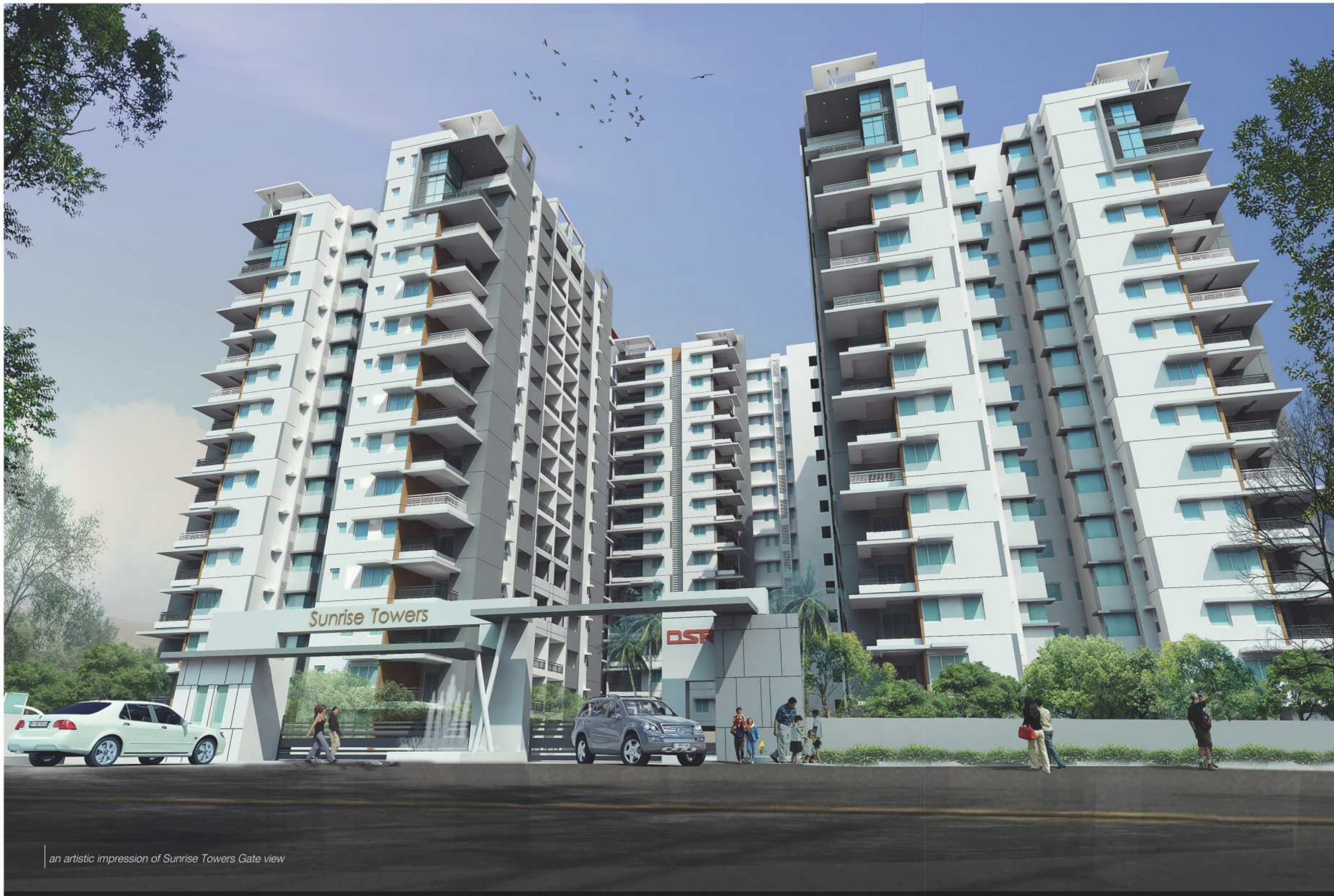
an artistic impression of Sunrise Towers Gate view