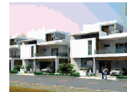
Cyprus Palms, Hyderabad