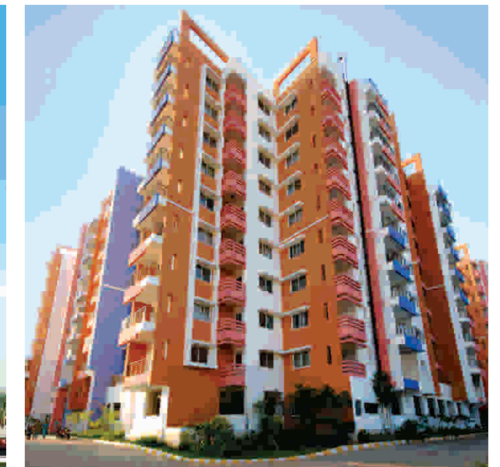
Spring Beauty, Bengaluru

What differentiates DSR are its distinct lifestyle environments, modern designs, architecture and choice of international range amenities. Every project from DSR is a standing testimony to its excellent standards and the intelligence to follow it through.