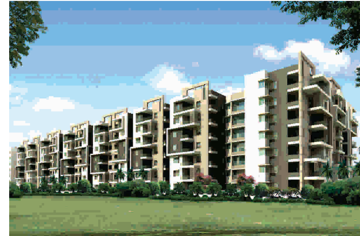
DSR Ultima, Bengaluru

It's amazing how when you're not looking for it, inspiration comes looking for you.