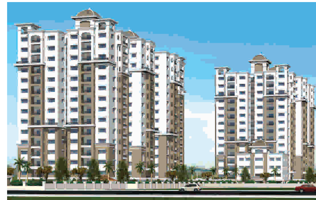
Fortune Towers, Hyderabad