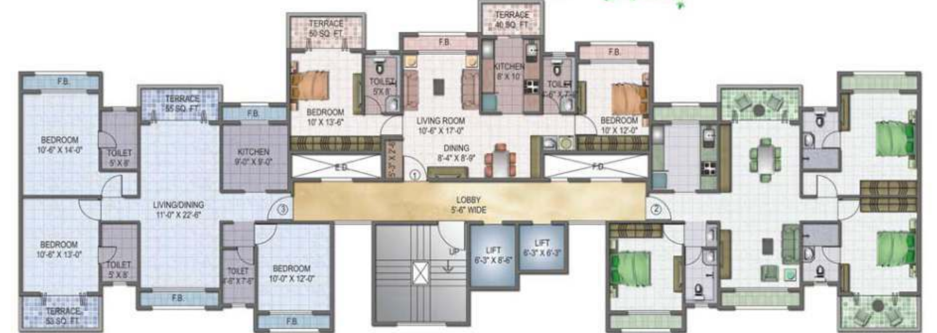
TYPICAL ODD FLOOR PLAN - WING C (3 rd , 5 th , 7 th , 9 th , 11 th & 13 th )

* No 3BHK flats on 8 th , 9 th , & 10 th floors