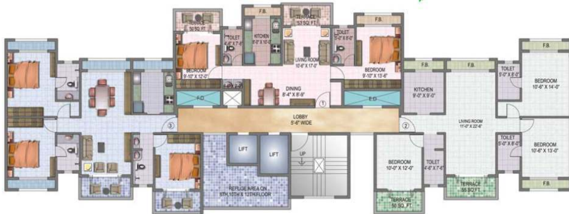
TYPICAL EVEN FLOOR PLAN - WING A (2 nd , 4 th , 6 th , 8 th , 10 th & 12 th )

Plot No. 24, Sector 15, Kharghar, Navi Mumbai