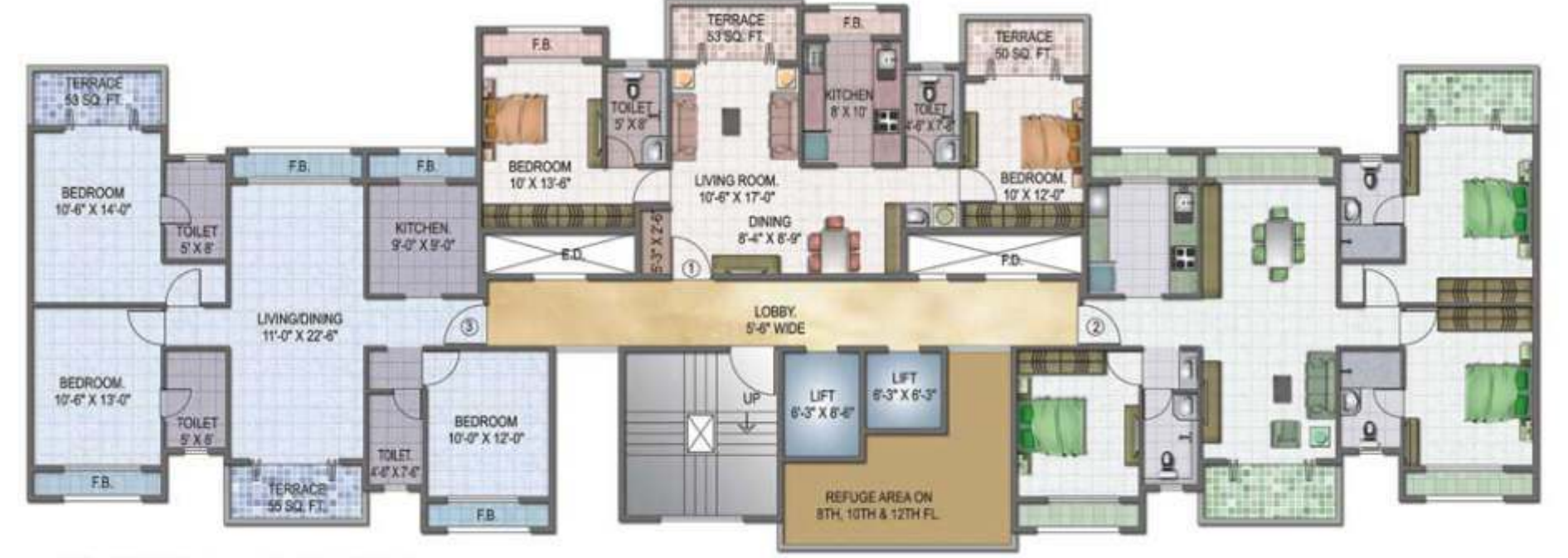
TYPICAL EVEN FLOOR PLAN - WING C (2 nd , 4 th , 6 th , 8 th , 10 th & 12 th )

* No 3BHK flats on 8 th , 9 th , & 10 th floors