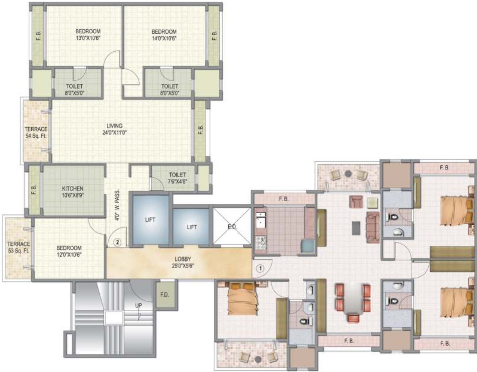
TYPICAL EVEN FLOOR PLAN - WING G (2 nd , 4 th , 6 th , 8 th , 10 th & 12 th )