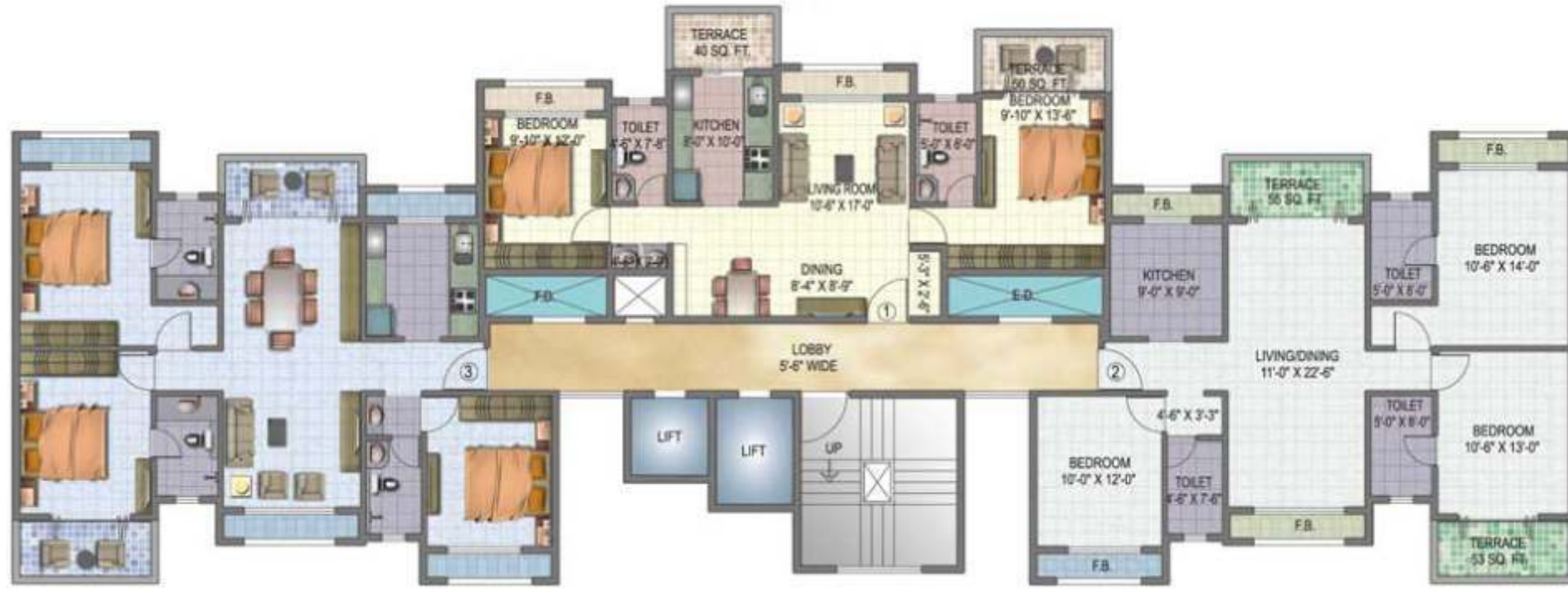
TYPICAL ODD FLOOR PLAN - WING A (3 rd , 5 th , 7 th , 9 th , 11 th & 13 th )

Plot No. 24, Sector 15, Kharghar, Navi Mumbai