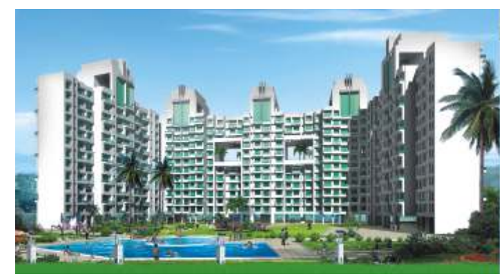
Goodwill Paradise Plot No. 24, Sector-15, Kharghar, Navi Mumbai.