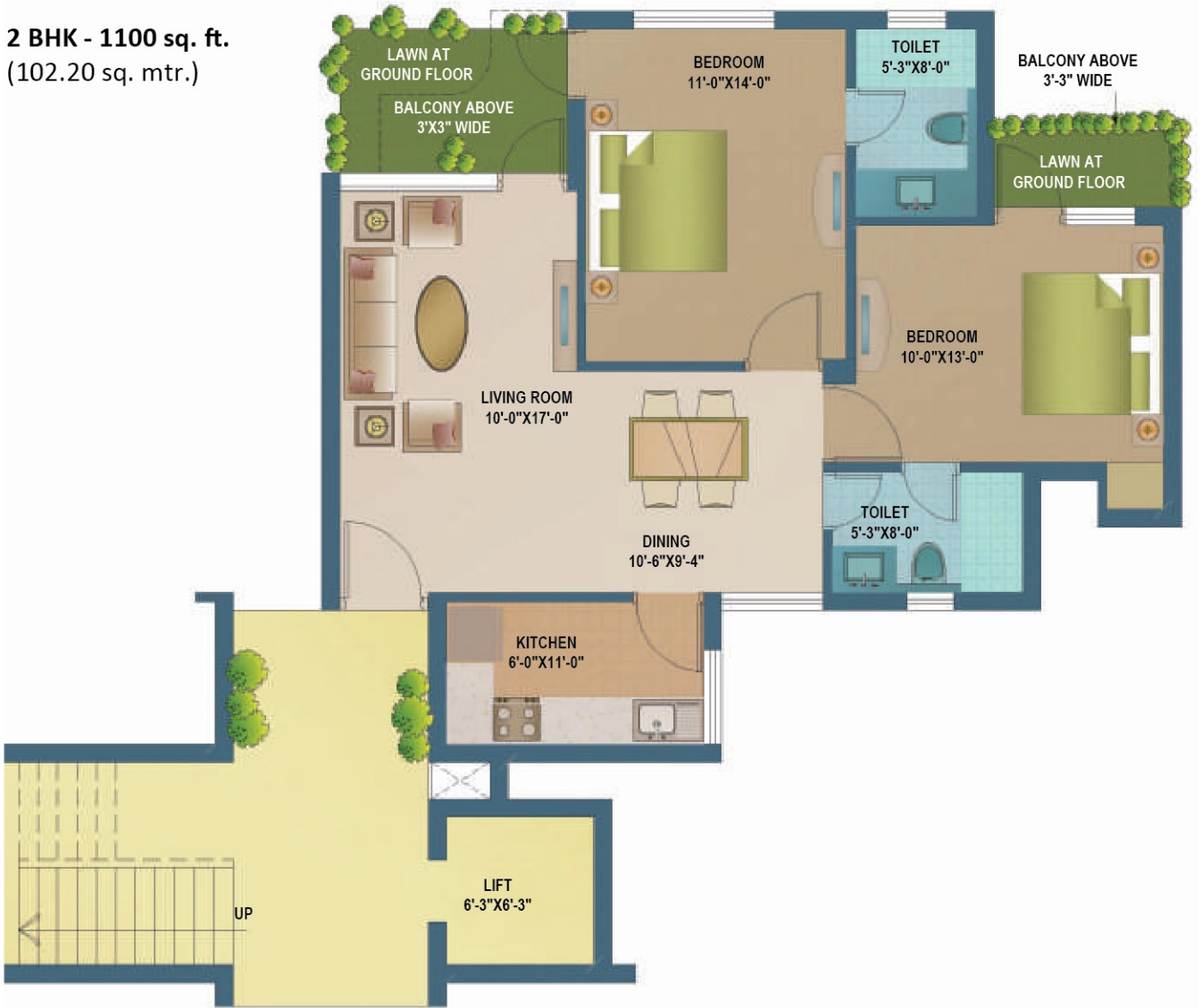
2BHK Cluster Plan