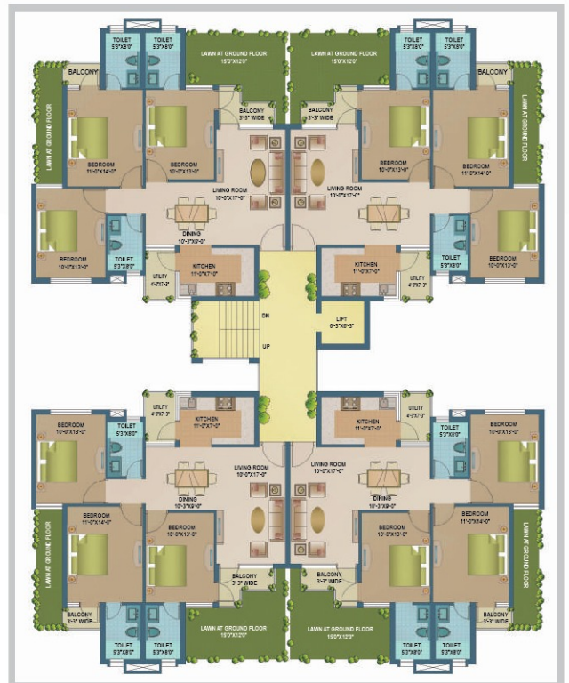
3BHK Cluster Plan