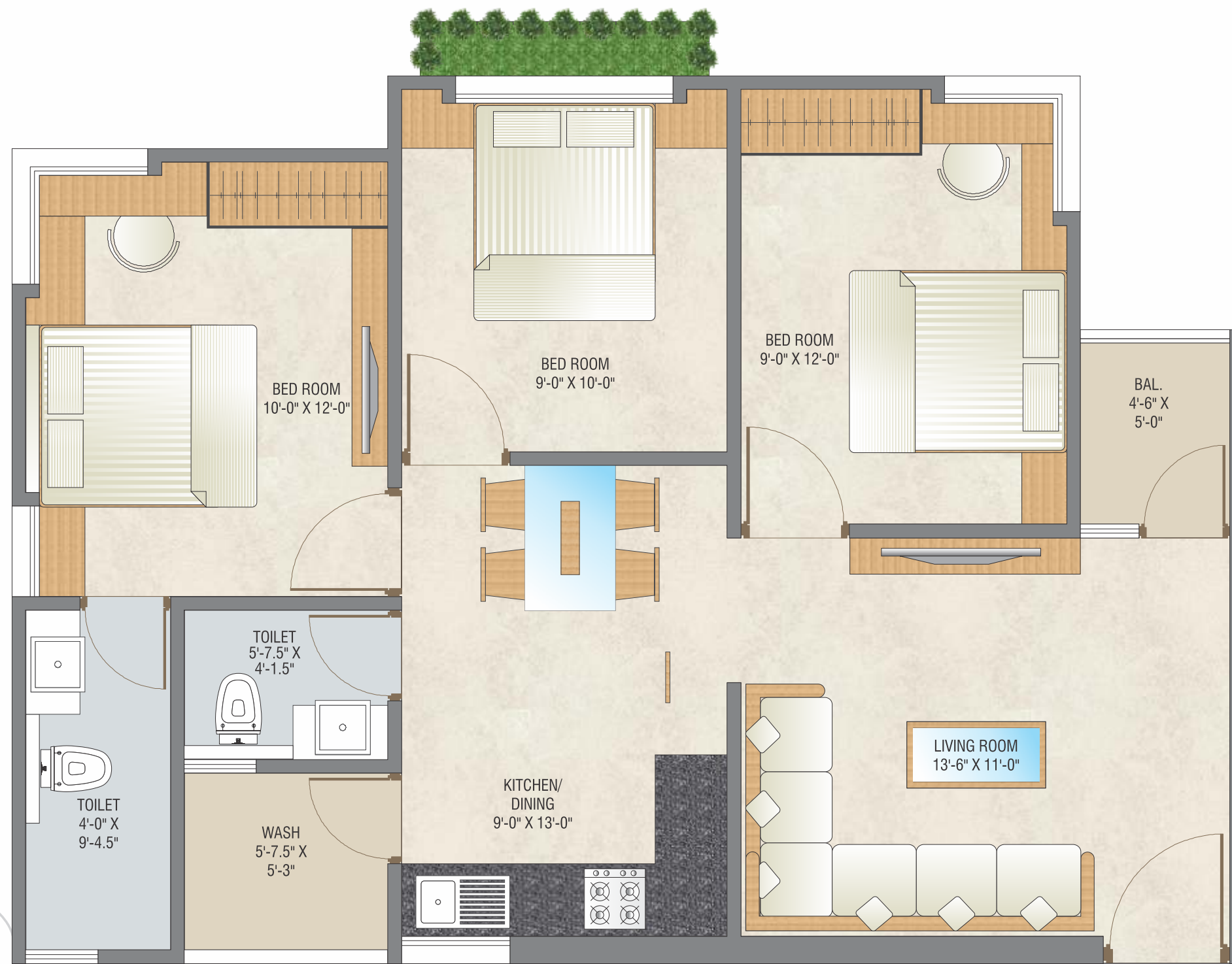
3 BHK 1200 SQFT TYPICAL FLOOR PLAN