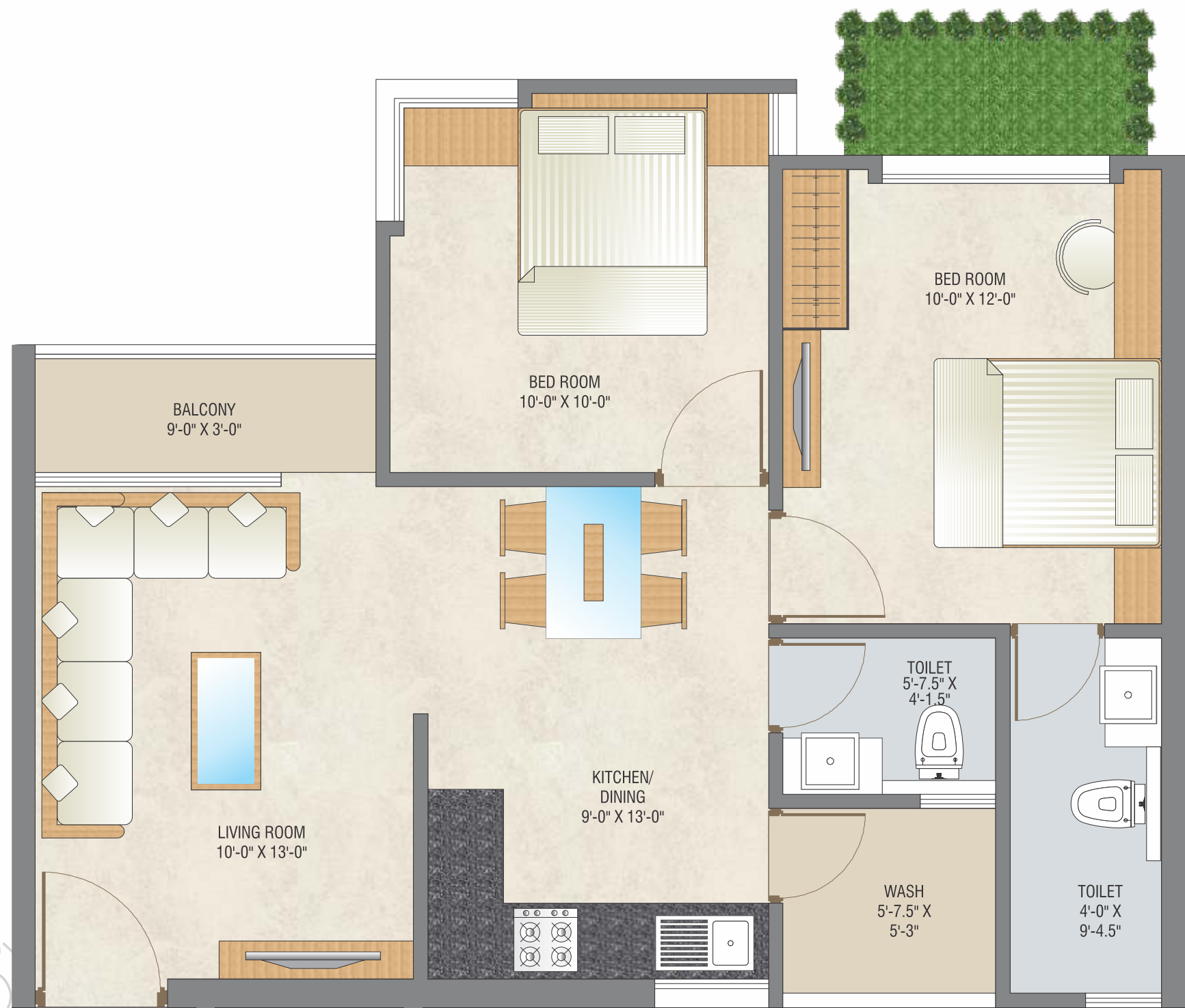
2 BHK 1000 SQFT TYPICAL FLOOR PLAN