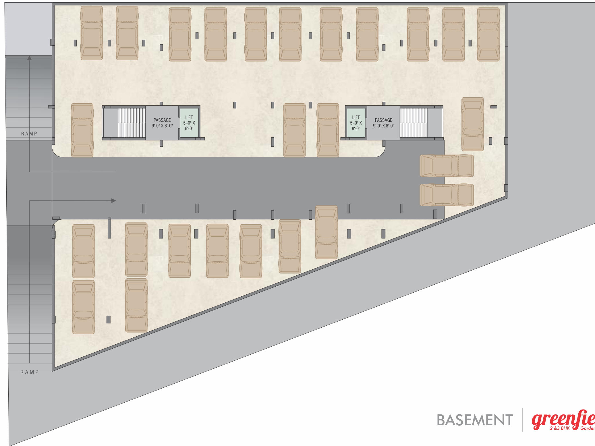
BASEMENT | greenfields 4+ 2 & 3 BHK Garden Flats/Shops