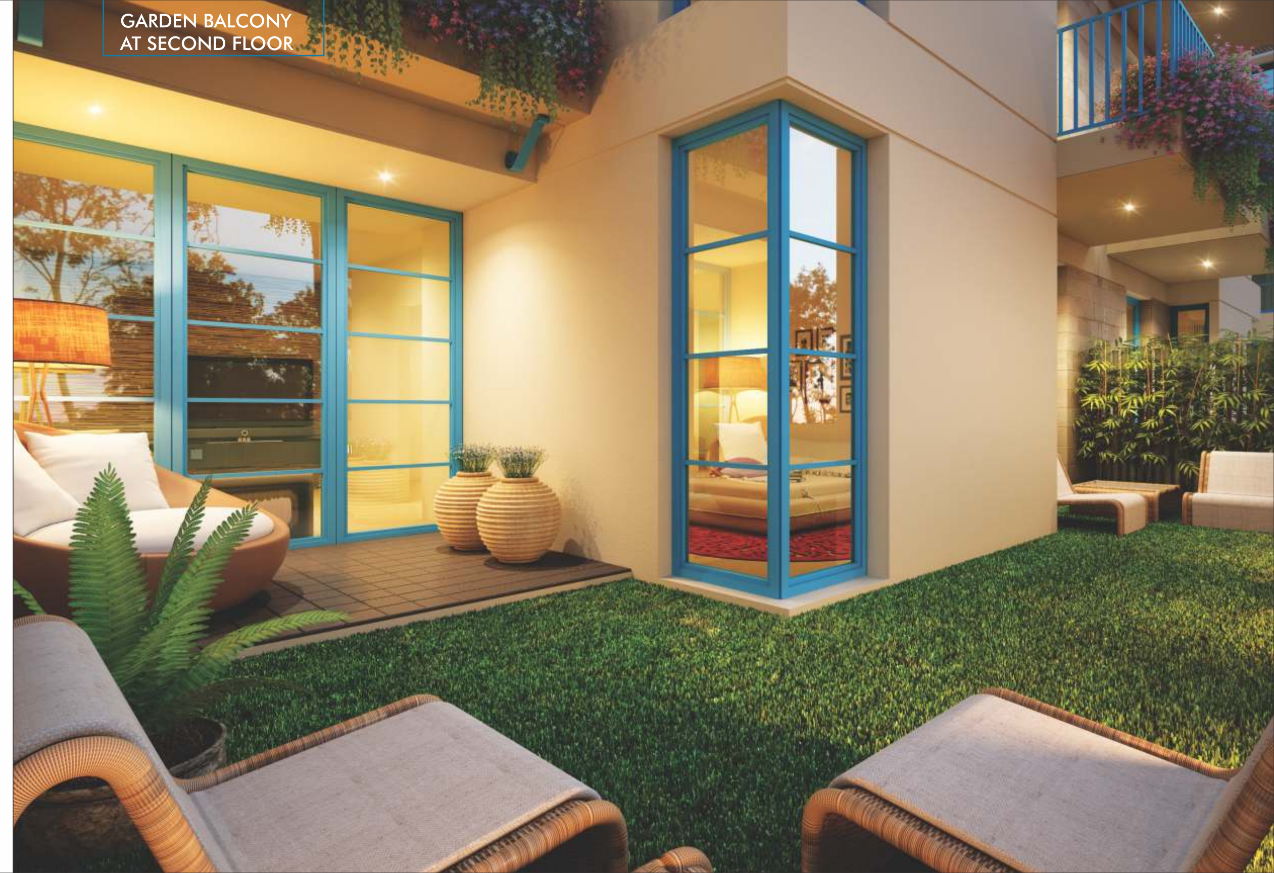
GARDEN BALCONY AT SECOND FLOOR

FIFTH FLOOR | 2 BHK 1000 SQFT 3 BHK 1200 SQFT greenfields 4 + 2 & 3 BHK Garden Flats/Shops