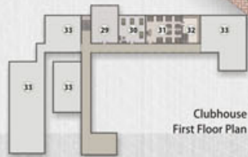
Clubhouse First Floor Plan