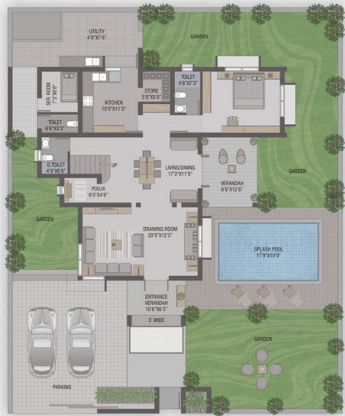
6 | Cottah Ground floor plan | Option 1