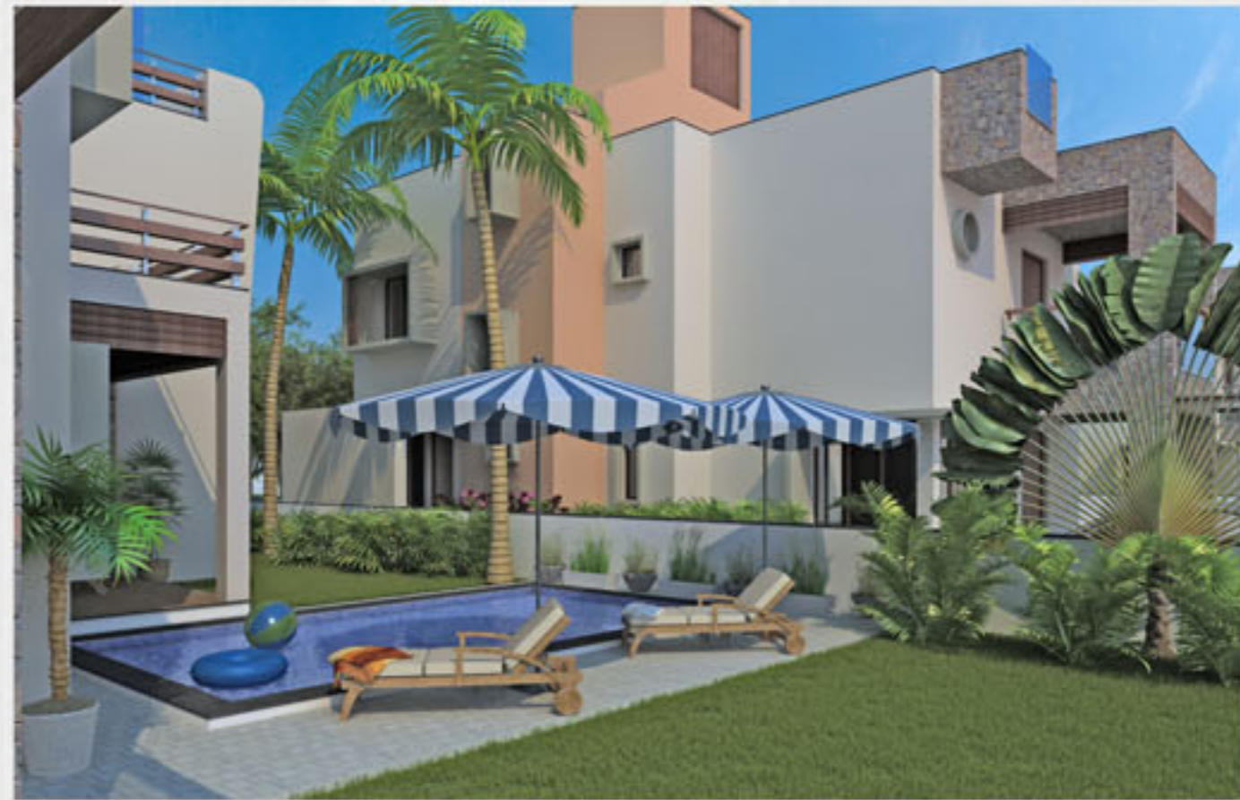
Option 1 | 6 Cottah Terrace floor plan