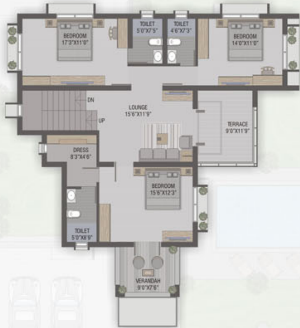
Option 1 | 6 Cottah First floor plan