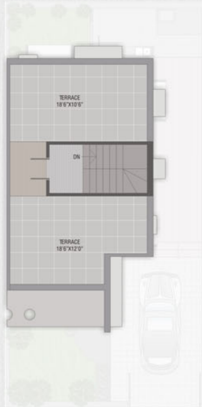
Terrace floor plan