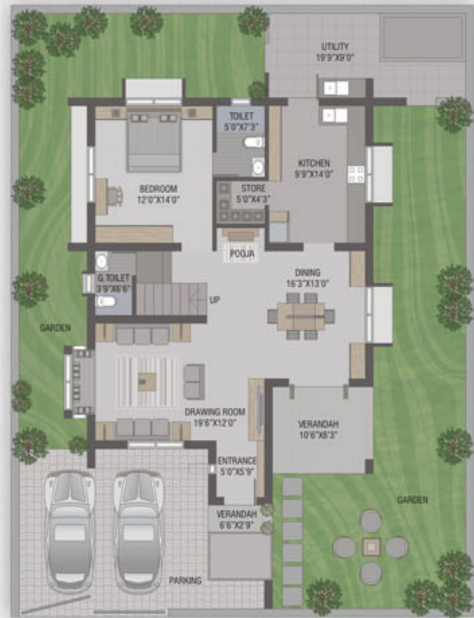
4 Cottah Ground floor plan Option 1