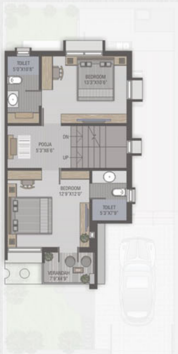
2 Cottah First floor plan