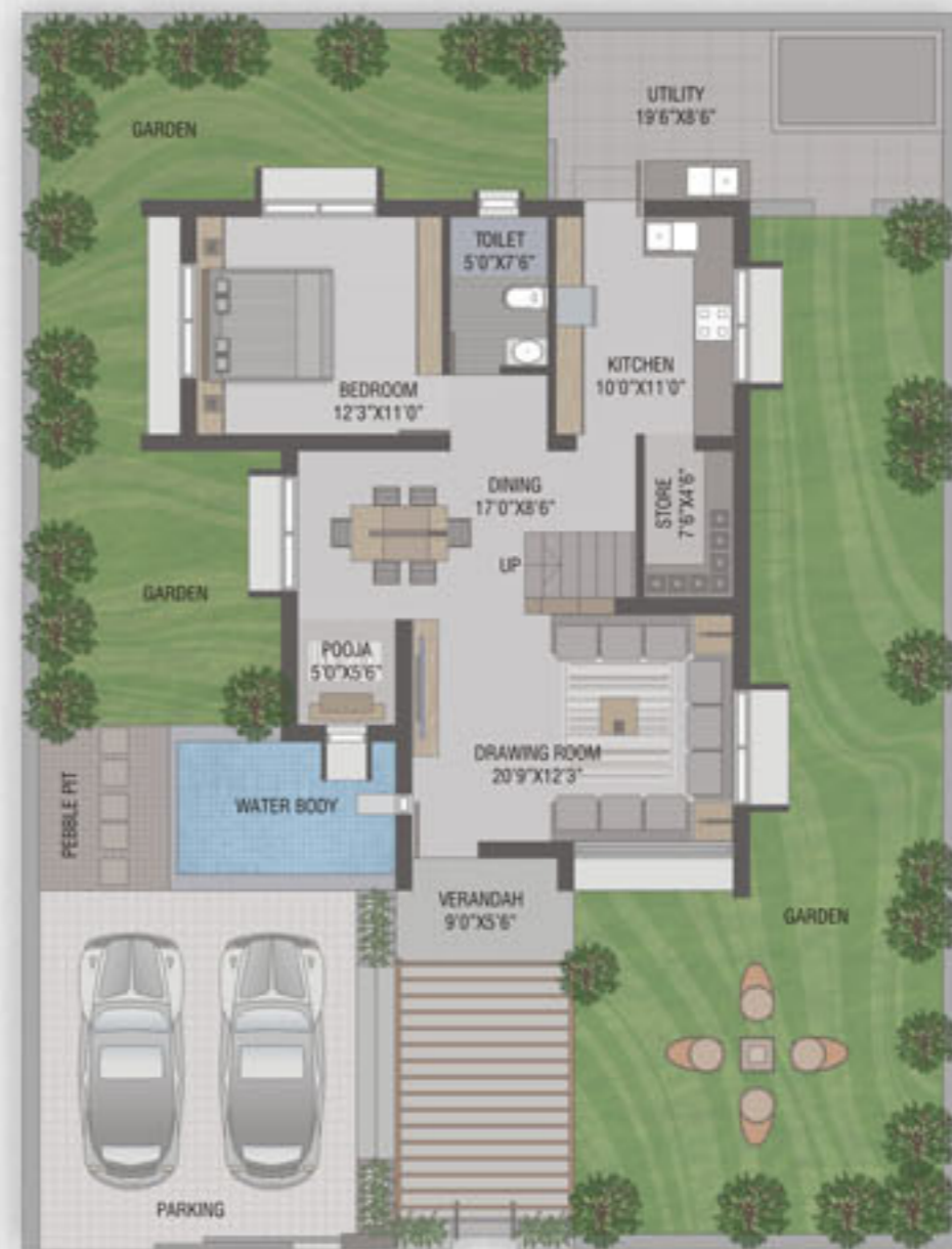
4 Cottah Ground floor plan Option 2