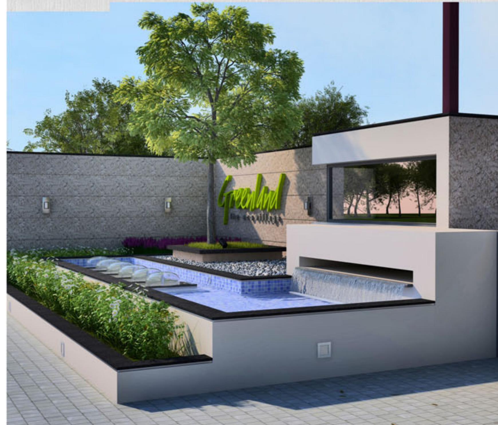
Landscaped scenic view with cascade at the grand entrance