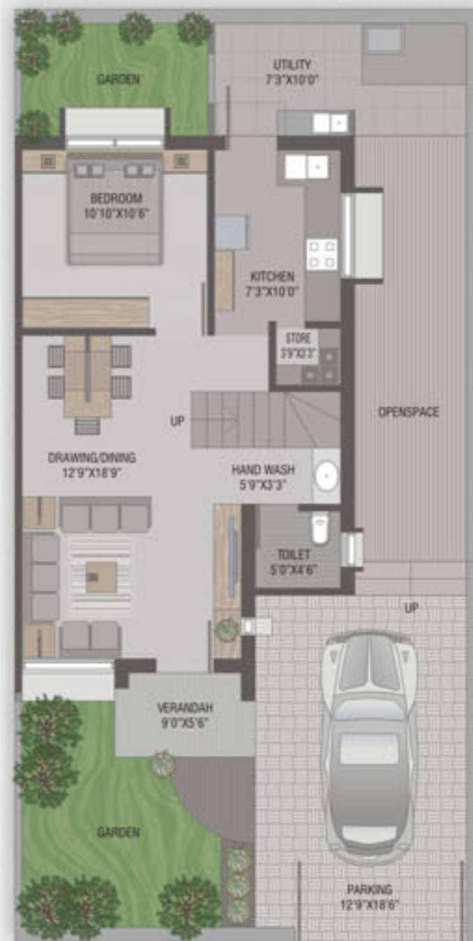
2 | Cottah Ground floor plan