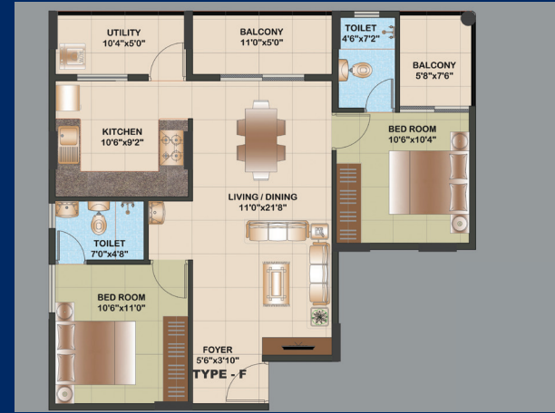
Type - F 2 BHK Saleable area: 1232 sq.ft. 1st to 15th floor