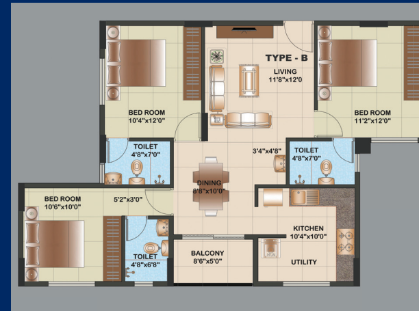
Type - B 3 BHK Saleable area: 1306 sq.ft. 1st to 15th floor