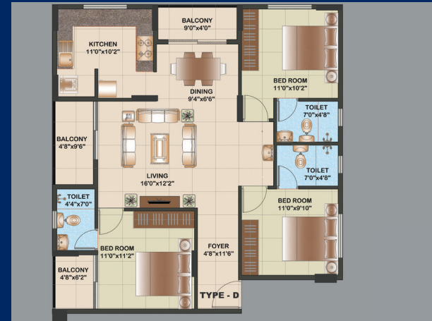
Type - D 3 BHK Saleable area: 1522 sq.ft. 1st to 15th floor