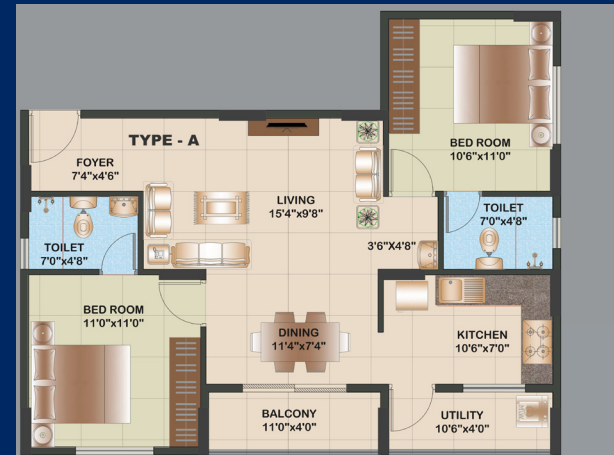
Type - A 2 BHK Saleable area: 1123 sq.ft. 1st to 15th floor

Elania by Sowparnika featuring 90 units of plush luxury apartments in G+15 floors spells comfort. The first of its kind in Changanassery, Elania was crafted to raise the standard of living in this corner of the world. A melange of convenience in the midst of nature and grandness accessible for the lucky few, Elania is set to truly illuminate the path to luxury.