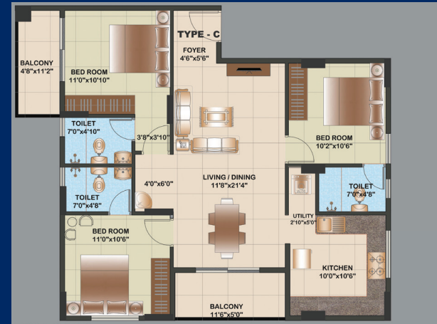
Type - C 3 BHK Saleable area: 1485 sq.ft. 1st to 15th floor