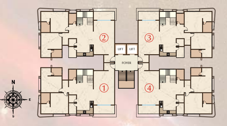
1st @ 11th Floor Plan (Bungalow / Penthouse)