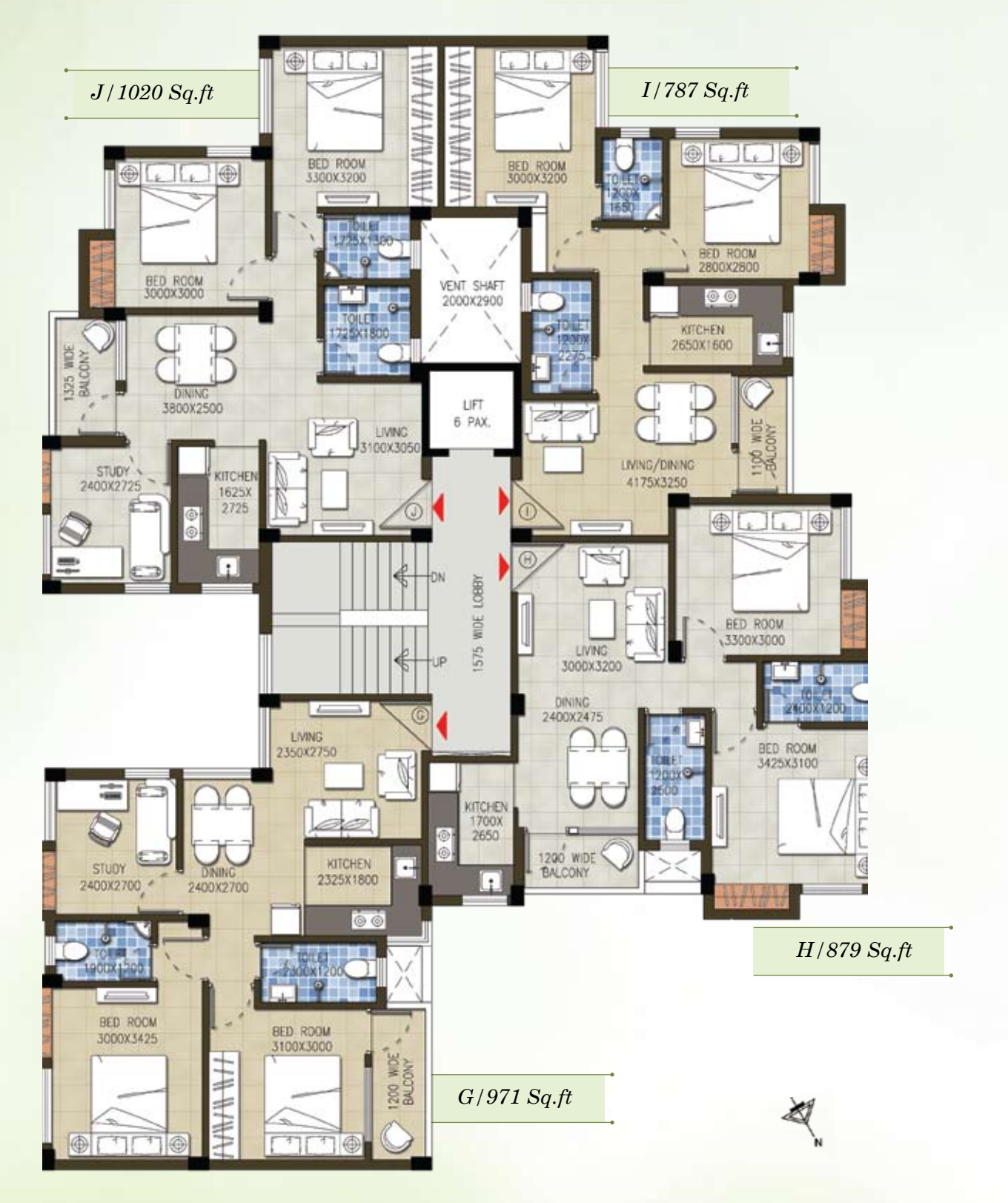
Block -2 (Part-2) (1st to 3rd)