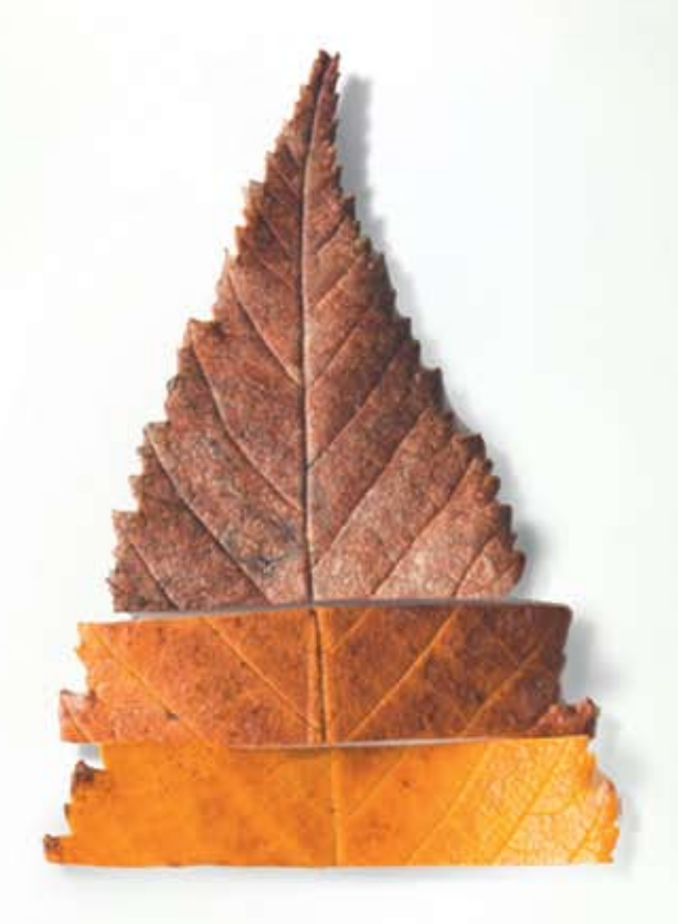
grand. green. gracious.